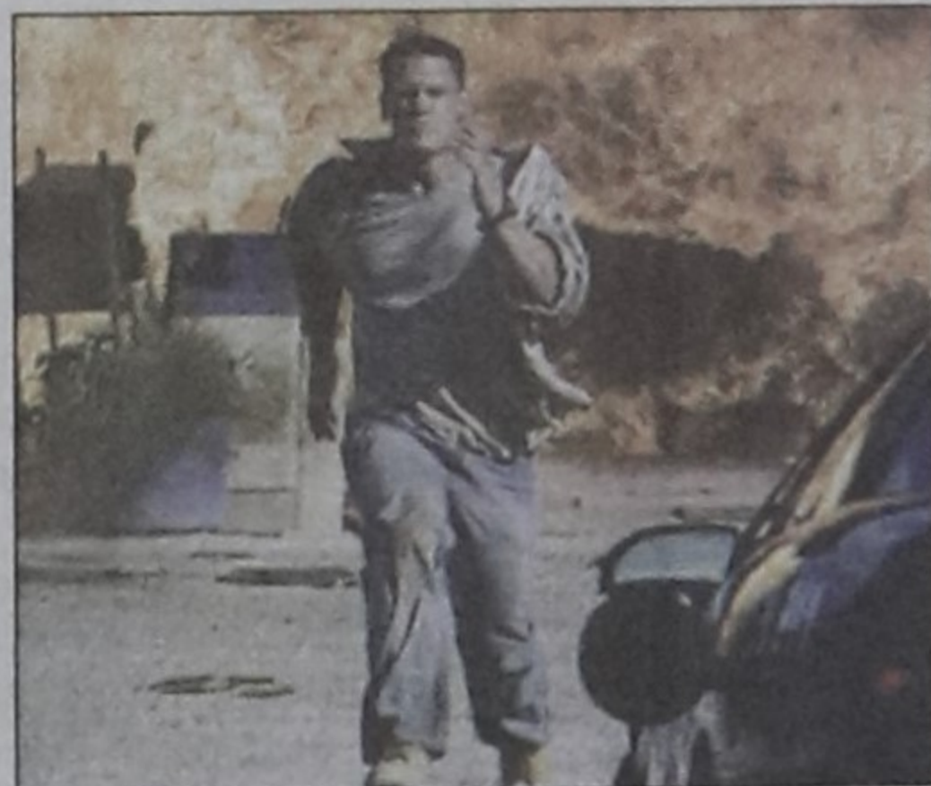
The Marine On Star Movies at 7:00 pm Genre: Action Cast: John Cena, Robert Patrick

All programmes are in local time. The Daily Star will not be responsible for any change in the programme.