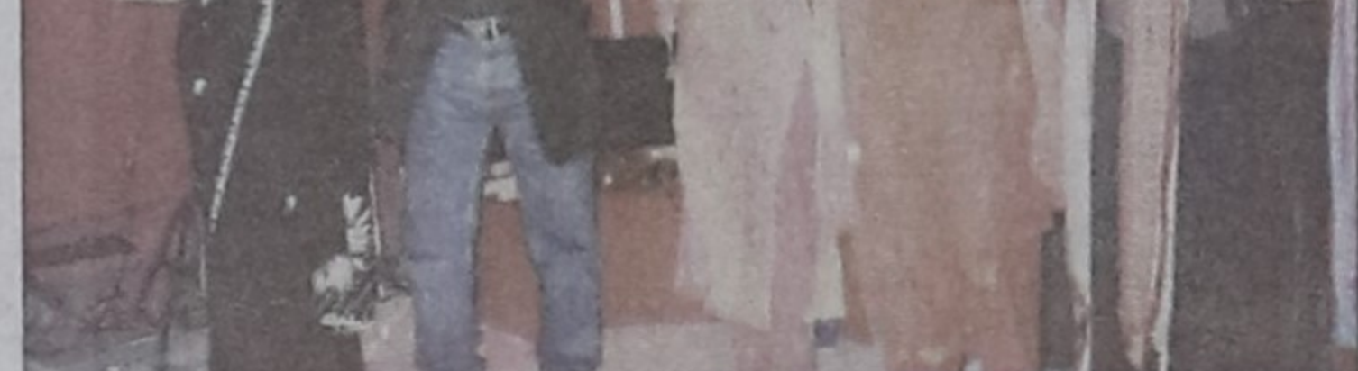
Fakir Alamgir performs at a programme

As part of his tour, Alamgir went to Montreal in Canada, Vienna in Austria, London and Birmingham in UK and other