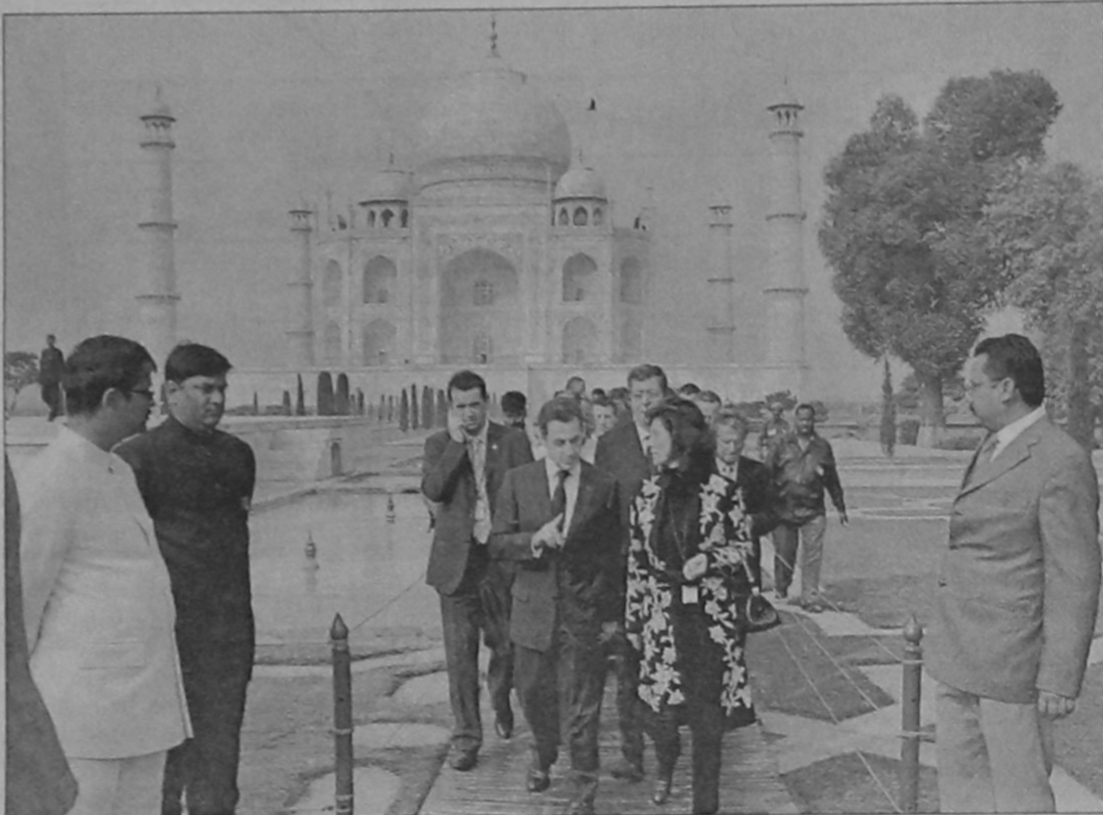
French President Nicolas Sarkozy (C) visits Taj Mahal, India's monument to love, in Agra yesterday. Taj Mahal was sealed off to tourists for a visit by the French President.