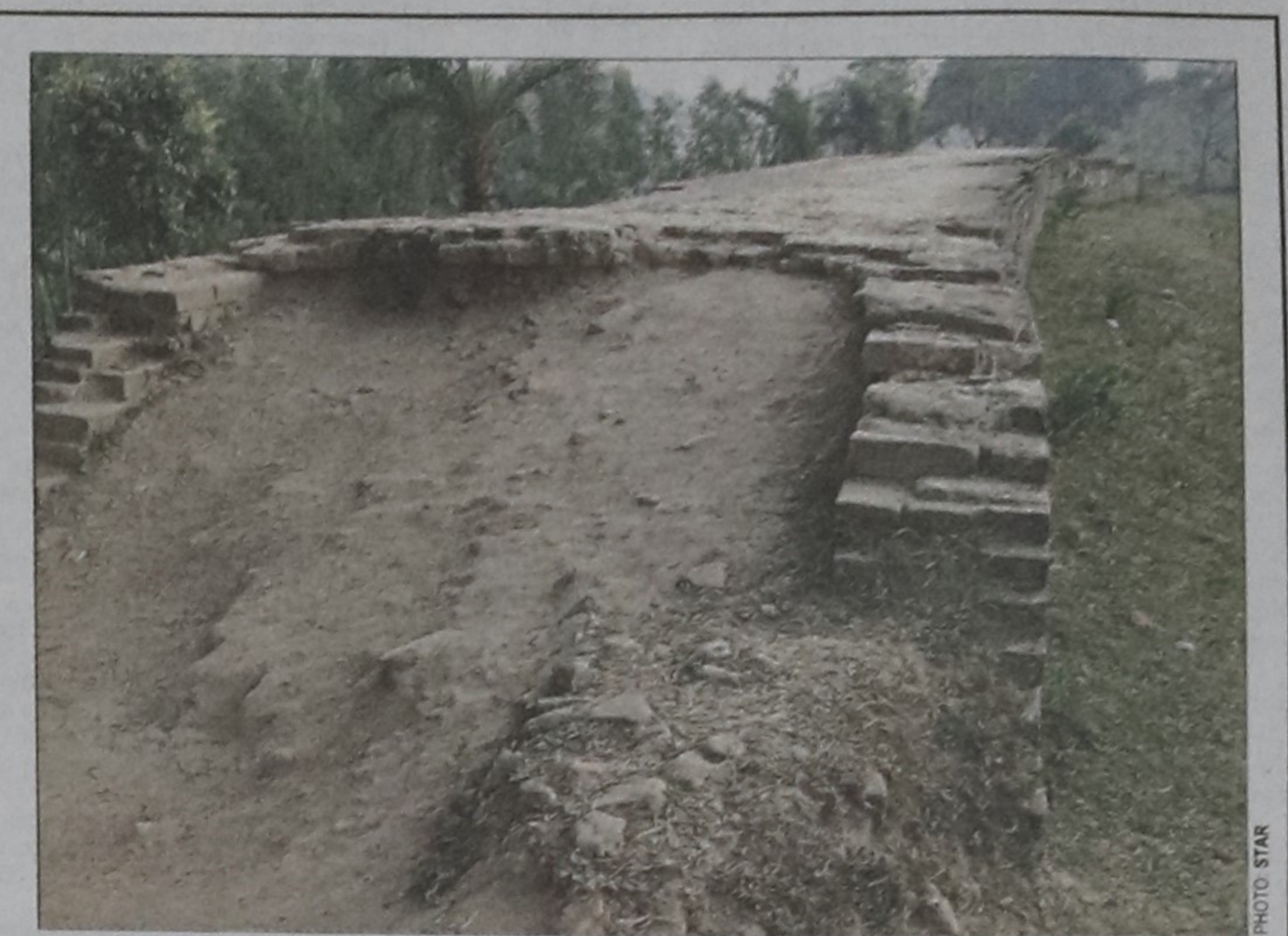
TOP... Locals have taken away bricks from the eastern wall of Pundra Nagar, an archaeological site in Bogra. BELOW... One of many houses built using the stolen bricks.

UNB, Davos, Switzerland Democracy, education and economic development can help fight poverty and extremism, South Asian and Arab leaders observed here Thursday. The unanimous observations came at a panel discussion attended by Chief Adviser Fakhruddin Ahmed, Pakistan President Pervez Musharraf, Afghanistan President Hamid Karzai and Iraq Deputy Prime Minister Barham Salih at the World Economic Forum Annual Meeting 2008 on Quest for Peace and Stability. Fakhruddin and Musharraf promised to hold general elections in their countries in a free and fair fashion and called for economic SEE PAGE 15 COL 3