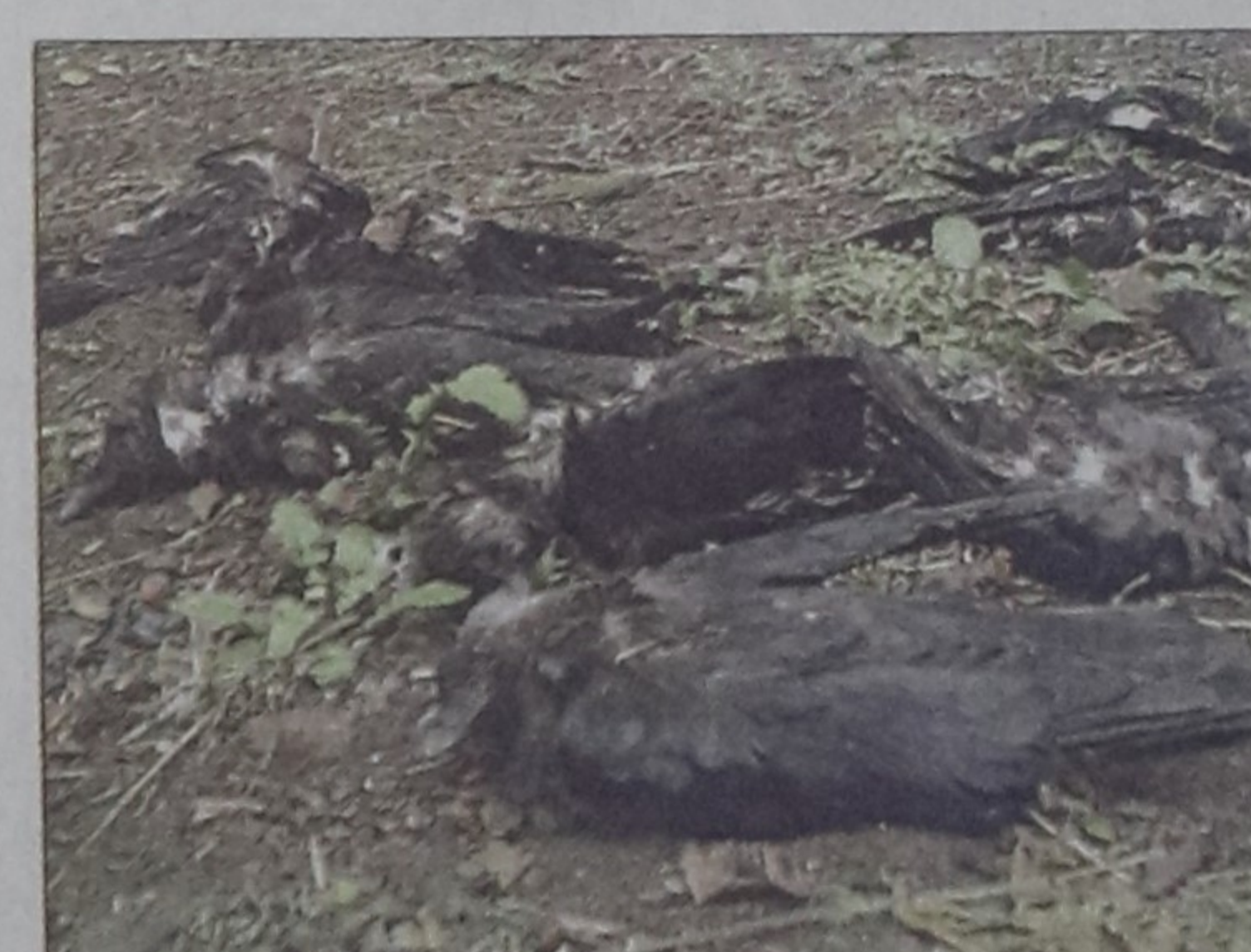
A few of the dead crows at the garden of a house in Dinajpur town. The officials could not ascertain the reason for death.

STAR REPORT Crows in Dinajpur town and its adjacent areas are dying in large numbers while at least 4,700 poultry birds were culled in the district as they were infected with bird flu. Locals and district livestock officials said over 400 crows died in the last two days in the town and are rotting in the open, our Dinajpur correspondent reports. Locals of Munshipara and Barabandar said crows were seen