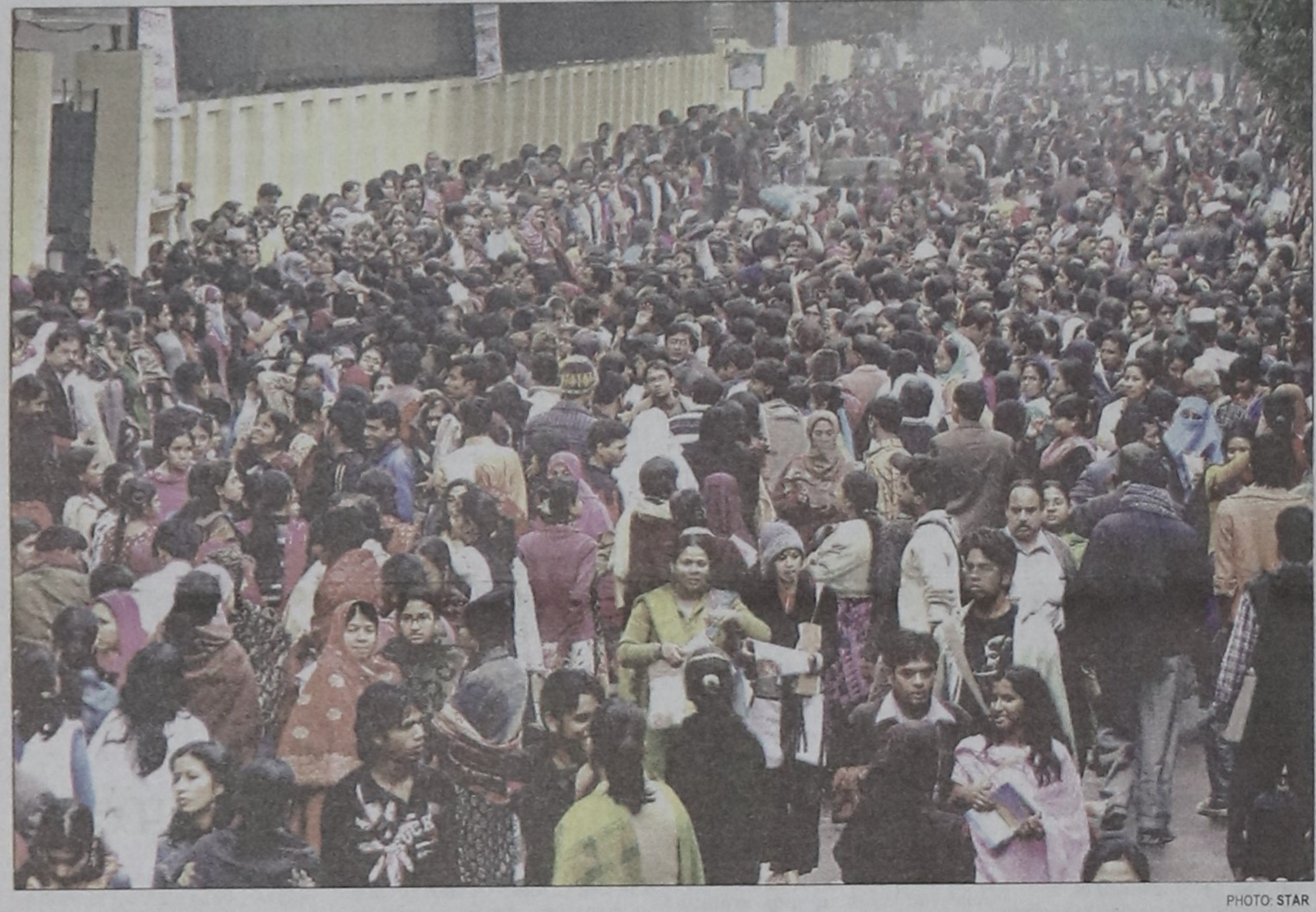
Parents and HSC examinees under Bangladesh Open University clog the street in front of Eden Mohila College in the capital after an examination yesterday.