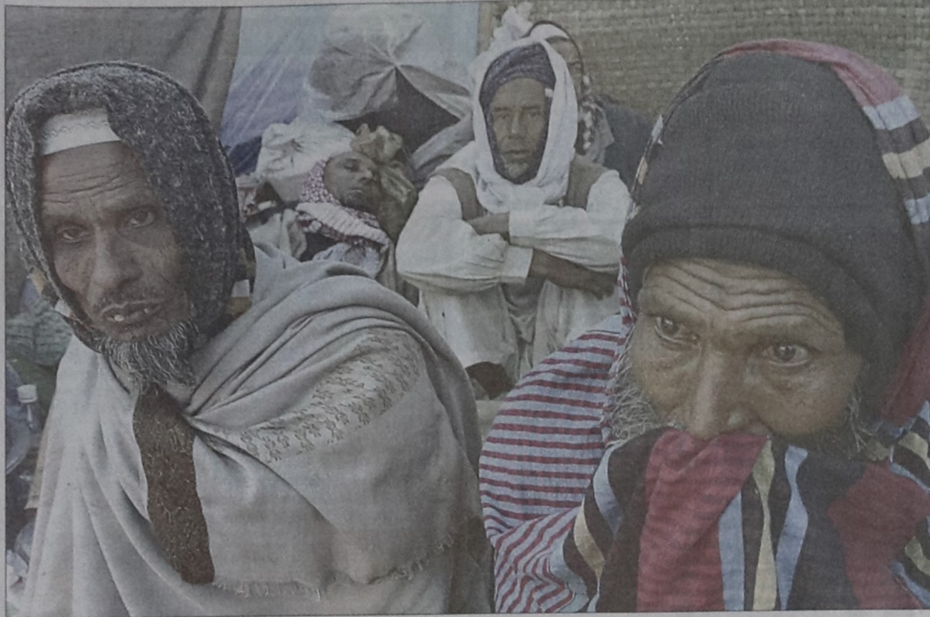
Devotees wrap up in warm clothes on the Biswa Jitema ground at Tongi as inclement weather made them suffer a lot yesterday. The three-day Jitema begins today.