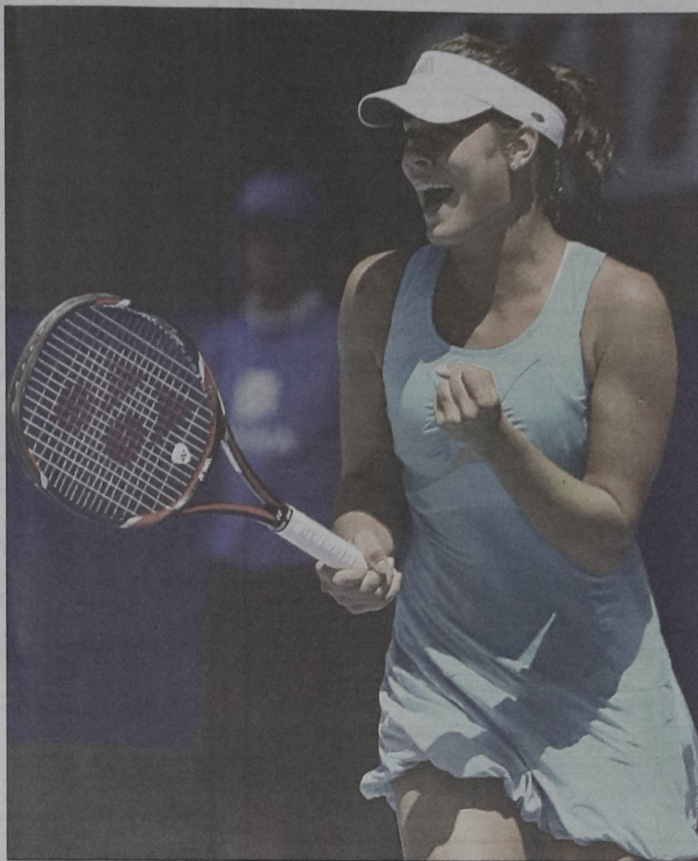
Serbian star Ana Ivanovic is ecstatic after beating USA's Venus Williams in the quarterfinal of the Australian Open in Melbourne on Wednesday.

"She's had a great run ... a lot of good wins," Ivanovic said. "She obviously has a lot of confidence coming into the semifinal."