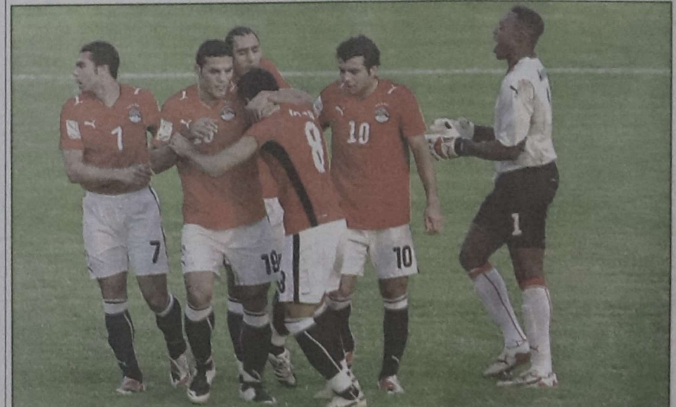
Cameroon goalkeeper Carlos Kameni (R) protests a goal as Egypt players celebrate during their African Cup of Nations match in Kumasi on Tuesday.