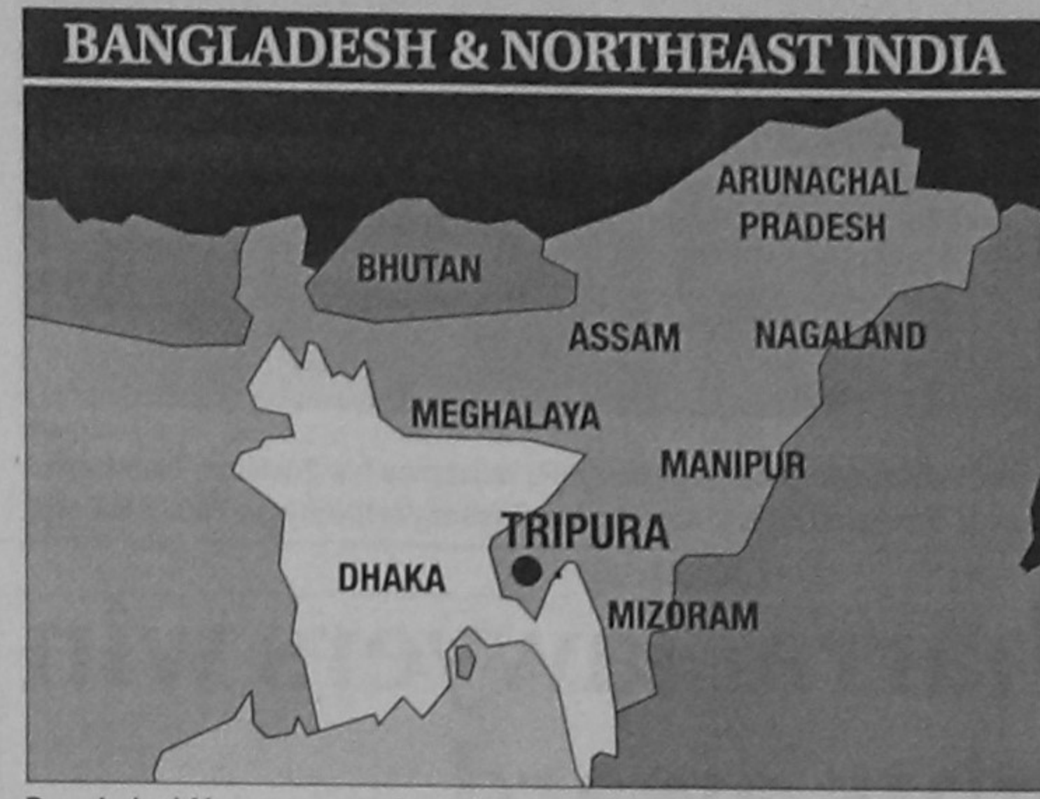
Bangladeshi beverage producer Pran sees huge potential for its products in Northeast India's market, building a new plant in Tripura.