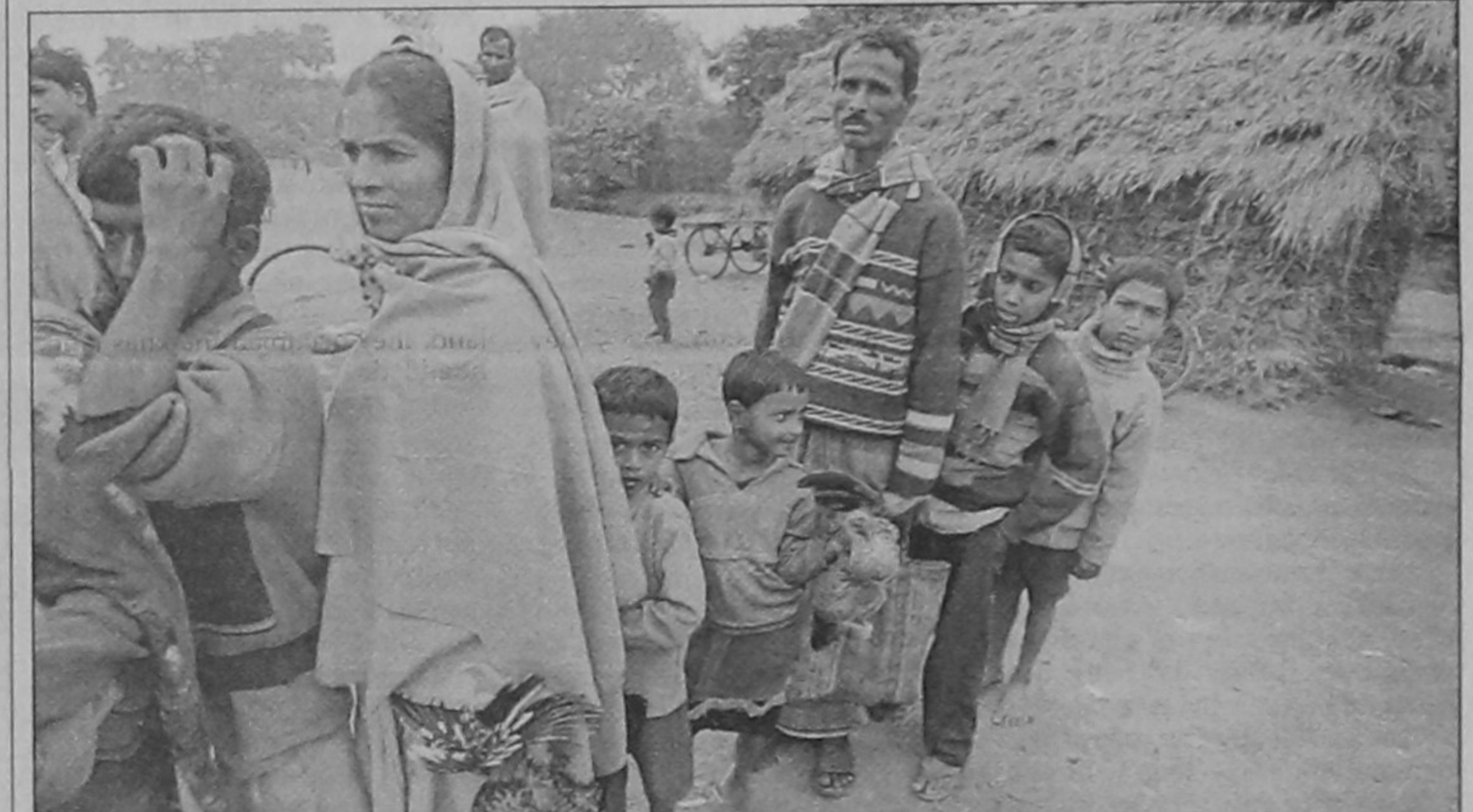
Indian villagers stand in a queue to give their chickens for culling to the health workers at Haribati village in Murshidabad district, some 330-km north of Kolkata, yesterday as bird flu spreading fast in the Indian state of West Bengal.