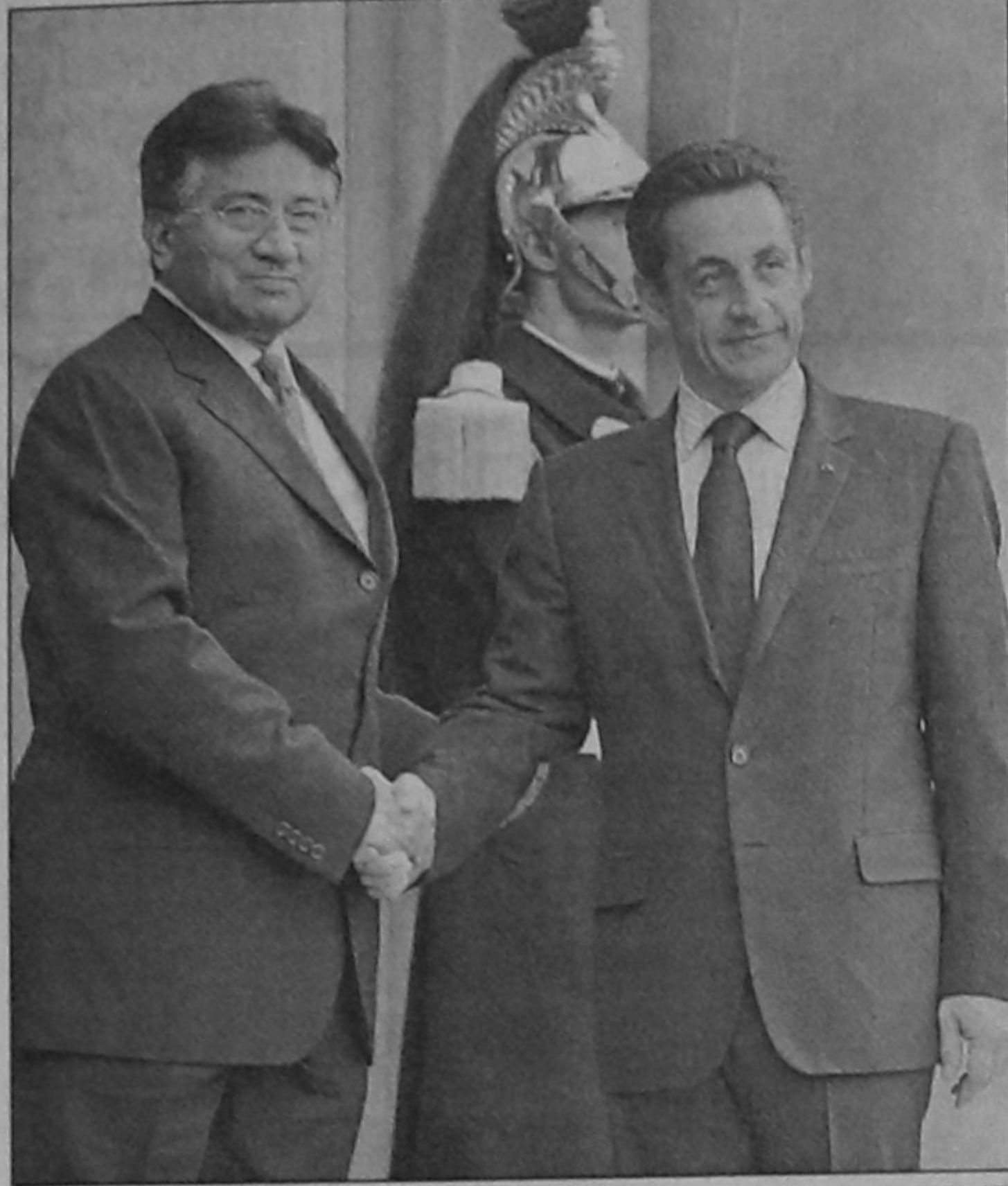
French President Nicolas Sarkozy (R) welcomes his Pakistani counterpart Pervez Musharraf prior to a meeting on Tuesday at the Elysee Palace in Paris.

The guerrillas have made no comment, but released pictures of the Tiger leader at meetings with his fighters.