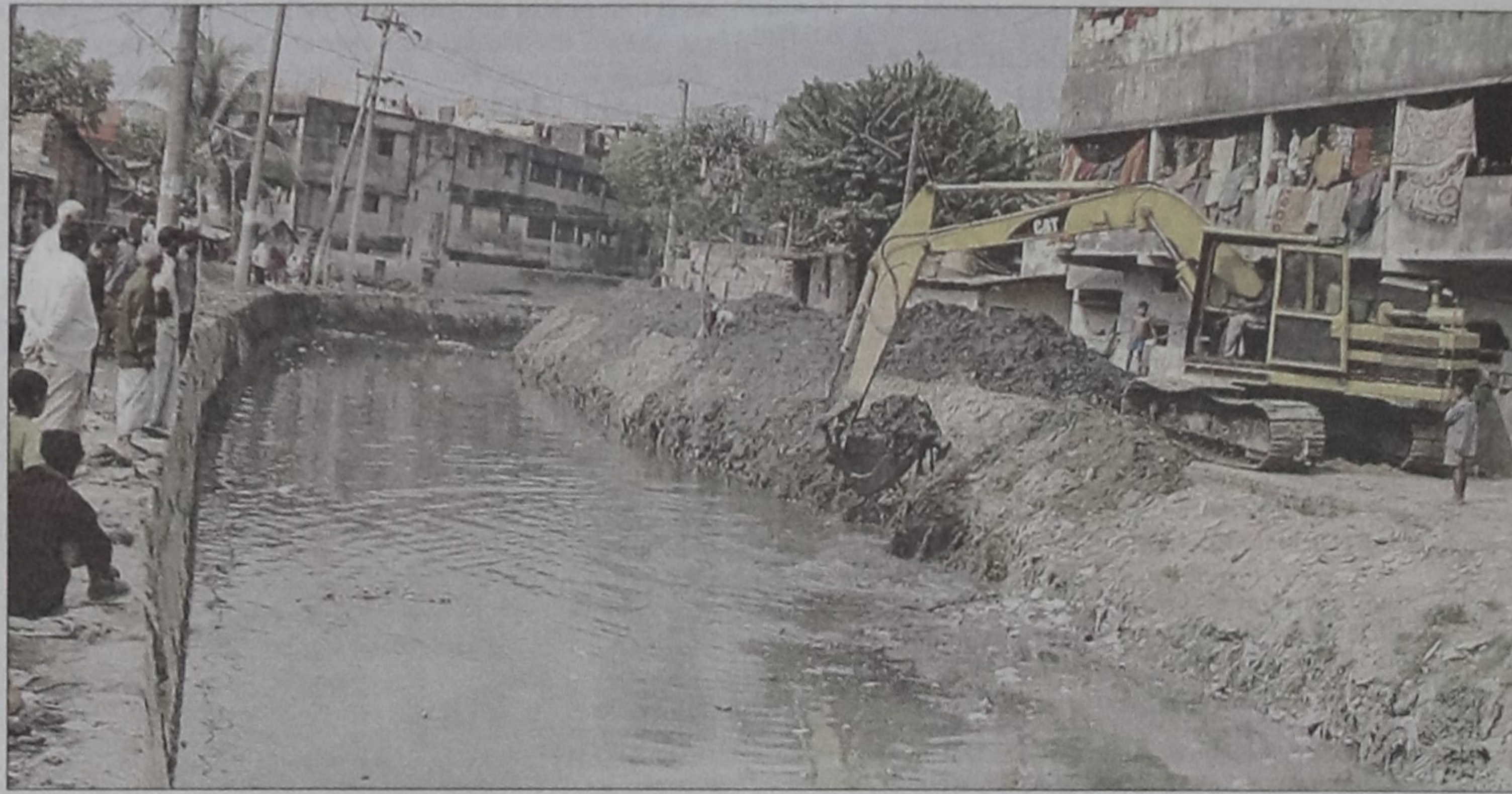
Dredging of Chaktai canal is going on in full swing at Bakalia in the port city.

up to 12 to 15 feet deep and 20 to 30 feet wide on an average," said Superintendent Engineer Mohammad Abu Saleh of CCC Division 1.