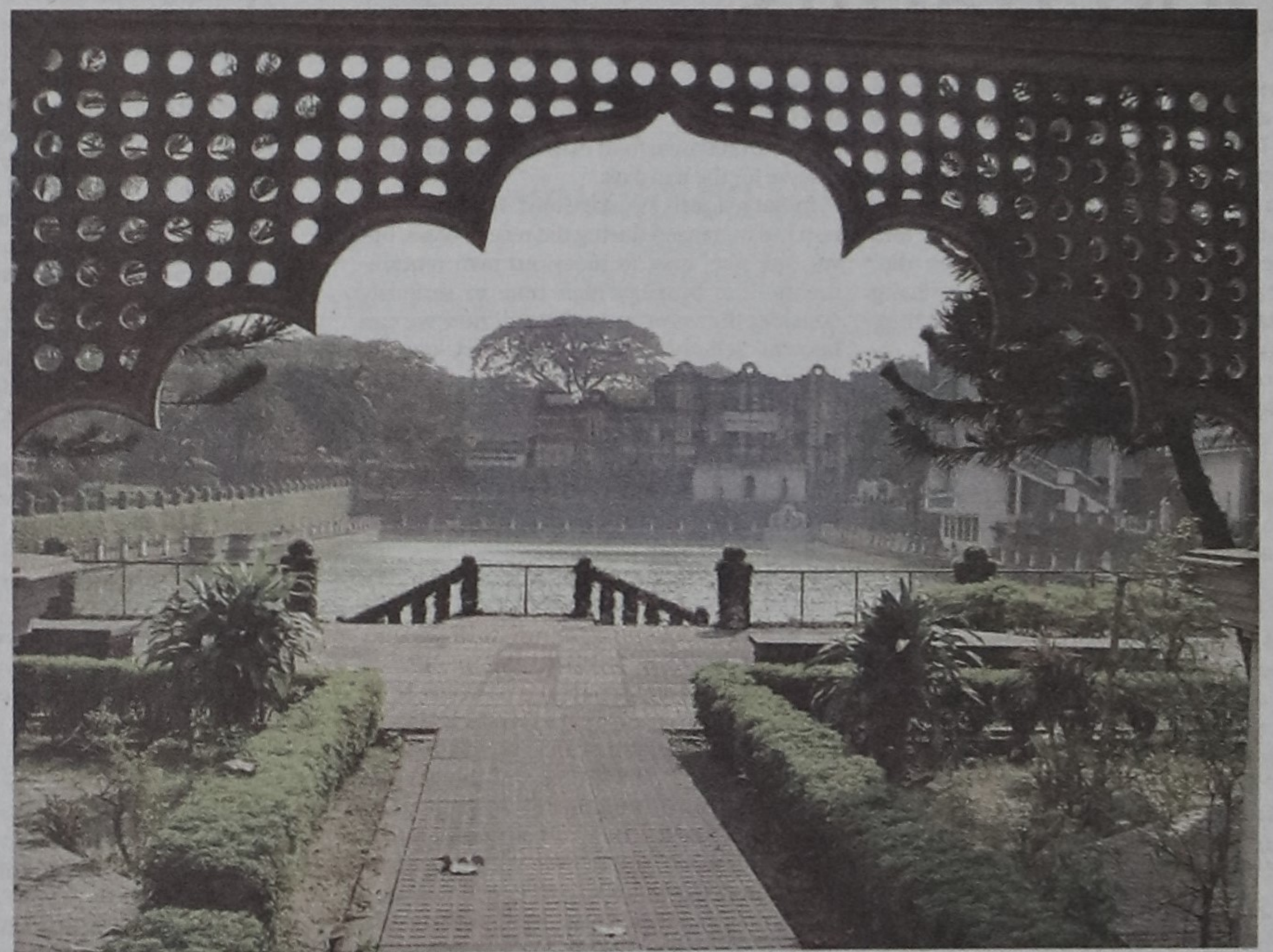
Laldighi Park was closed the very next day after its formal inauguration on January 18, ten years after the completion of its development work involving Tk 2.5 crore. The Chittagong City Corporation authorities show non-printing of entry tickets as the reason for not opening the park to the public, disappointing a good number of visitors.