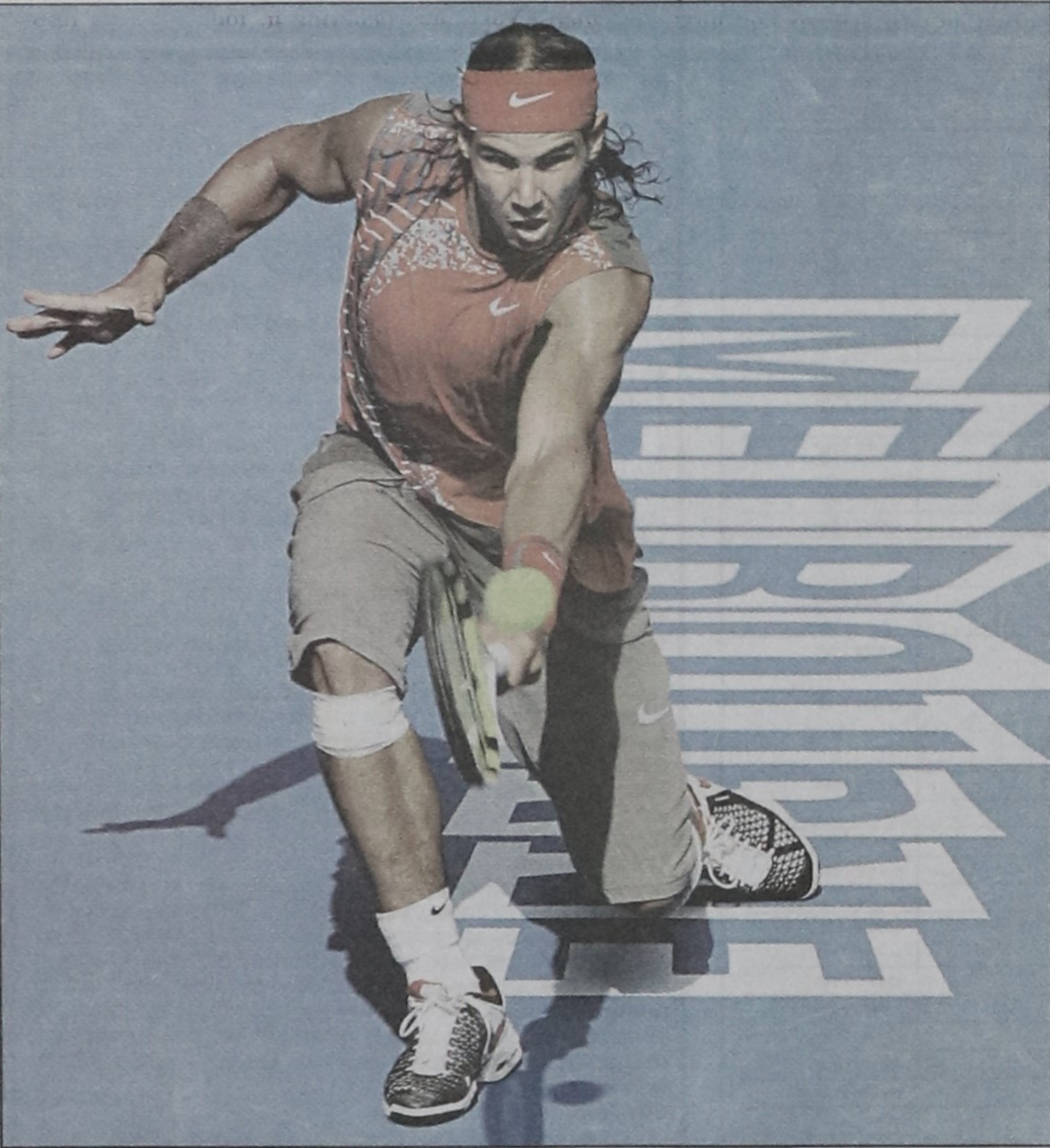
Spanish Rafael Nadal stretches to make a backhand return during his quarterfinal match against Finnish opponent Jarkko Nieminen at the Australian Open in Melbourne on Tuesday.