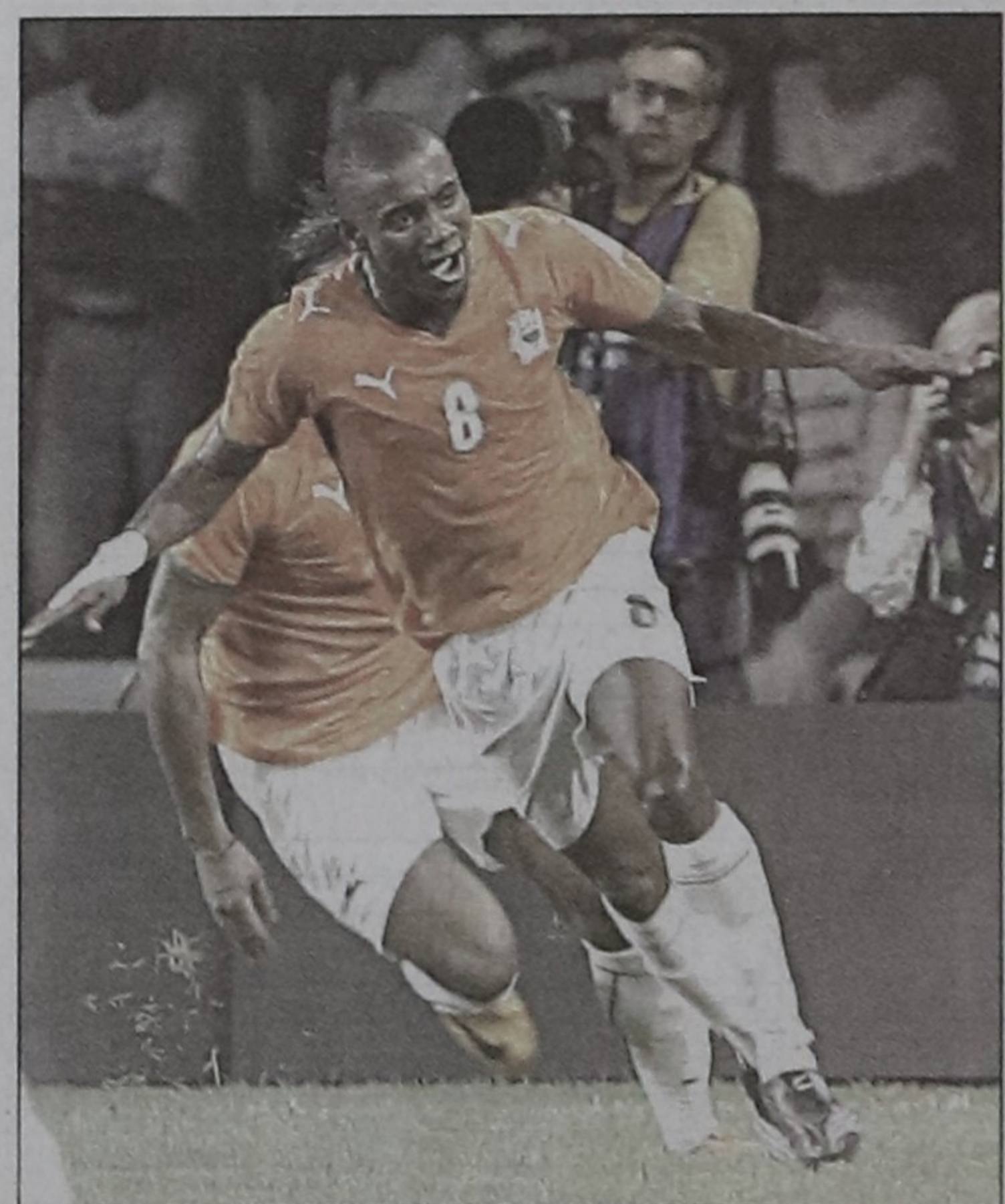
Ivory Coast striker Salomon Kalou is overjoyed after their victory over Nigeria in the African Nations Cup in Sekondi on Monday.