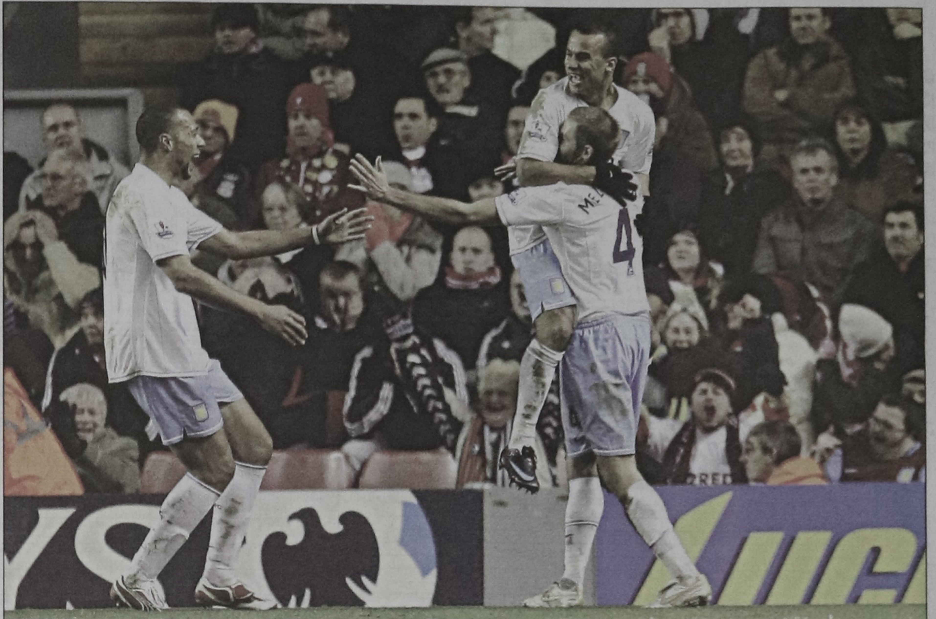
Aston Villa striker Gabriel Agbonlahor (C) jumps on defender Olof Mellberg (R) to celebrate his team's second goal against Liverpool during their Premiership encounter at Anfield on Monday.

But Crouch produced one in the 88th minute to earn Liverpool a point. Aurelio's free-kick hit Jamie Carragher and gave the England striker the space to lob over Stuart Taylor.