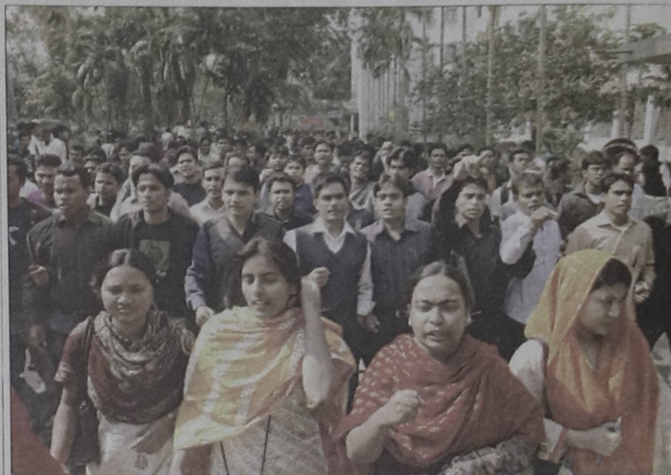
Students of Dhaka University bring out a procession on the campus yesterday afternoon, protesting conviction of their teachers and a fellow student and demanding their release. The detainees were freed in the evening.