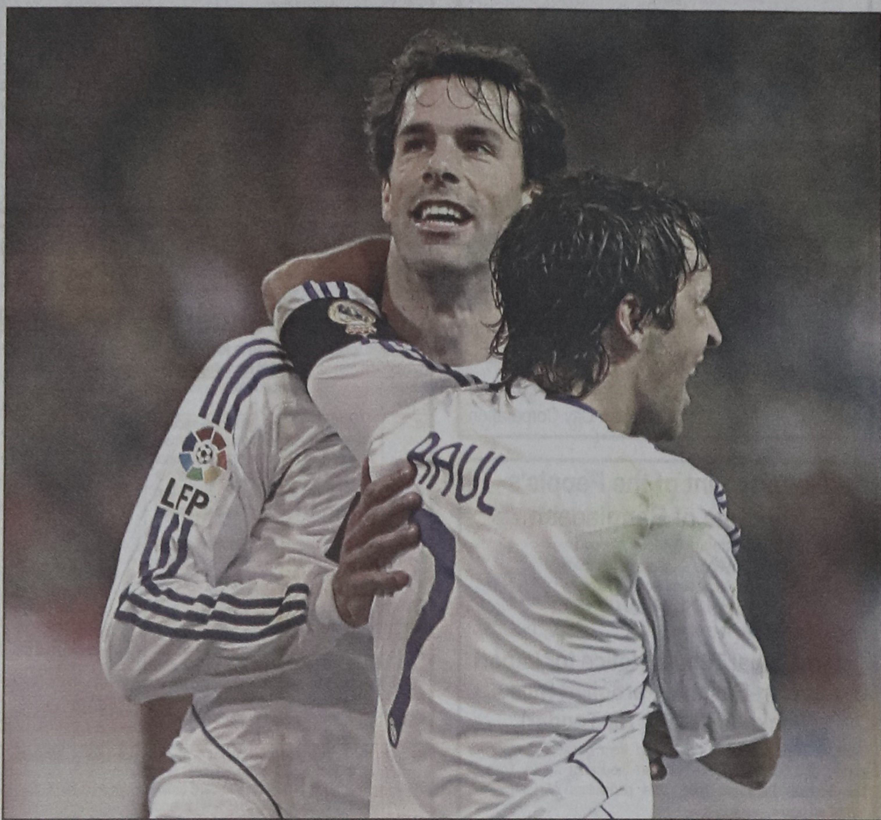
Real Madrid strikers Ruud van Nistelrooy (L) and Raul celebrate after the former scored in their derby match against Atletico Madrid at the Vicente Calderon on Sunday.

"Reading always make it tough for us. We ran so much that we clocked up more kilometres than we have in any game this season."