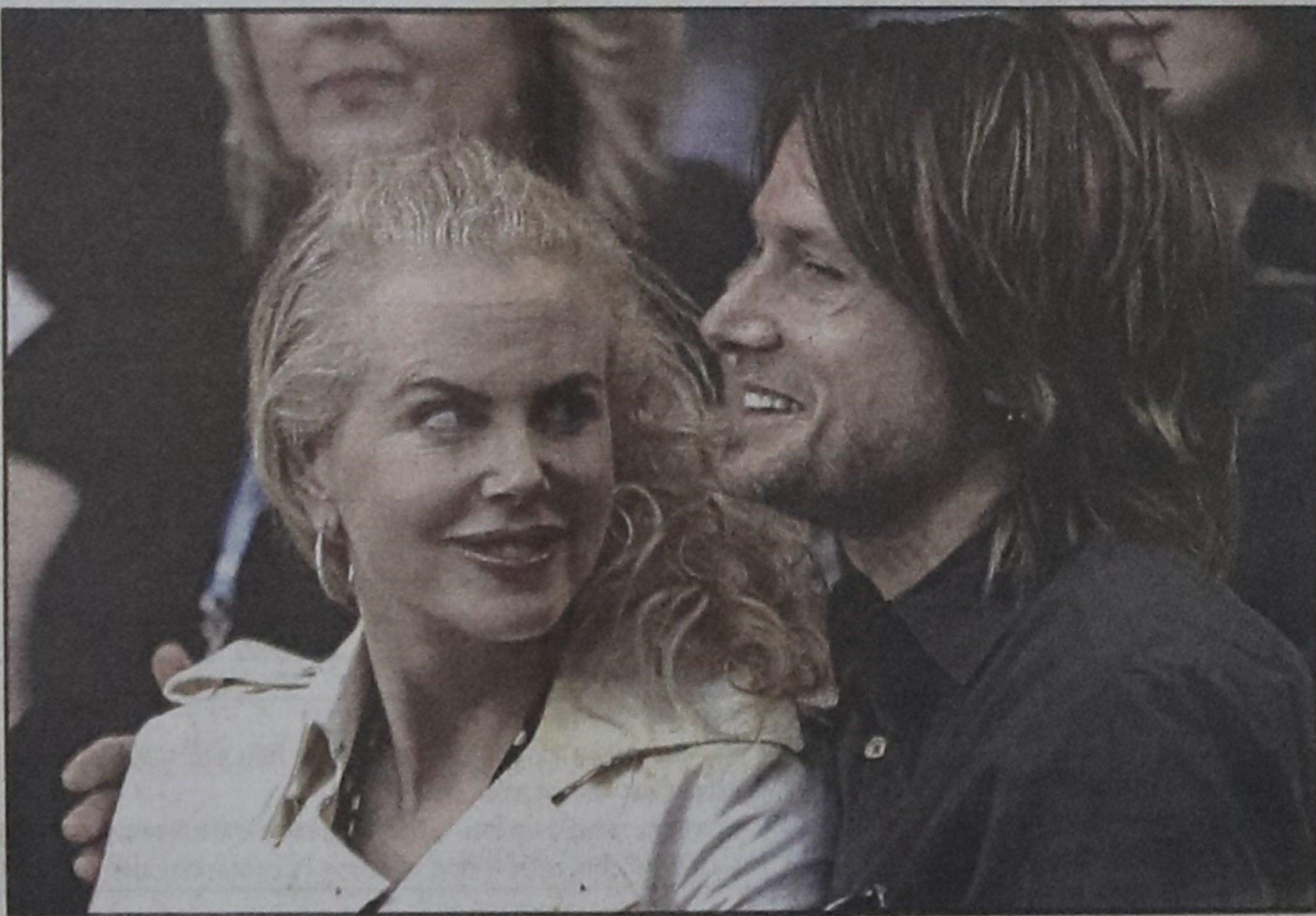
Hollywood actress Nicole Kidman (L) and her husband, singer, Keith Urban watch the men's fourth round match between Lleyton Hewitt and Novak Djokovic at the Rod Laver Arena in Melbourne on Monday.