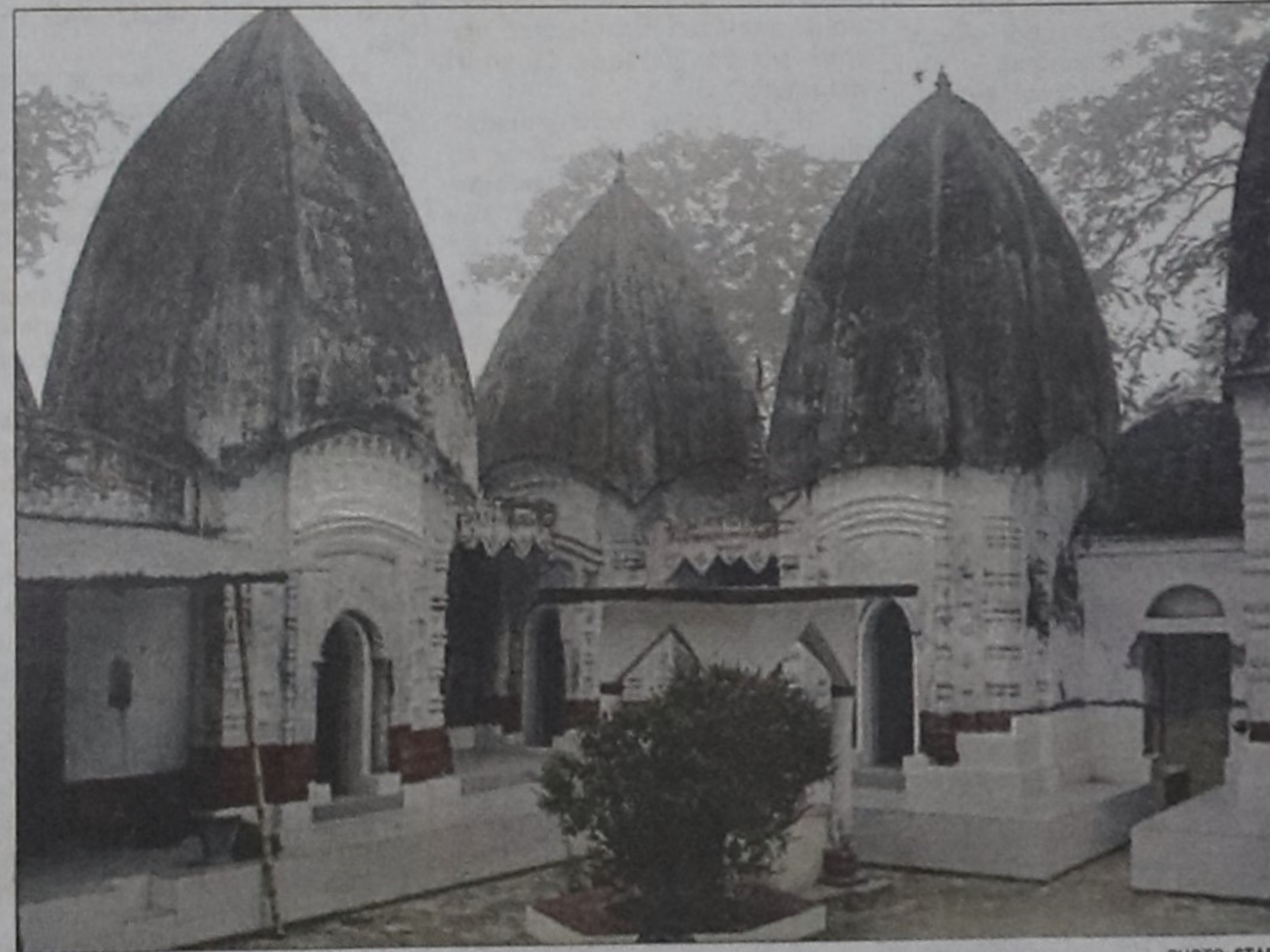
The early 7th century temples in Joypurhat decorated with terracotta plaques, which were indiscreetly painted white recently.