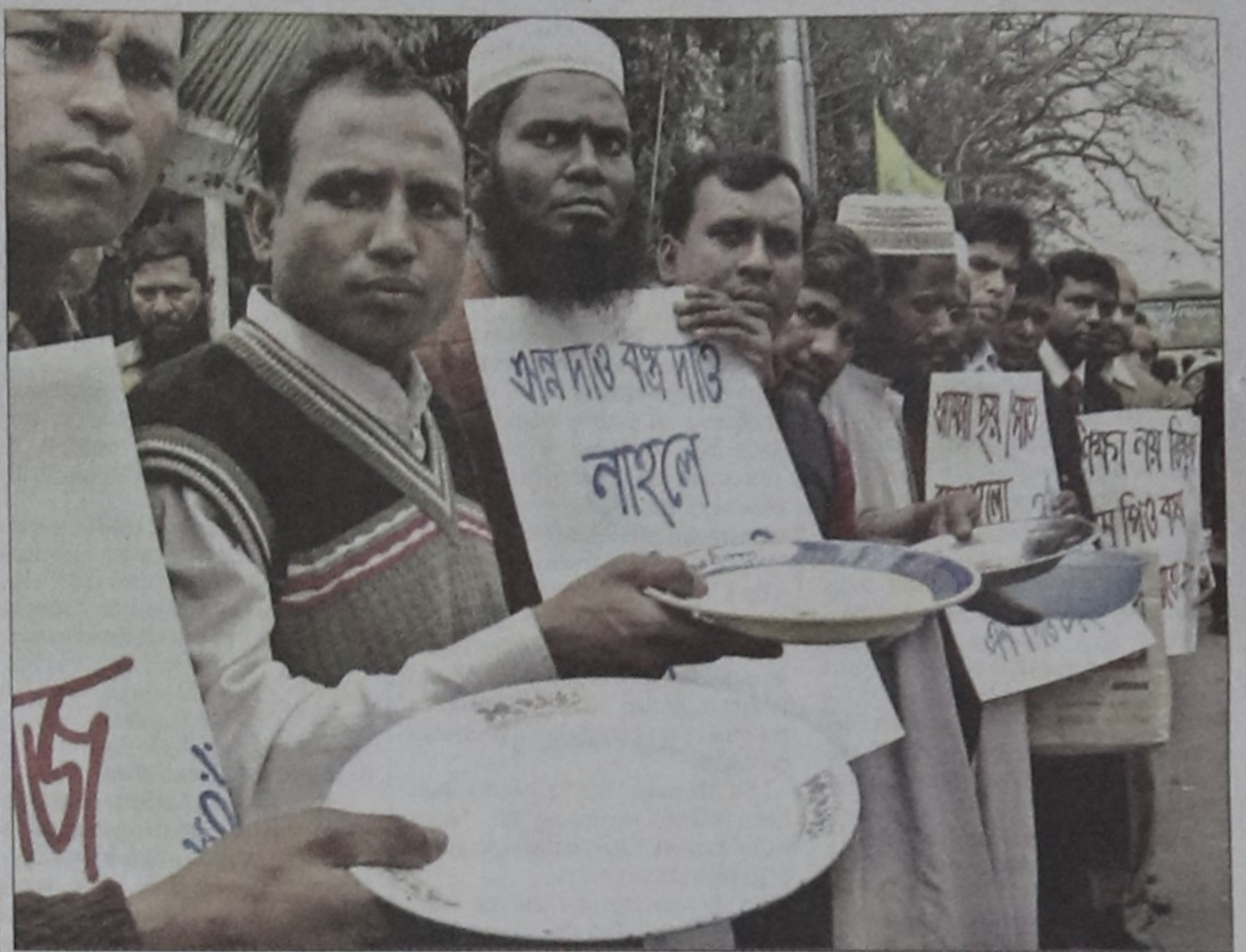
Teachers and employees of non-government educational institutions stage a demonstration at the Jatiya Press Club in the capital yesterday demanding that their jobs are included in the government monthly pay order (MPO).

The injured are undergoing treatment at Narsingdi District General Hospital. Police recovered the bodies and sent them to the hospital morgue for autopsy.