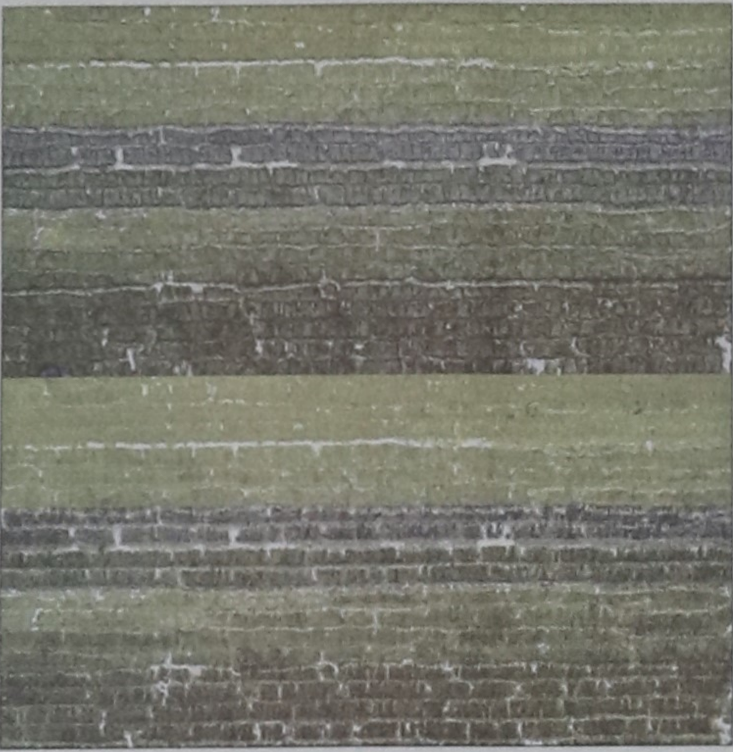
Artwork by Wakilur Rahman

Wakil's works are a tribute to the brave people of Bangladesh who have battled on -- despite obstacles like natural disasters and socio-economic upheavals.