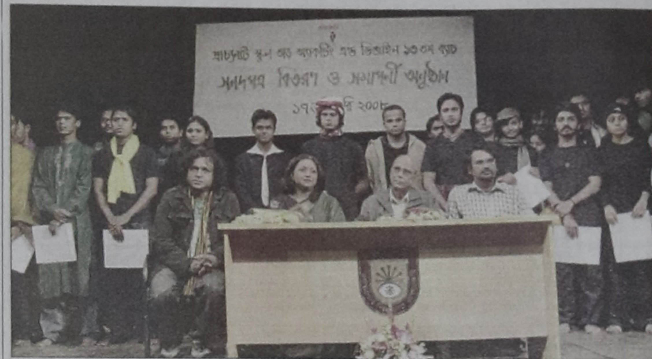
Award recipients (back row) seen with eminent cultural personalities at the programme