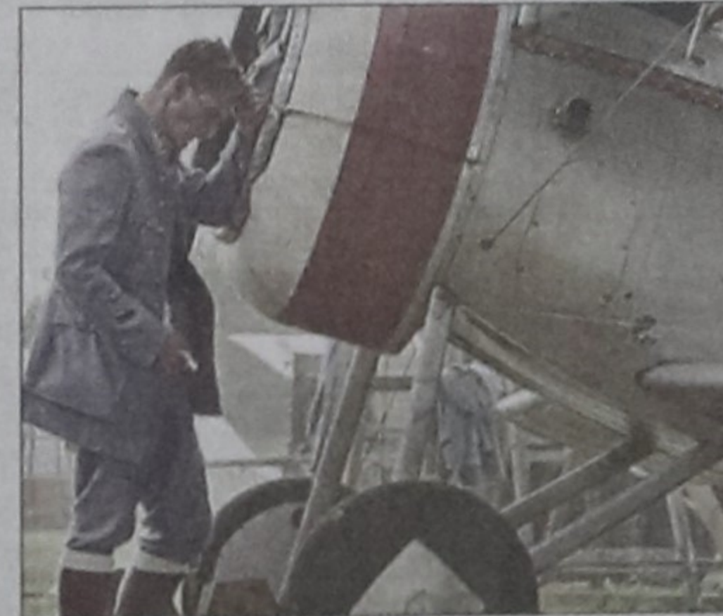
Flyboys On Star Movies at 7:00 pm Genre: Action Cast: James Franco, Jean Reno

All programmes are in local time. The Daily Star will not be responsible for any change in the programme.