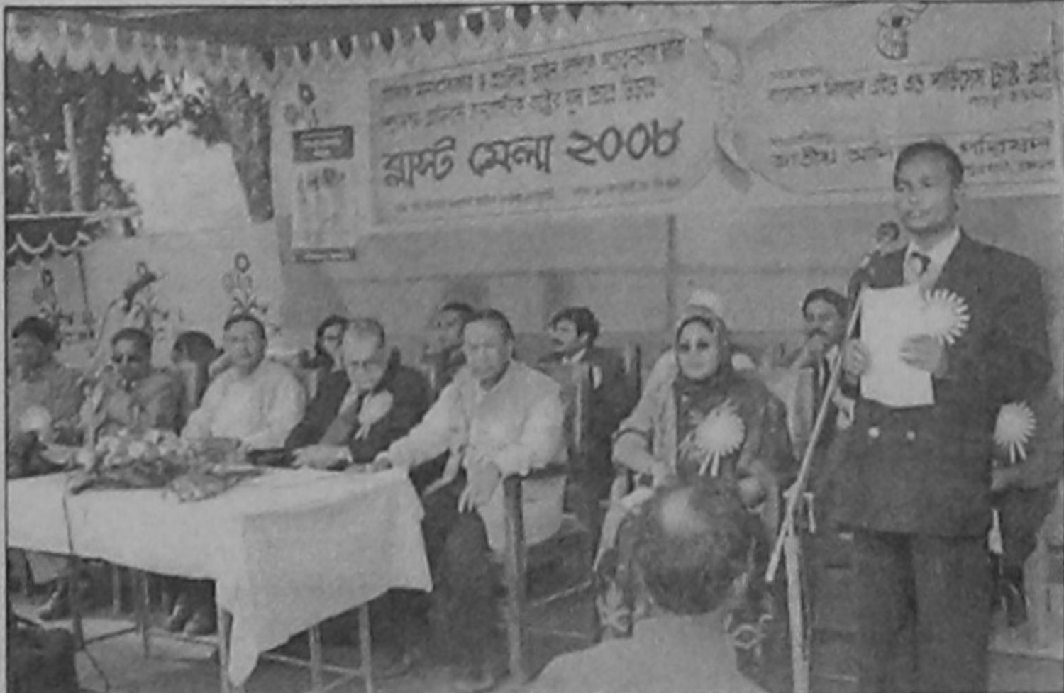
Joypurhat unit of National Indigenous Committee and Bogra unit of Bangladesh Legal Aid and Services Trust jointly organised a law fair for indigenous people in Joypurhat recently.