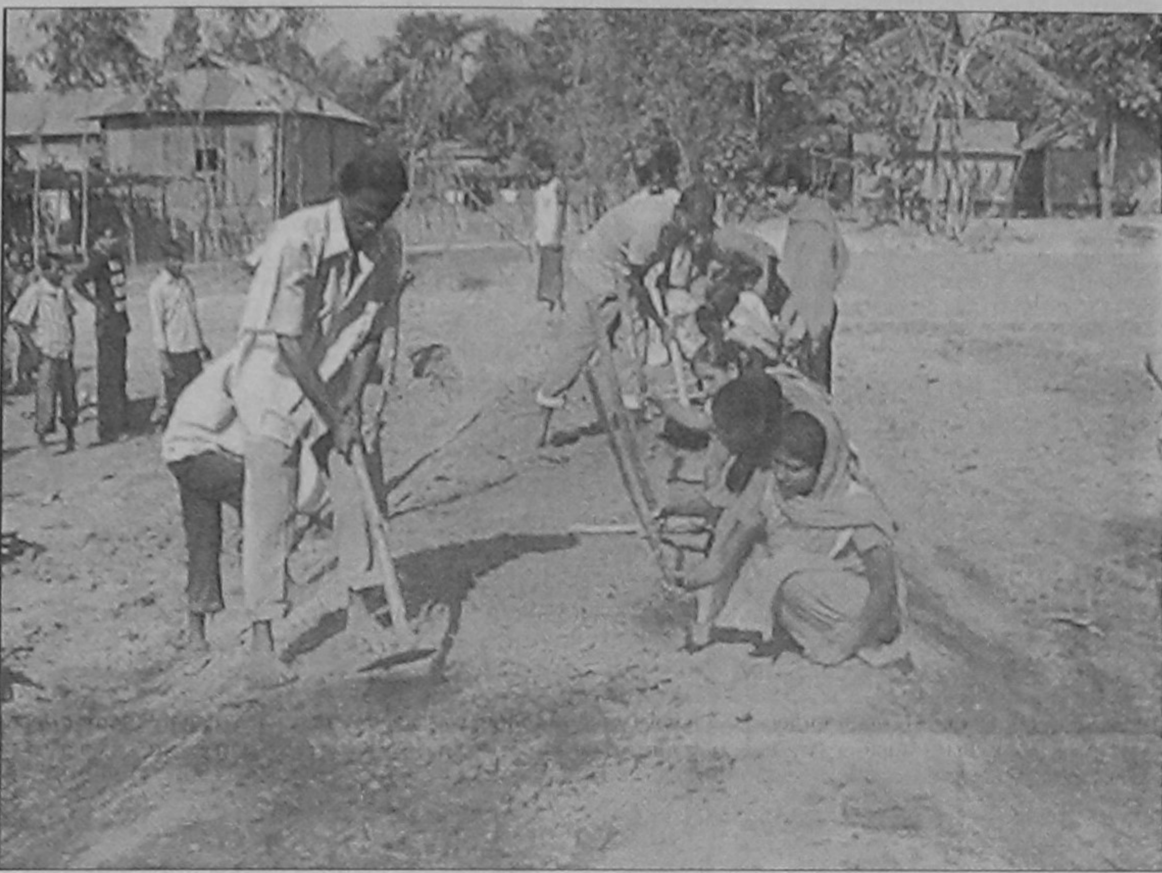
Villagers repairing a road on self-help basis at Dakkhin Falia village in Gaibanda Sadar upazila.

Zillur Rahman Siddiqui said Bangladesh is a very resourceful country but the progress are being held back by corruption, which has spread to all walks of life. Unless corruption can be checked, development efforts will be meaningless, he said. Zillur Rahman however said the present caretaker government has taken some good initiatives.