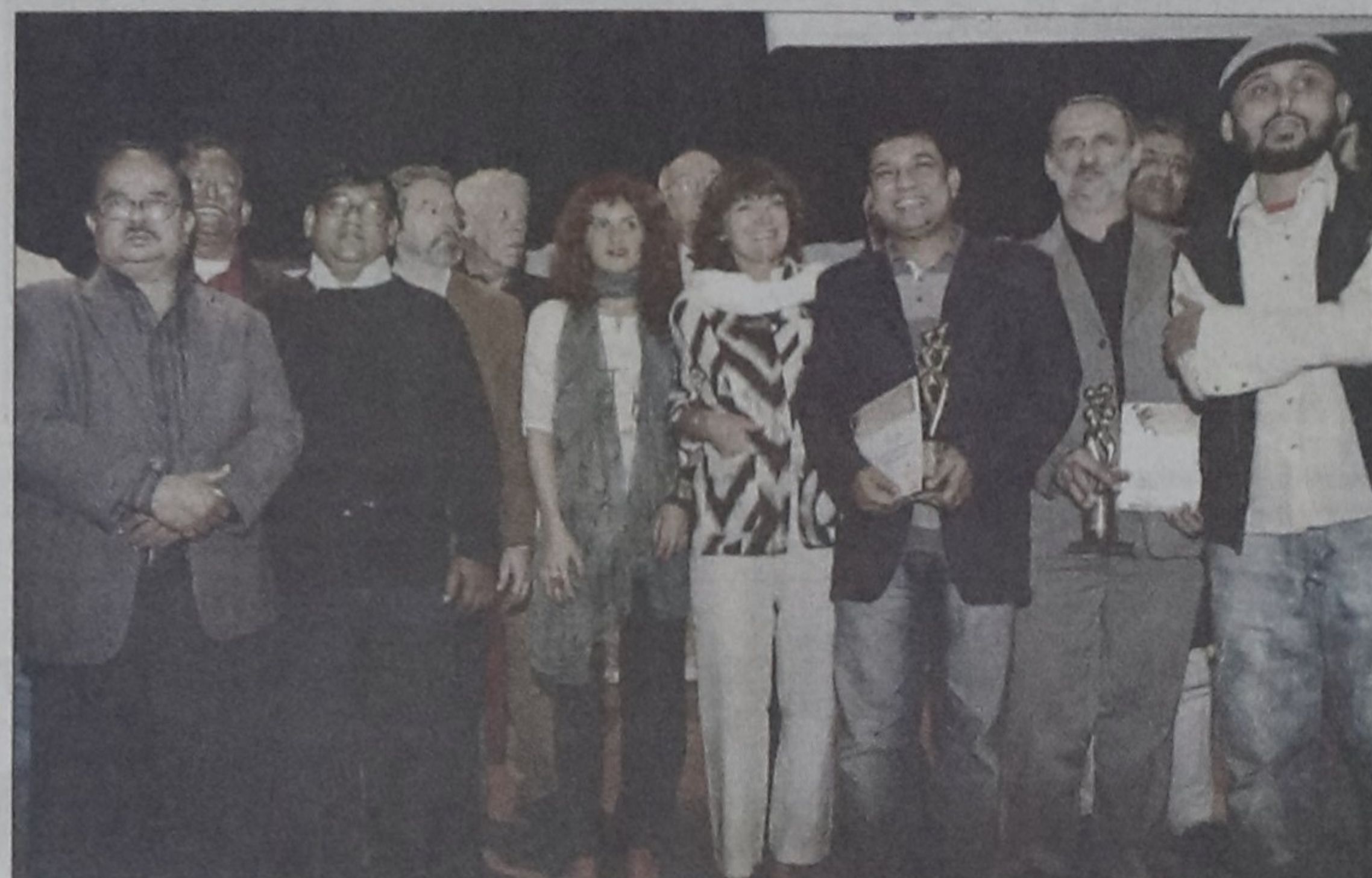
Recipients of the film awards