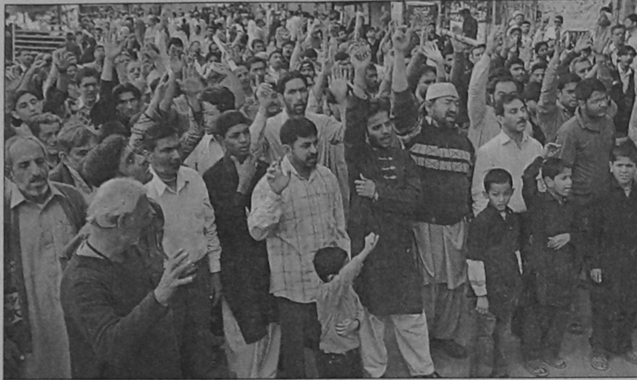
Pakistani Shia Muslims chant anti-government and anti-US slogans during a protest in Karachi yesterday against the suicide attack on a Shia mosque in Peshawar. A teenage suicide bomber killed eight people at a mosque and troops fought Islamist militants in Pakistan on Thursday as US lawmakers warned the country was descending into chaos.

Bhutan will hold its first democratic elections in March, the latest step in the transformation of the Himalayan nation where Buddhist kings reigned supreme. The secluded and mountainous country has long been known as a quirky holdout from modernity, letting in few visitors and banning television and smoking. But much has changed in recent years, television, for example, was introduced in 1999 and the election announced Thursday is the latest step in Bhutan's transformation. For the average Bhutanese, many of whom view the monarchy and its attachment to tradition with affection, the vote has been greeted with a mix of enthusiasm and foreboding. When the country held mock elections last year, hundreds of thousands of voters flocked to the polls, excitedly casting the first ballots of their lives.