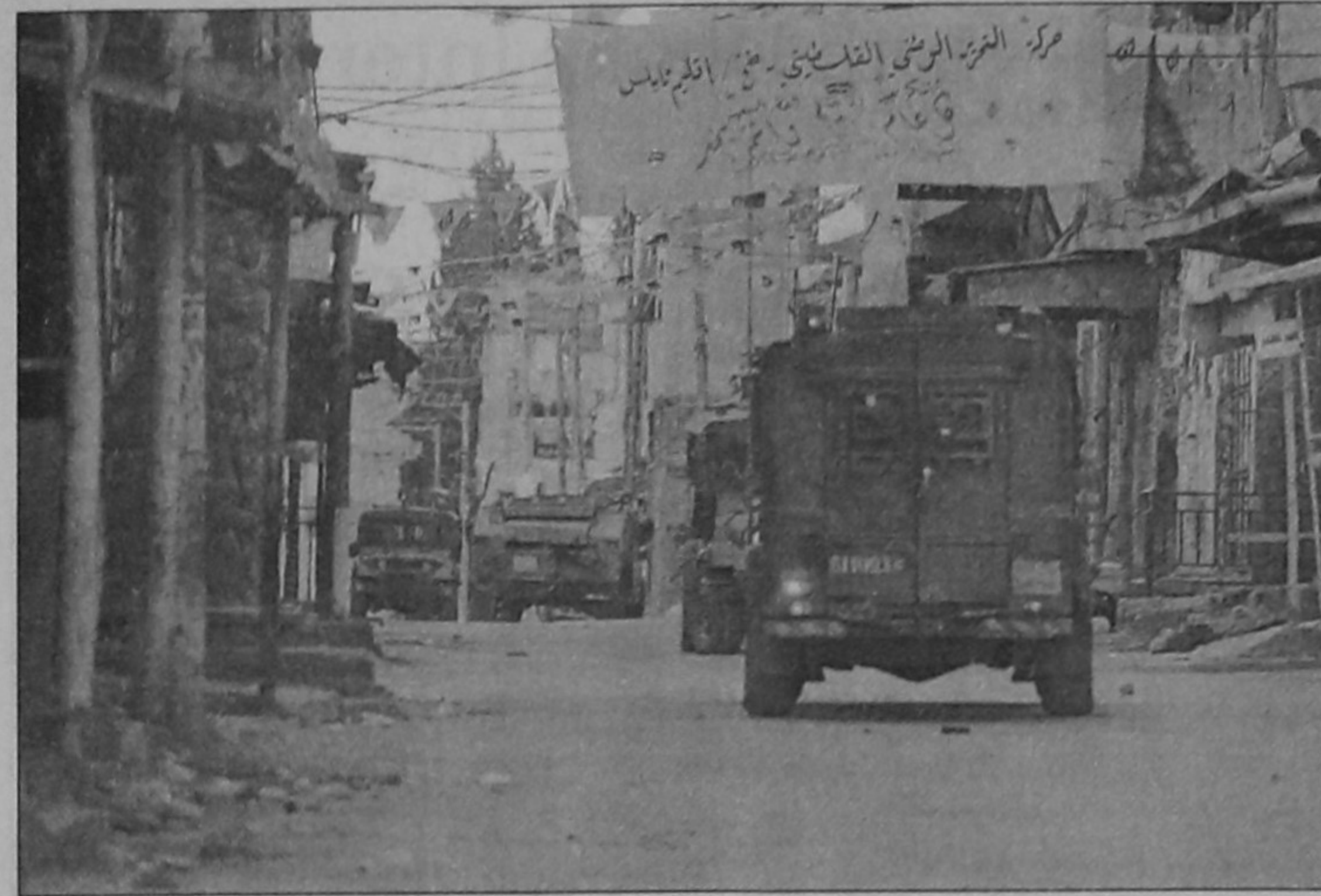
Israeli military vehicles are seen during an incursion at Balata refugee camp in the West Bank city of Nablus yesterday. Israeli troops killed Ahmed Sanakrah, a local commander of the Al-Aqsa Martyrs Brigades militant group early Friday and arrested three members of the same group, loosely linked to president Mahmud Abbas's Fatah party.

"can only lead to the further radicalisation of a depressed and demoralised people." He spoke a day after Israel imposed a shutdown of Gaza amid an escalation of violence around the territory where the Islamist Hamas violently seized power seven months ago. The rocket attacks persisted Friday, with 10 falling in Israel, police said, including one that hit Ashkelon, a town of 120,000 people. No injuries were reported. In retaliation, Israeli aircraft fired on rocket launchers in northern Gaza. Hamas security officials said two Palestinians were killed, a Hamas militant who had just fired rockets and a 17-year-old civilian who was apparently an onlooker. Hamas spokesman Sami Abu Zuhri said Barak's decision was "part of the ongoing Israeli escalation and aggression policy against our people."