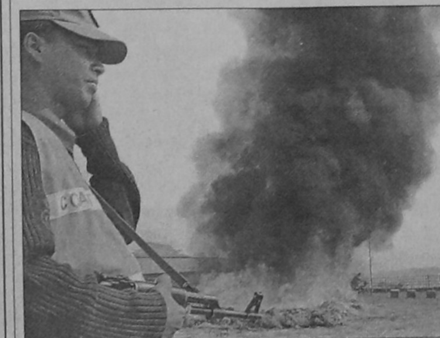
Members of Coast Guard seized about 4.70 lakh metres of current net worth Tk 2.50 crore from different areas in Chandpur and burnt them yesterday.

Asked if the government will investigate Tarique's claim that he was tortured during remand, he said, "We will do so only if the court asks us to look into the matter."