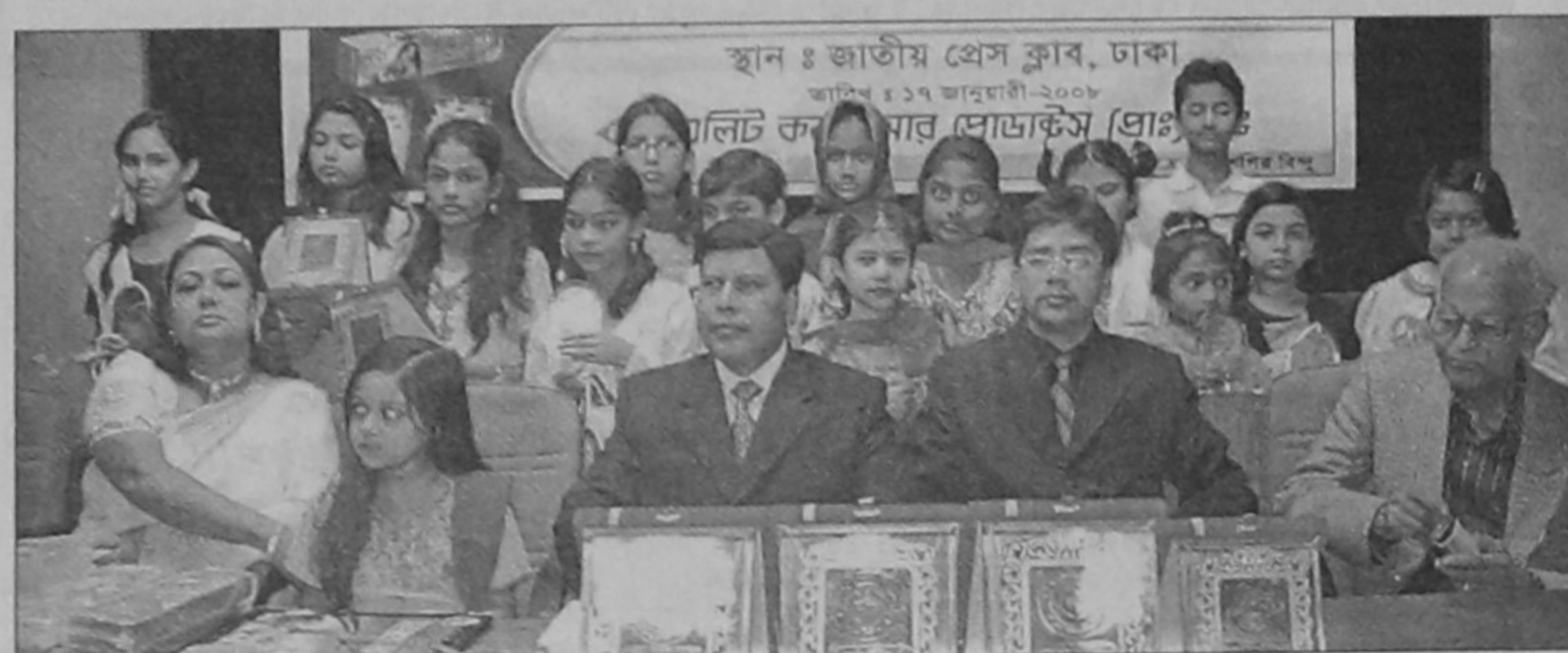
Winners of the Elite Chatni Handwriting Competition pose for photograph with the guests at the prize giving ceremony at the National Press Club in the city yesterday.

On the occasion, doa mahfil will be held after Jumma prayers at every mosque under Bashbaria union in Gopalganj.