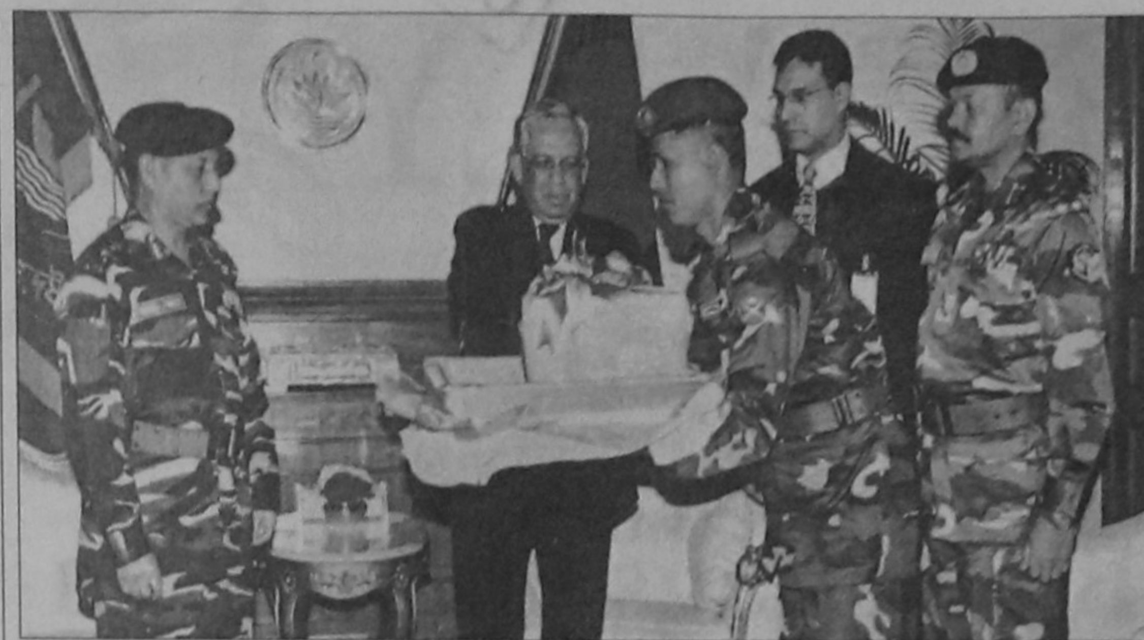
Chief Adviser Fakhruddin Ahmed unveils the cover of a book titled 'Bangladesher Muktiyudhha' published by Bangladesh Army at his office yesterday. Army Chief General Moeen U Ahmed, left, was present on the occasion.