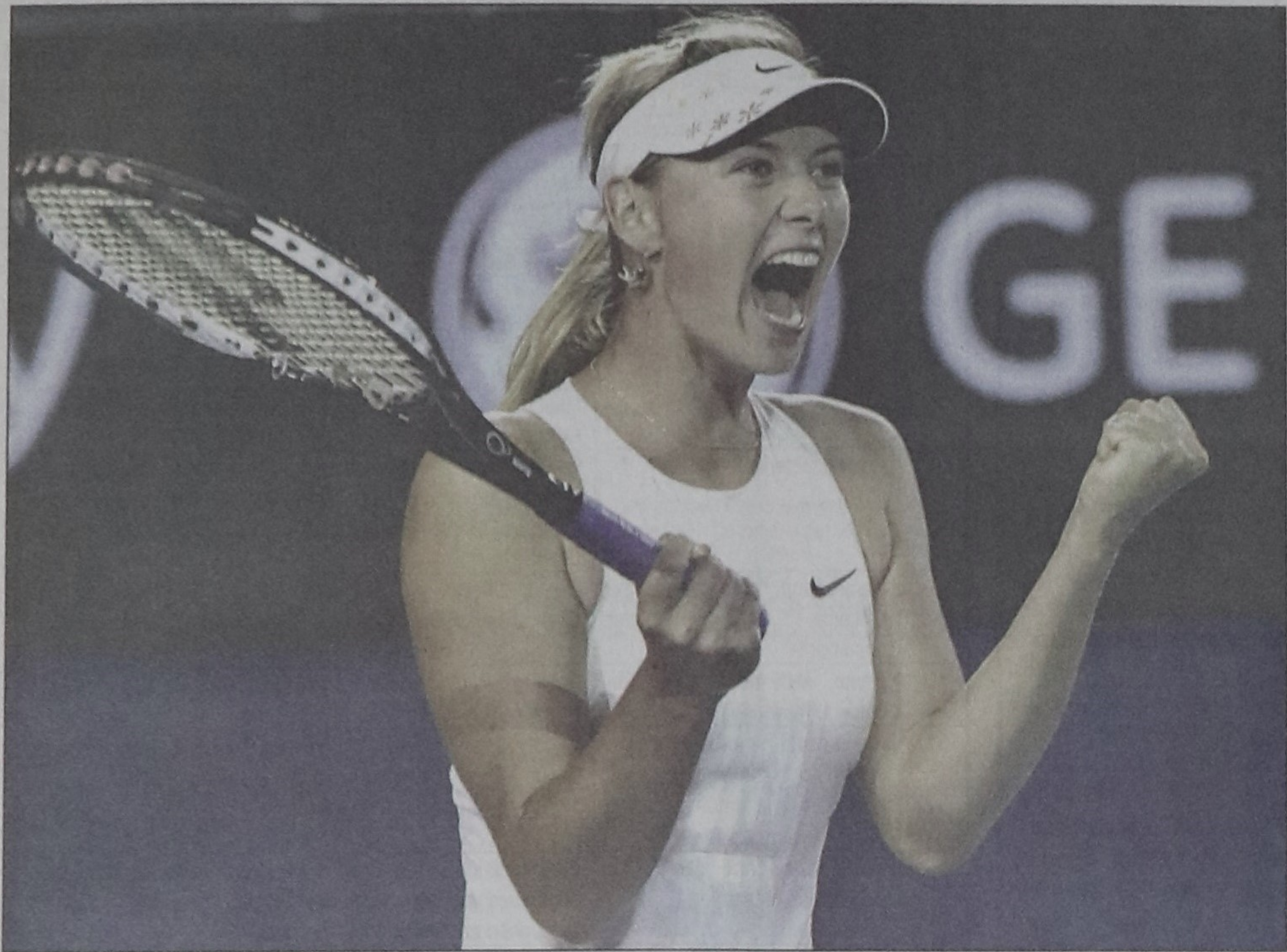
Russian star Maria Sharapova is overjoyed after defeating her US opponent Lindsay Davenport during their second round match at the Australian Open in Melbourne on Wednesday.