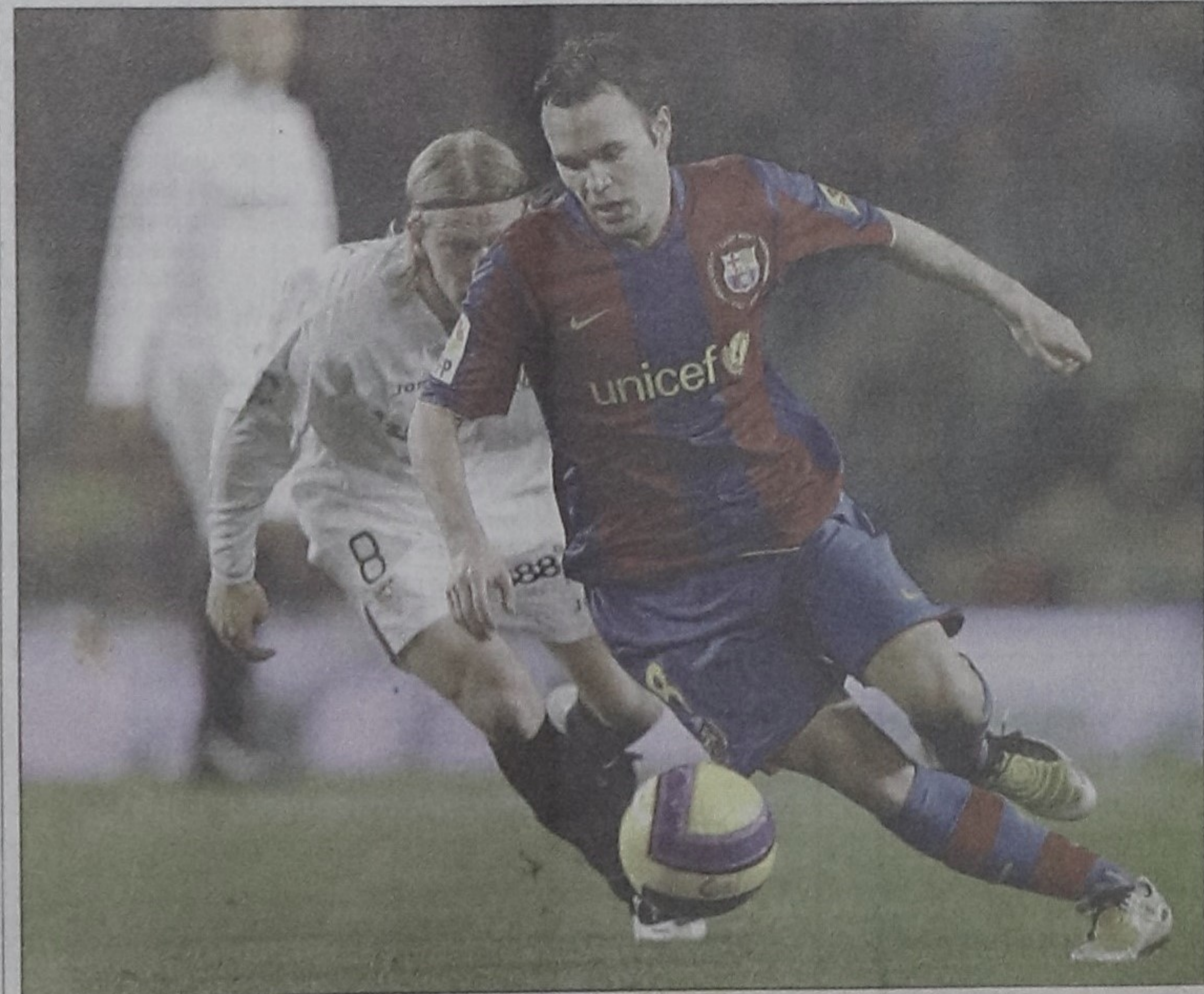
Barcelona midfielder Iniesta (R) goes past Sevilla midfielder Poulsen during their Spanish King's Cup encounter at the Nou Camp on Tuesday.