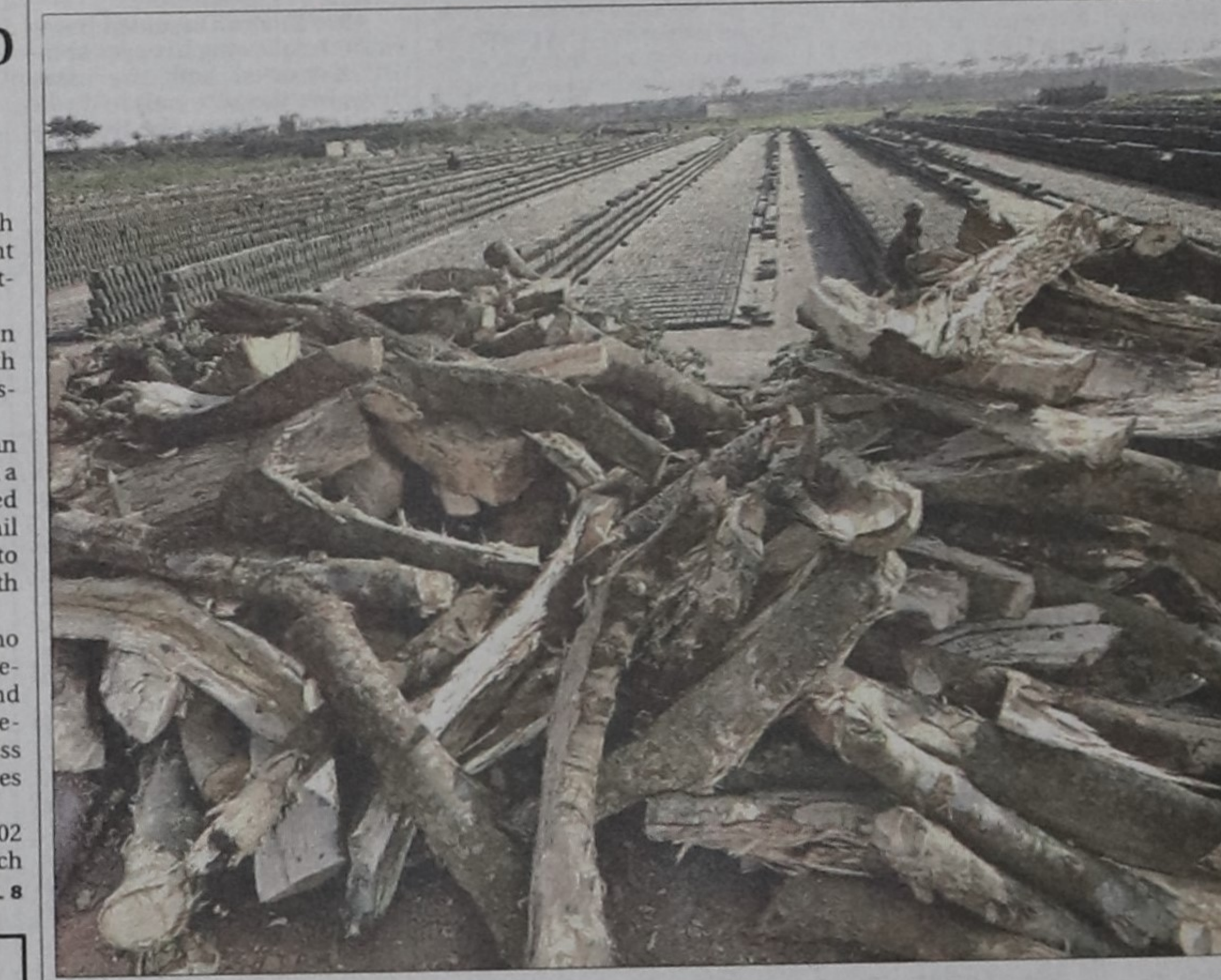
Use of wood in brick kilns is prohibited by law. Yet this picture taken yesterday at Amin Bazaar shows woods being piled up for use in the kilns.