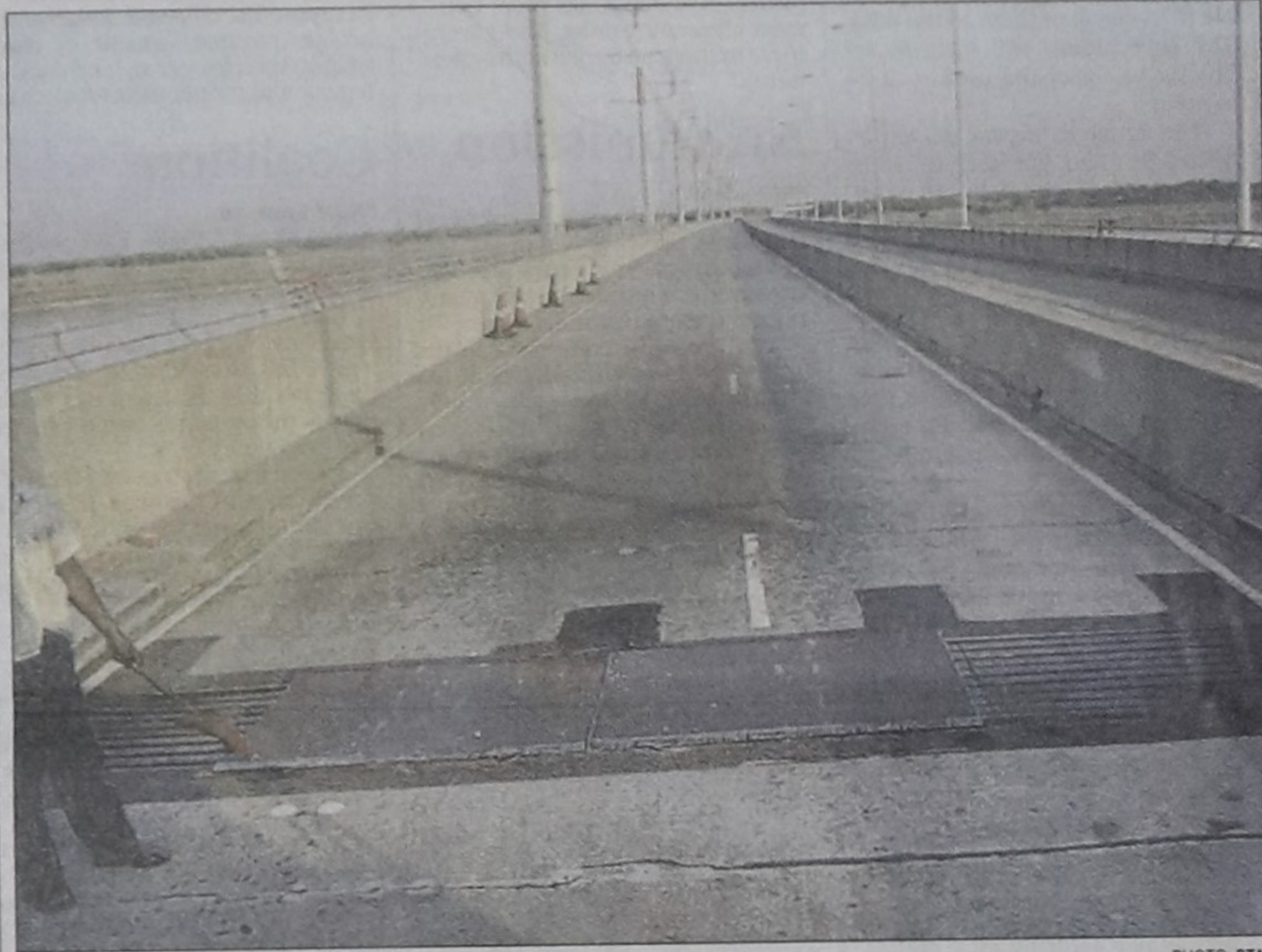
A crack across the width of the north lanes of Jamuna Multipurpose Bridge is visible on the foreground while the expansion joint that had been disjointed on November 18 last year is seen half mended behind the crack, the photo was taken a few days after the expansion joint had come apart.

bridge, were arrested since Saturday from the weigh stations at the bridge in connection with the bribery scandal. Saying that letting overweight vehicles get on the bridge contributed to the development of cracks, an official of Bangladesh Bridge Authority yesterday said they do not have an adequate number of staff to monitor the management firm's activities. Although the bridge authorities had fixed the weight limit at 25 tons for consumer product laden vehicles and 21 tons for other vehicles, over 100 goods laden trucks weigh-