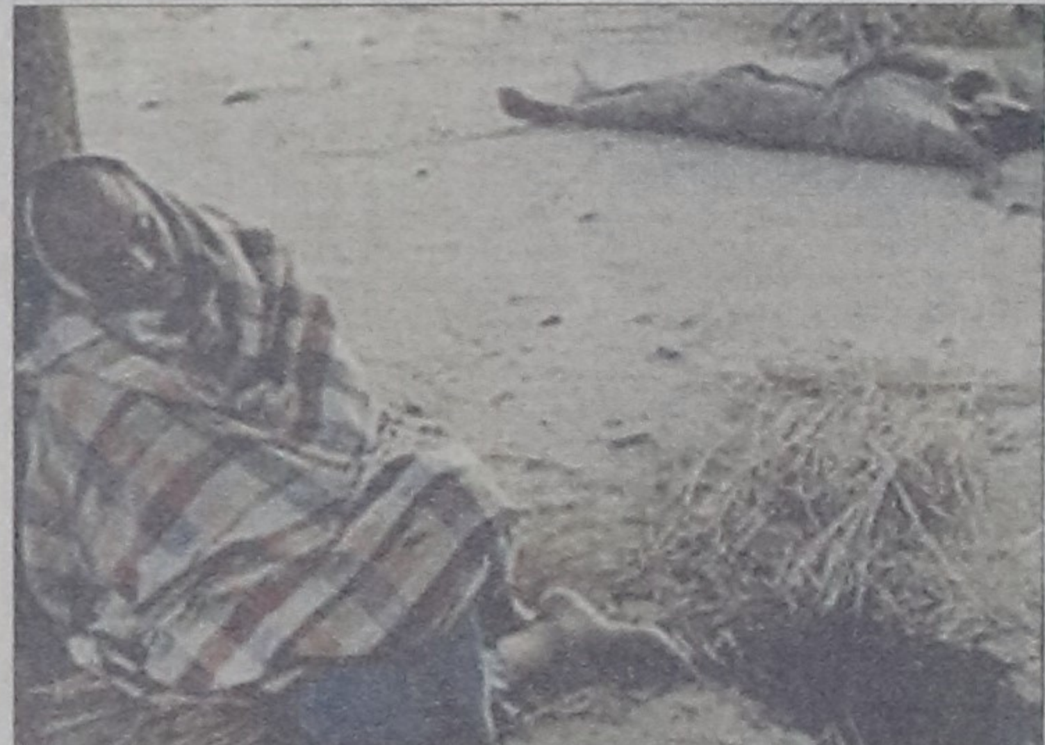
A scene from the film

The film zooms in on a harrowing tale of a corpse that needs to be buried. It is carried to far flung cities and villages in search of a piece of land but no one is willing to go beyond the prejudices. Actor Amirul Haque Choudhury plays the lead role in the film.