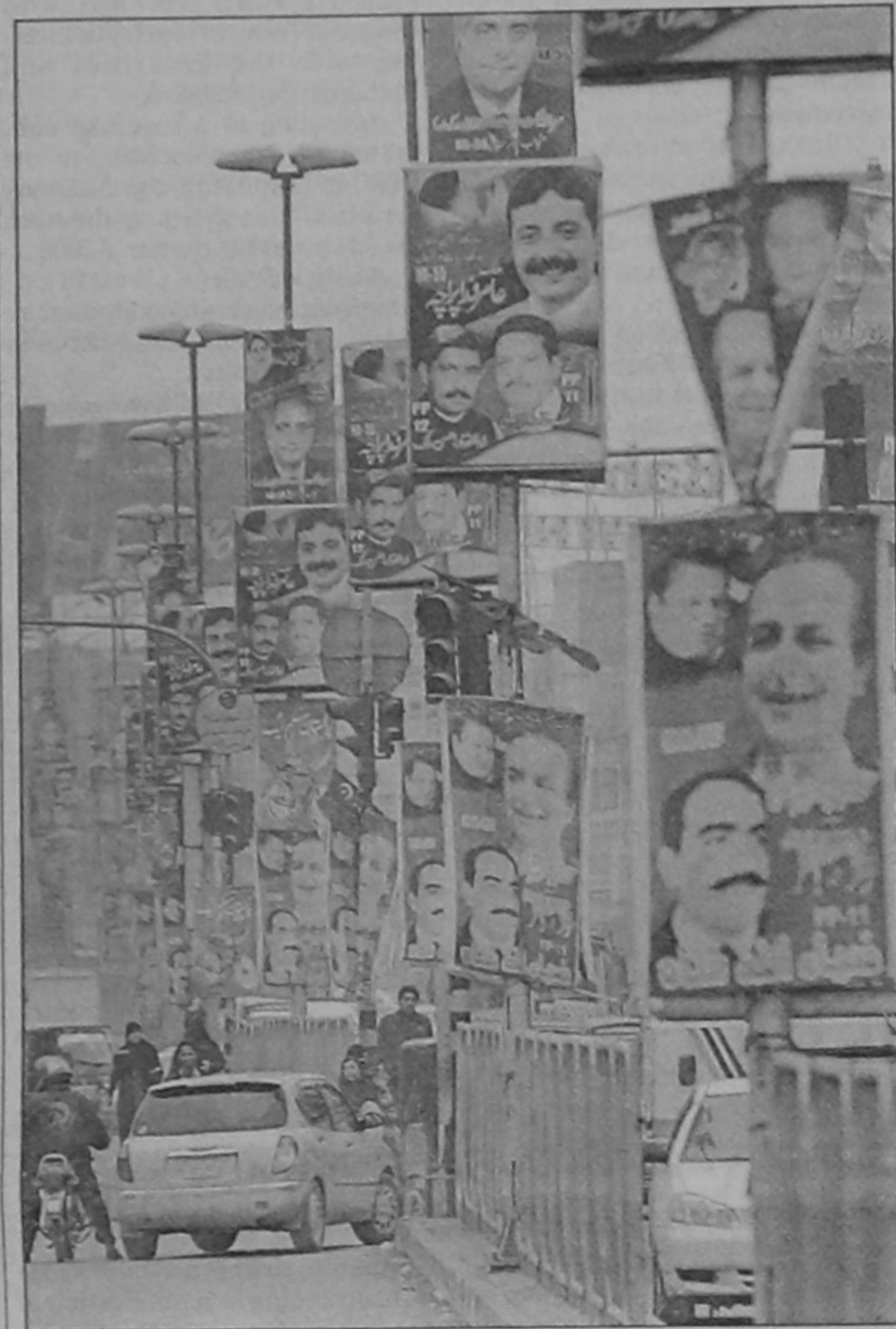
Pakistani commuters pass billboards of general election candidates along a street in Rawalpindi yesterday. Pakistani security forces have arrested eight suspected Islamic militants accused of involvement in a recent wave of suicide and terrorist attacks, the interior ministry said on Tuesday.

Lebanese troops set up checkpoints and diverted traffic Wednesday near the north Beirut seaside highway where the bomb exploded, a road that embassy staff would have had to take to attend a farewell reception for the departing US ambassador scheduled later Tuesday. It was cancelled.