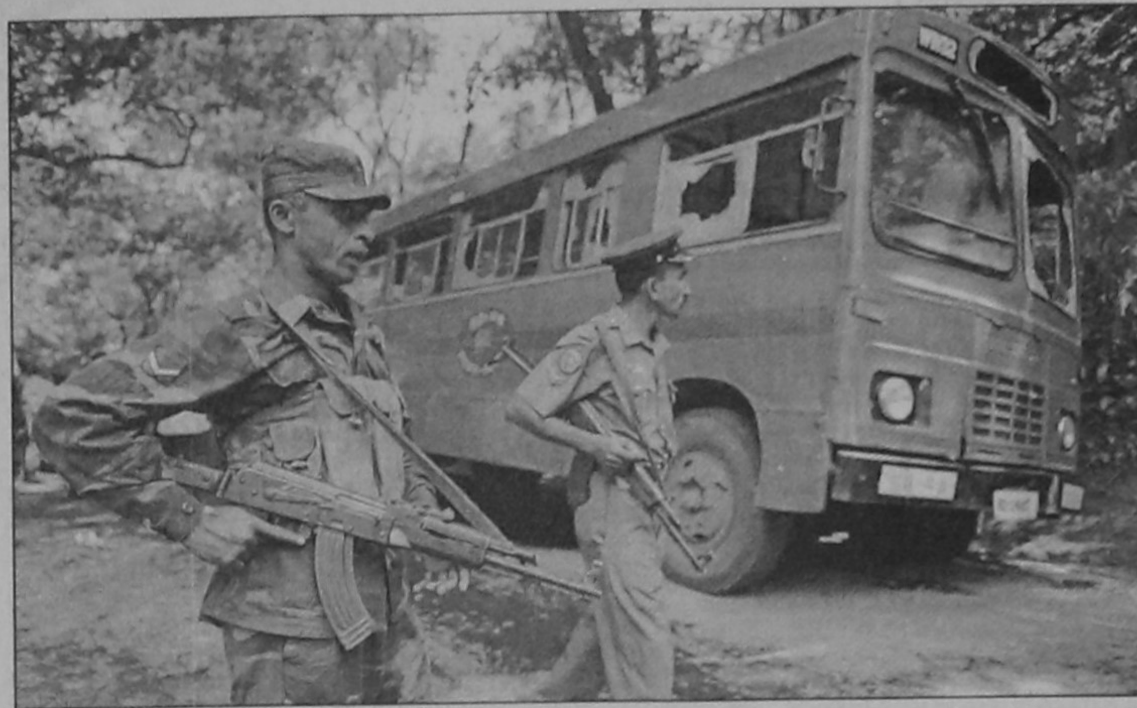
Sri Lankan army soldiers stand alert at the site of a roadside bomb attack on a bus in Butlala, some 235 km from Colombo yesterday. At least 26 civilians were killed and dozens wounded in a suspected Tamil Tiger bomb attack on a crowded bus in southern Sri Lanka, officials said, as the island's ceasefire was set to end.

He said his team was "disappointed" over the island's return to war, and said he hoped there would be a return to talks "sooner rather than later."