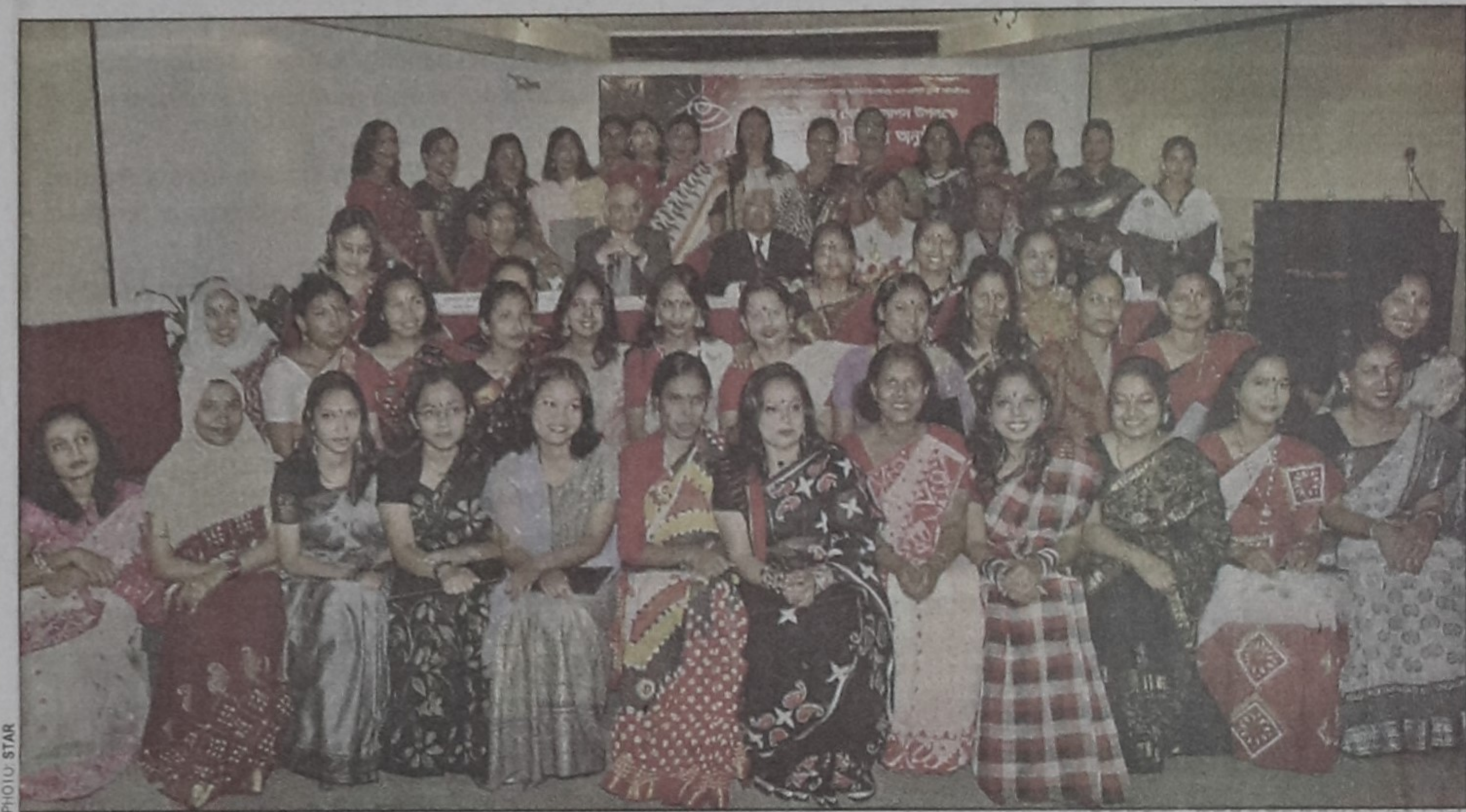
Participants of the second batch of Salma Sobhan Fellowship for Women in Journalism 2006-07 pose with the guests at the certificate giving ceremony at Brac Centre auditorium in the city yesterday.

"We want educated women from the villages to come to the profession of journalism," Brac Founder and Chairperson Fazle Hasan Abed said, urging the Salma Sobhan fellows to follow the footprint of Salma Sobhan who was a courageous human rights activist.