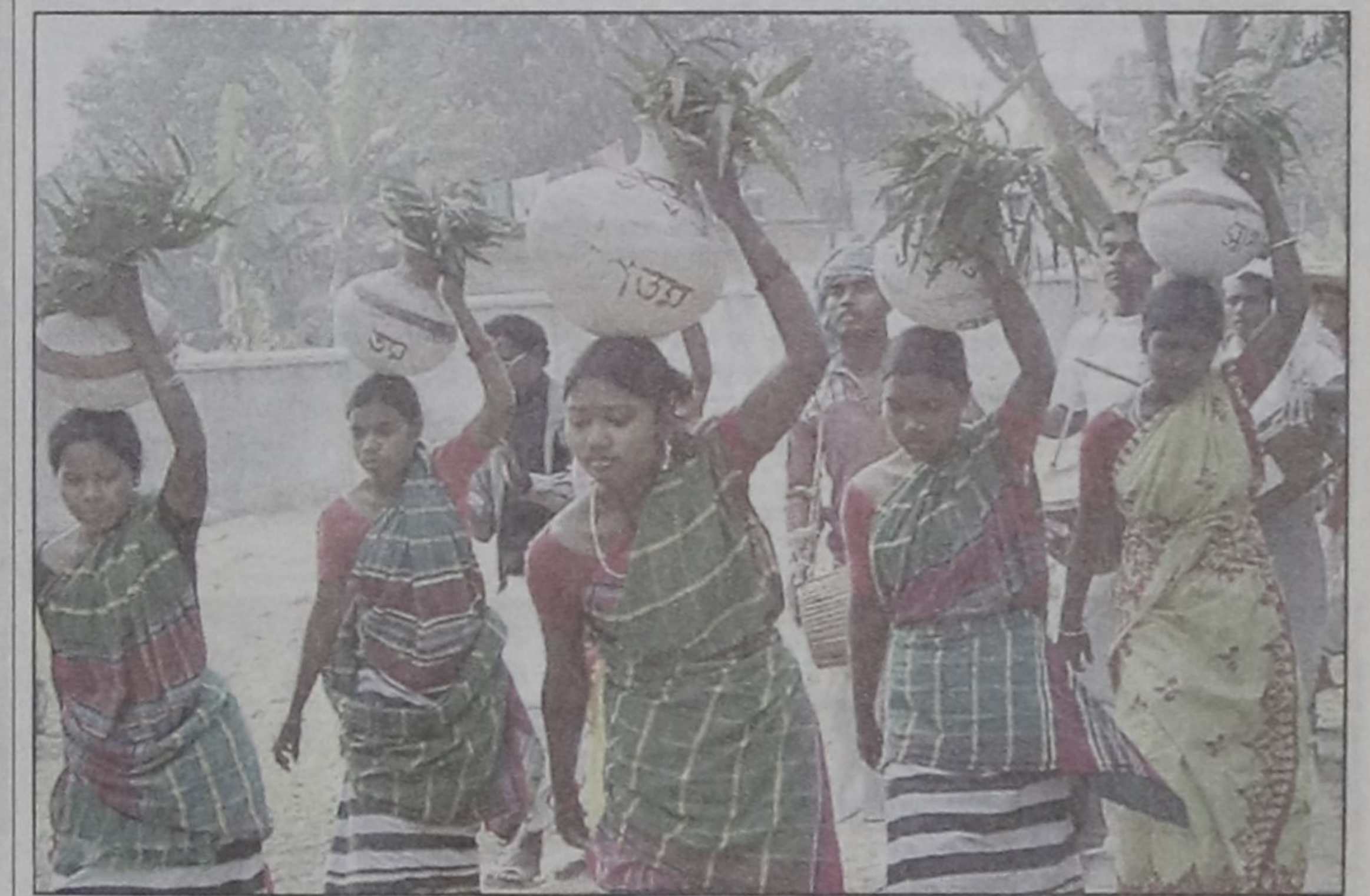
Girls from indigenous community perform a dance number at a function marking the Gono Gobeshak Conference at Tanore in Rajshahi yesterday.

Brotee formed Gono Gobeshak teams with 10 young male and female members from both indigenous and Bangalee families in a village. The teams are guided by an advisory committee consisting elderly villagers.