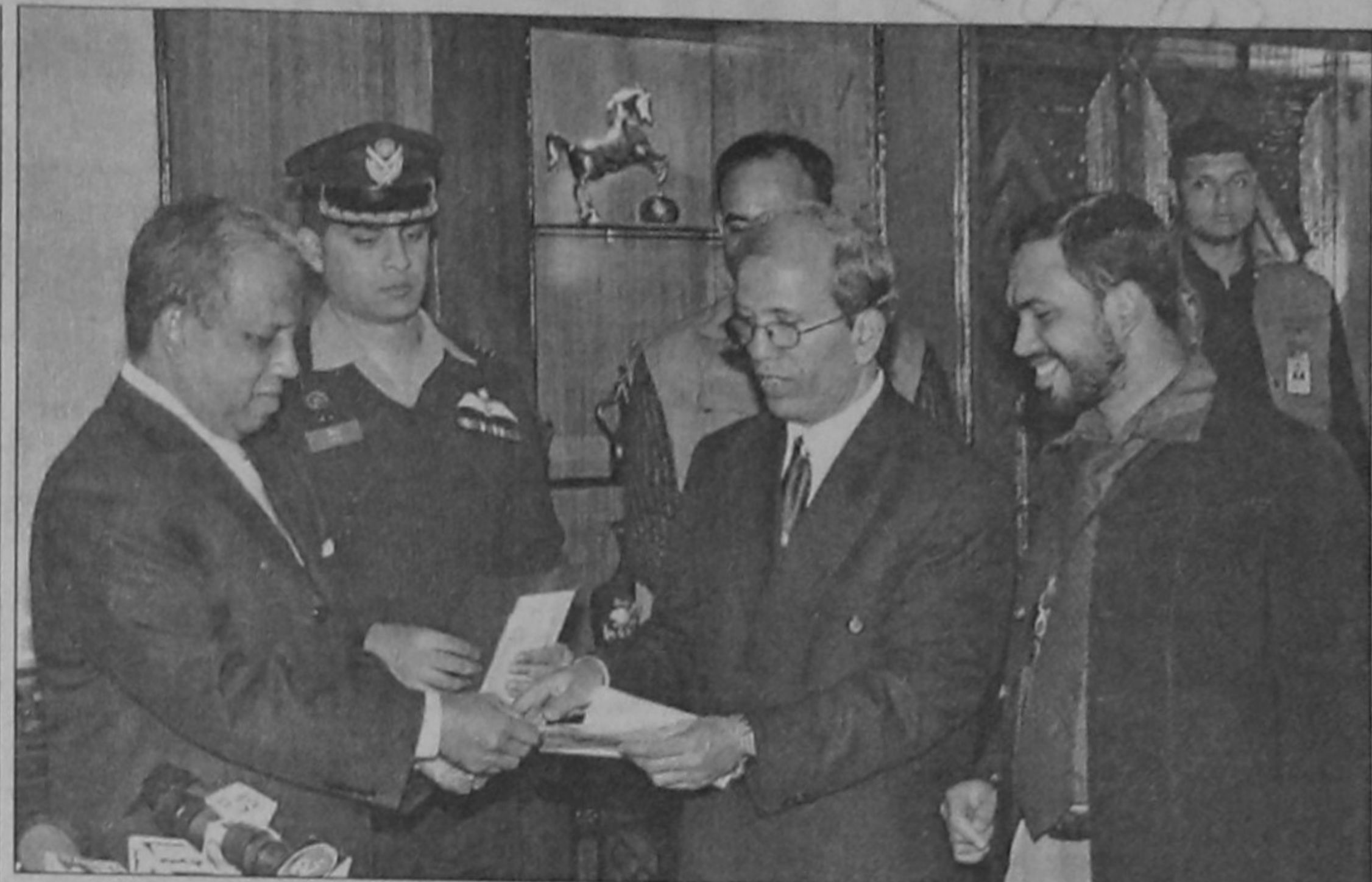
Chief Adviser Fakhruddin Ahmed receives donations from different organisations and individuals for Sidr victims at his office in the city yesterday.

Production resumed in all garment factories excepting one in the city's Mirpur yesterday after two days of labour unrest and clashes between workers and police.