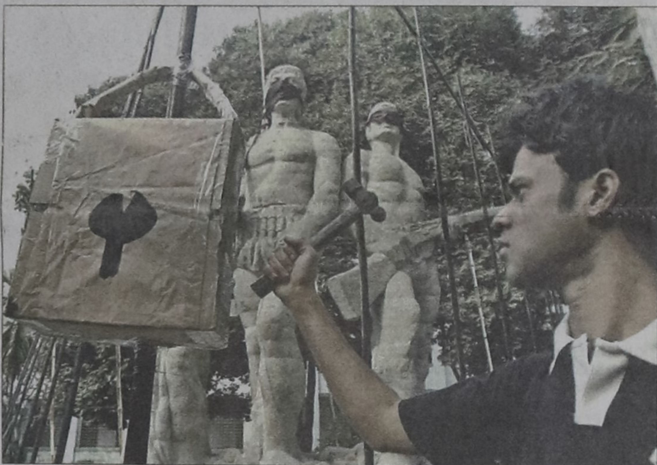
Dhaka University students have built a mock jail at Aparajeyo Bangla as part of their protest demanding immediate release of detained students and teachers who were arrested after the August campus violence last year.

Chaired by the BTRC chairman, SEE PAGE 15 COL 6