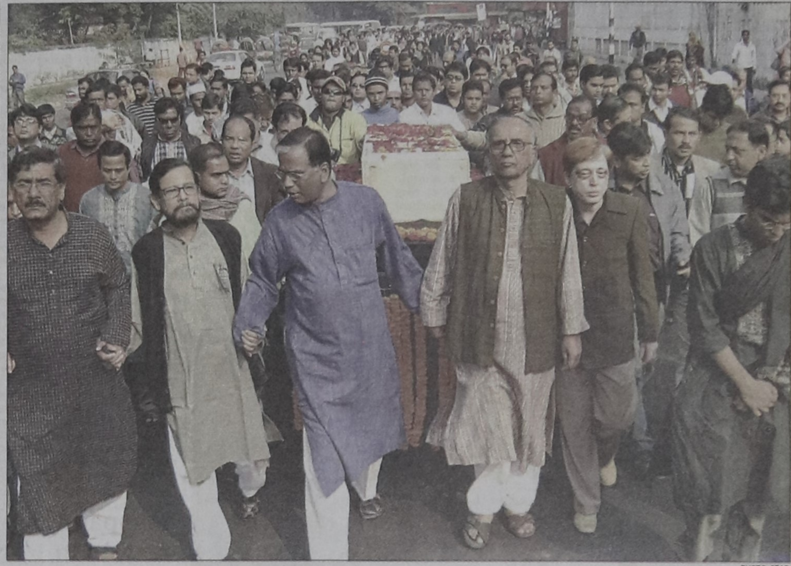
Mourners carry the body of drama doyen Selim Al Deen to the Central Shaheed Minar in the capital yesterday to pay their last respect to the great dramatist who passed away Monday.