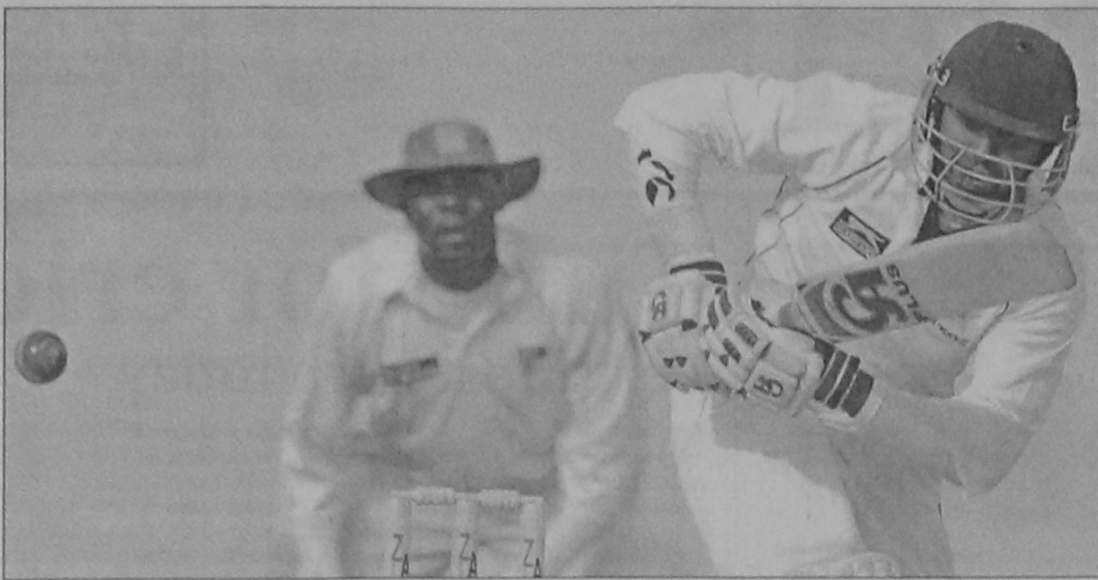
Pakistan's Patron's XI cricketer Nasir Jamshed flicks the ball on way to a brilliant hundred on the second day of the four-day match against Zimbabwe at the Defence Housing Authority ground in Karachi yesterday.

All his friends and well-wishers have been requested to attend the qulkhwan by the bereaved family members.