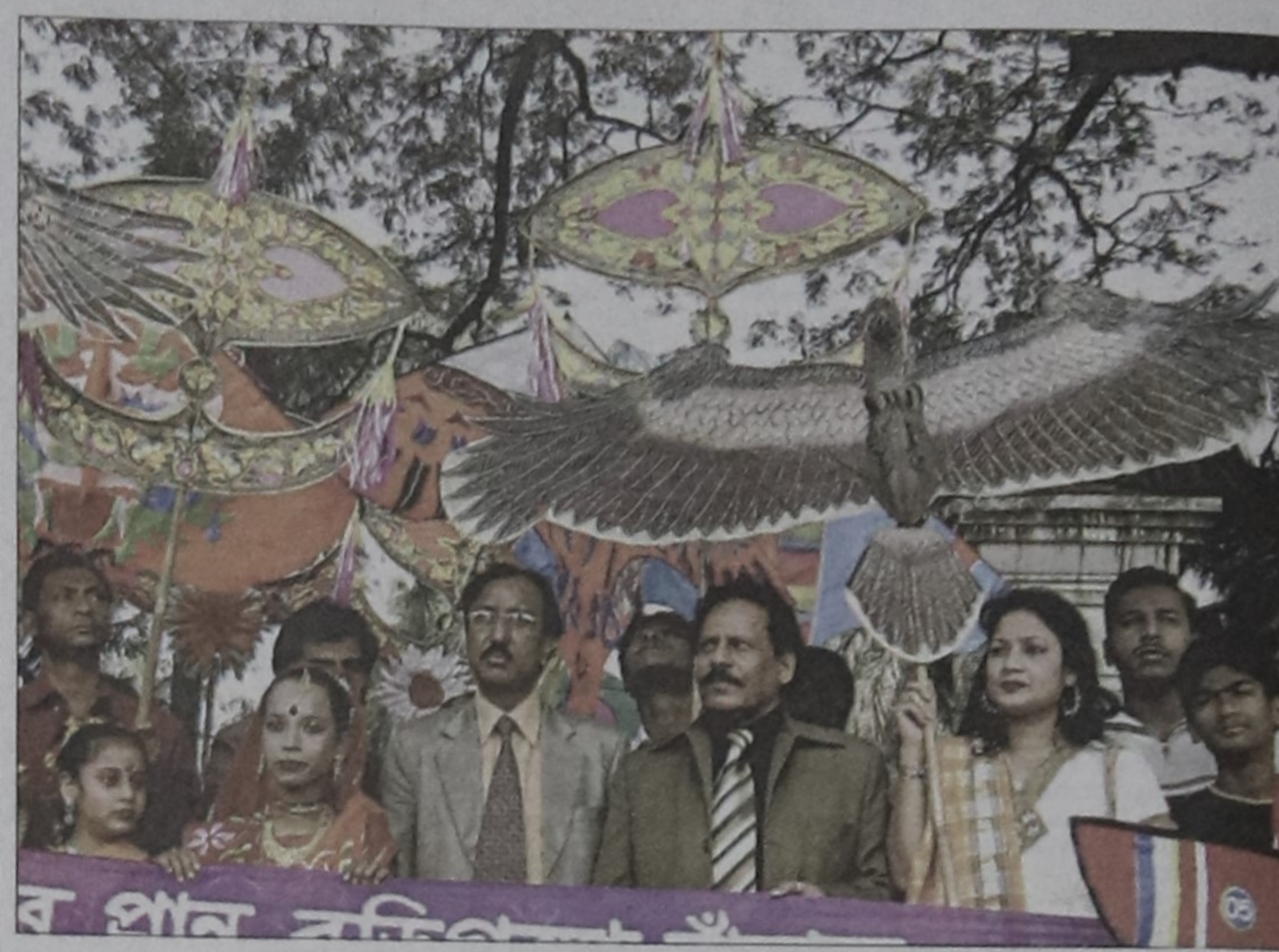
Dhaka Bashi, an organisation of Old Dhaka residents, brings out a colourful procession with kites from Shishu Academy yesterday marking Poush Sankranti, end of the Bangla month of Poush.