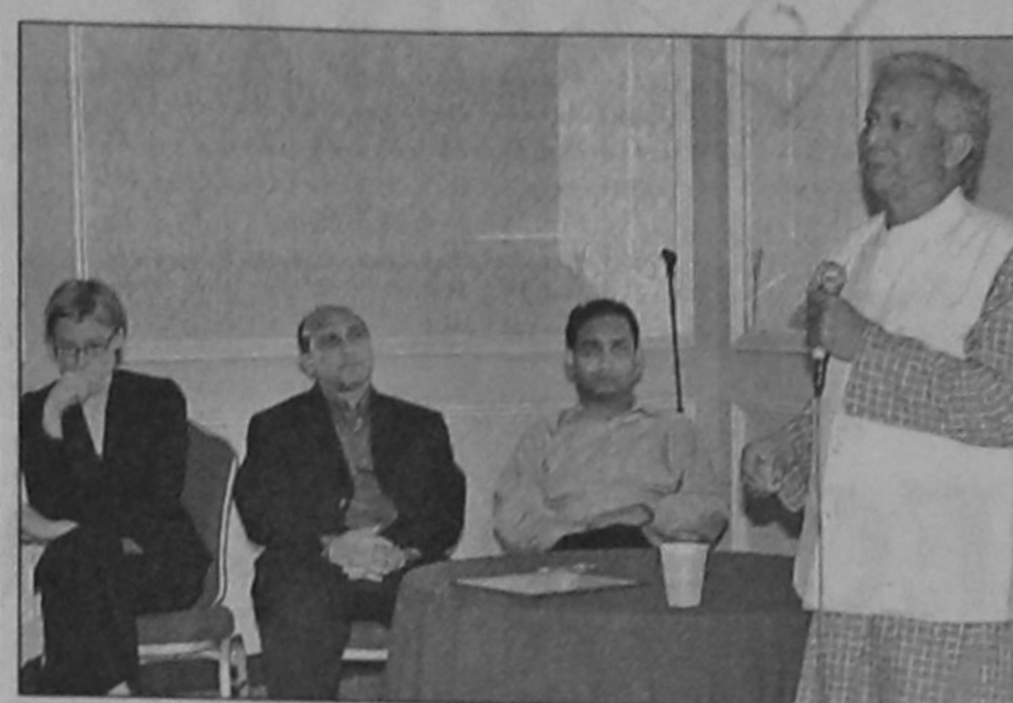
Nobel laureate Prof Muhammad Yunus speaks at a reception accorded to him by Bangladeshi expatriates in Austin, Texas, on Sunday.

Forty-eight participants from 25 national and local organisations took part in the discussion.