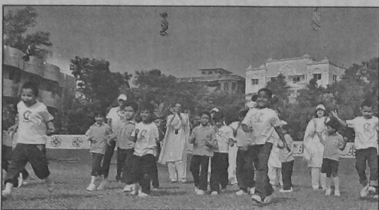
Autistic children take part in an event at an annual sports competition organised by Autism Welfare Foundation (AWF) at Dhanmondi Women's Sports Complex in the city yesterday.

The report also mentioned, there is however a declining trend in establishing new think tanks worldwide, the reasons for which are political and regulatory environment hostile to think tanks and NGOs, a change in funding priorities for think tanks by public and private donors, underdeveloped institutional capacities which decrease the survival rate, and increased competition from advocacy organisations and for-profit consulting firms and electronic media.