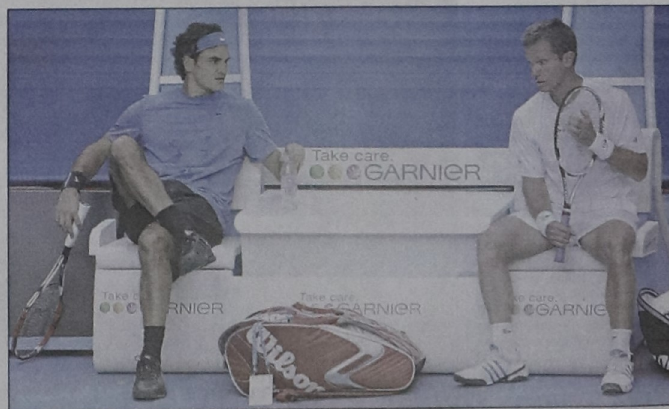
A relaxed looking Roger Federer (L) has a friendly chat with hitting partner Tomas Johansson during practice on Sunday.