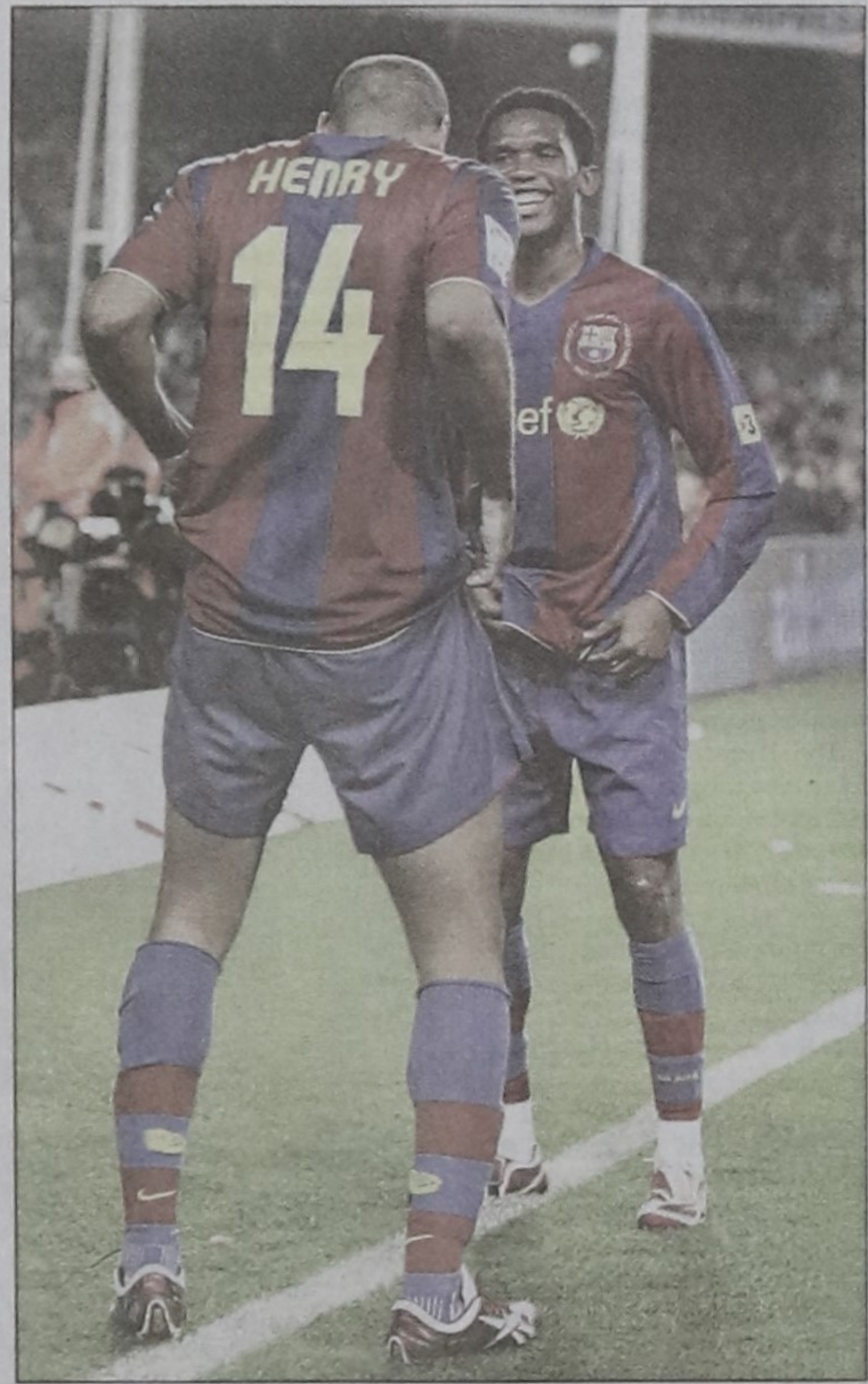
Barcelona strikers Thierry Henry (L) and Samuel Eto'o engage in a spot of dancing while celebrating the latter's strike in their win over Primera Liga opponent Murcia at Nou Camp on Saturday.