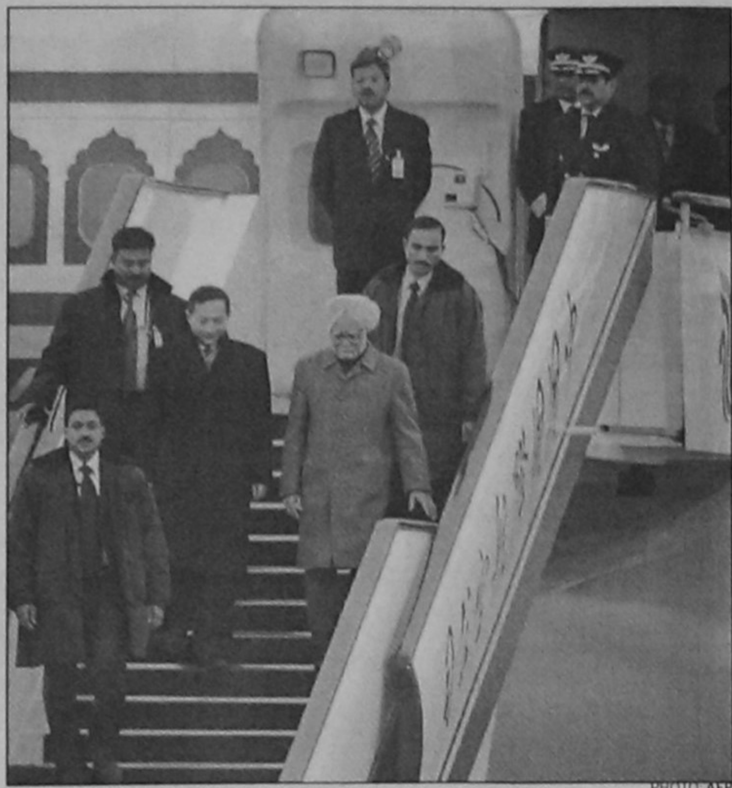
Visiting Indian Prime Minister Manmohan Singh (4th L) reaches for the handrail as he steps off an Air India aircraft on arrival in Beijing yesterday. A protracted dispute over undefined borders and trade gap will be the focus of the three-day state visit by the Indian prime minister in China.

He said he hoped to discuss a wide range of issues with Chinese leaders including UN reforms, regional dialogue and global issues such as climate change, energy security, international trade and counter-terrorism.