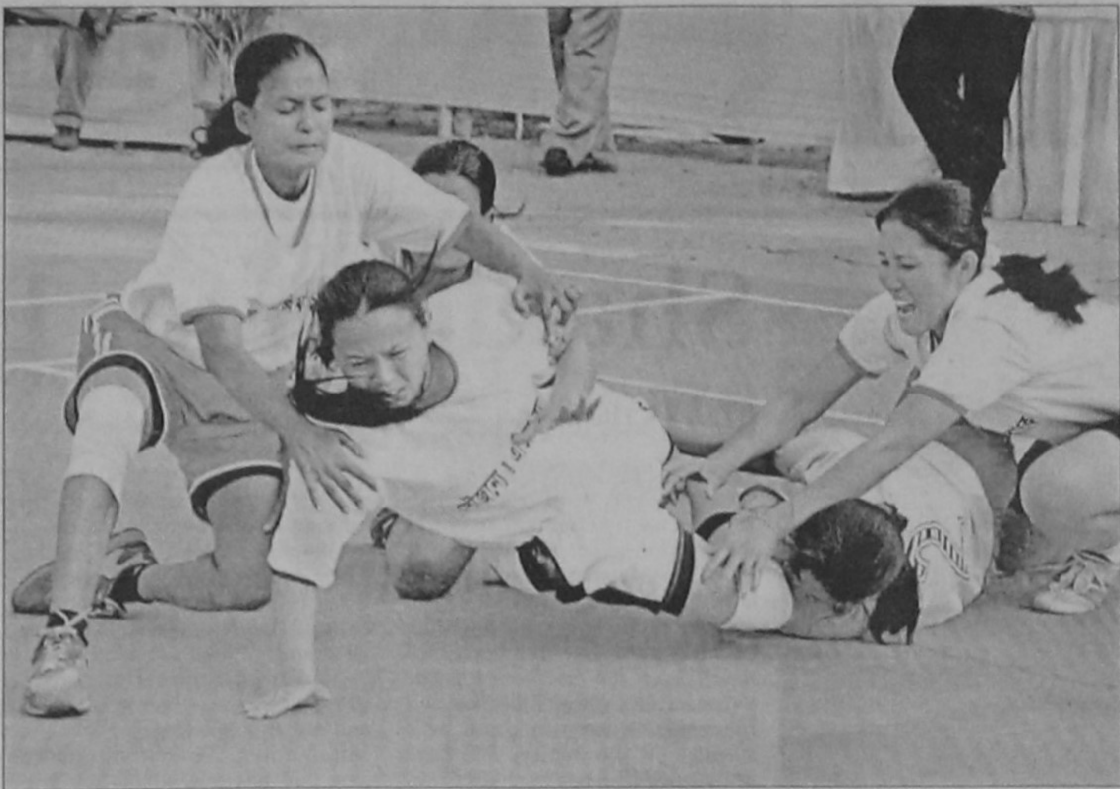
Jatrabari KC kabaddikas successfully hold a raider (M) from neighbouring Matuail Milon Smriti Sangsad in yesterday's EXIM Bank Women's Kabaddi League match at the Outer Stadium kabaddi court.