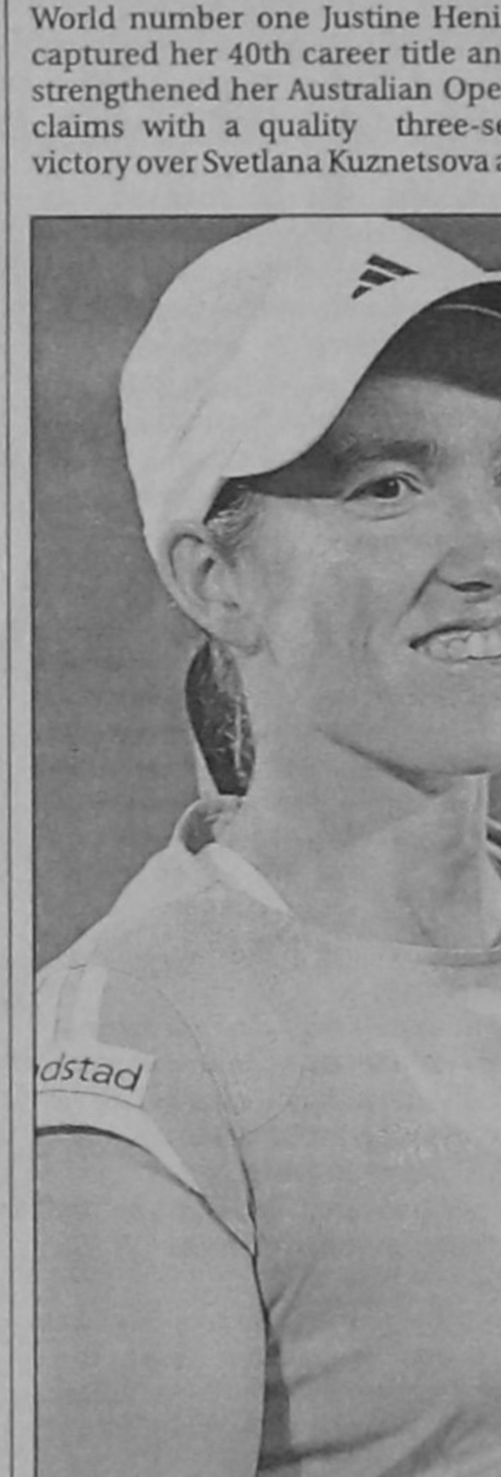
World number one Justine Henin of Belgium holds the trophy after winning the final against Svetlana Kuznetsova of Russia at the Sydney International tournament on Friday.