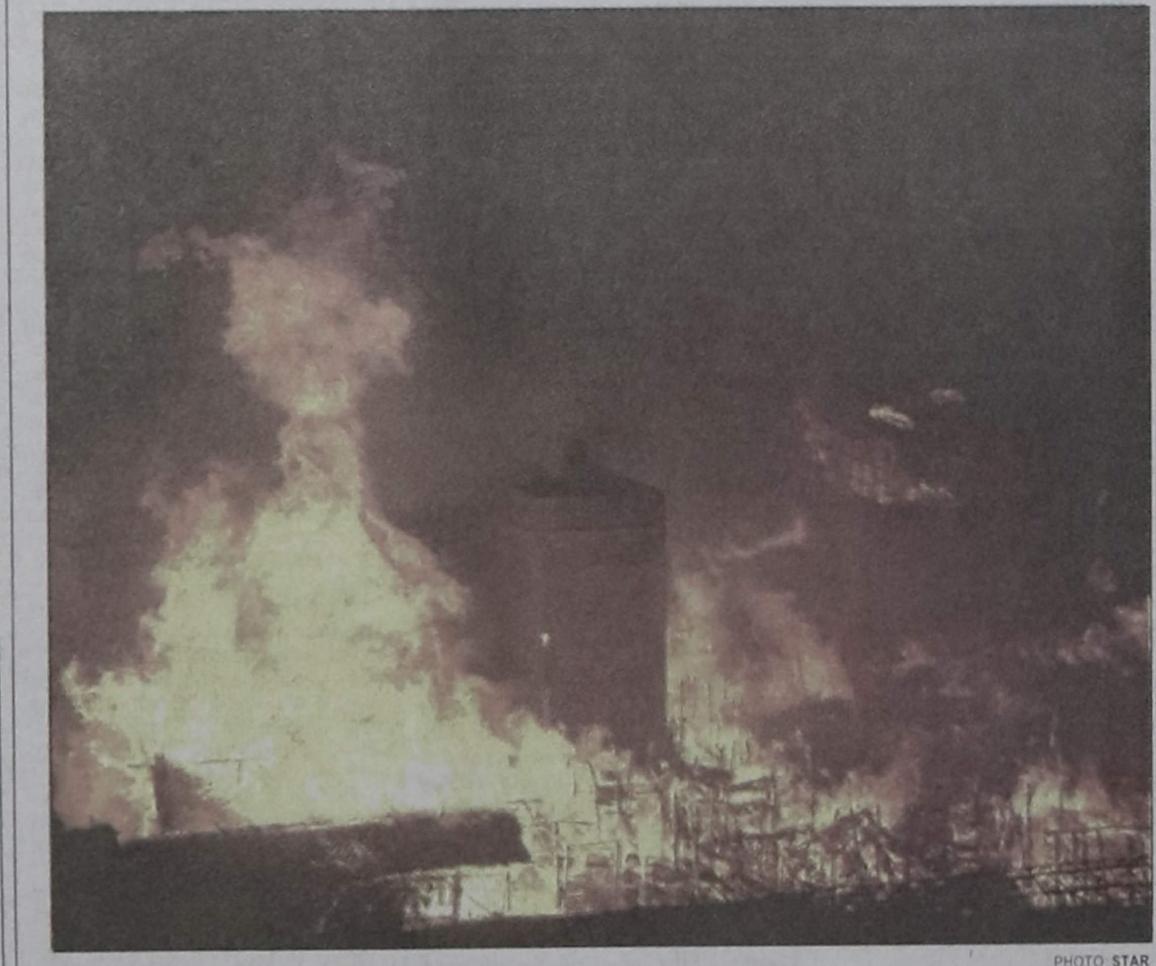
A huge fire engulfing structures at Neemtola slum of Rayerbazar in the city last night. It gutted over 2,000 shanties and other structures in four slums.

SPORTS REPORTER One down Bangladesh go to the second and final Test match against New Zealand today to make sure they return home with some consolation from a tour they have yet to make any impression. The match starts at 4am Bangladesh Standard Time with SAB channel beaming the live coverage from the 12,000-capacity Basin Reserve in Wellington. SEE PAGE 15 COL 5