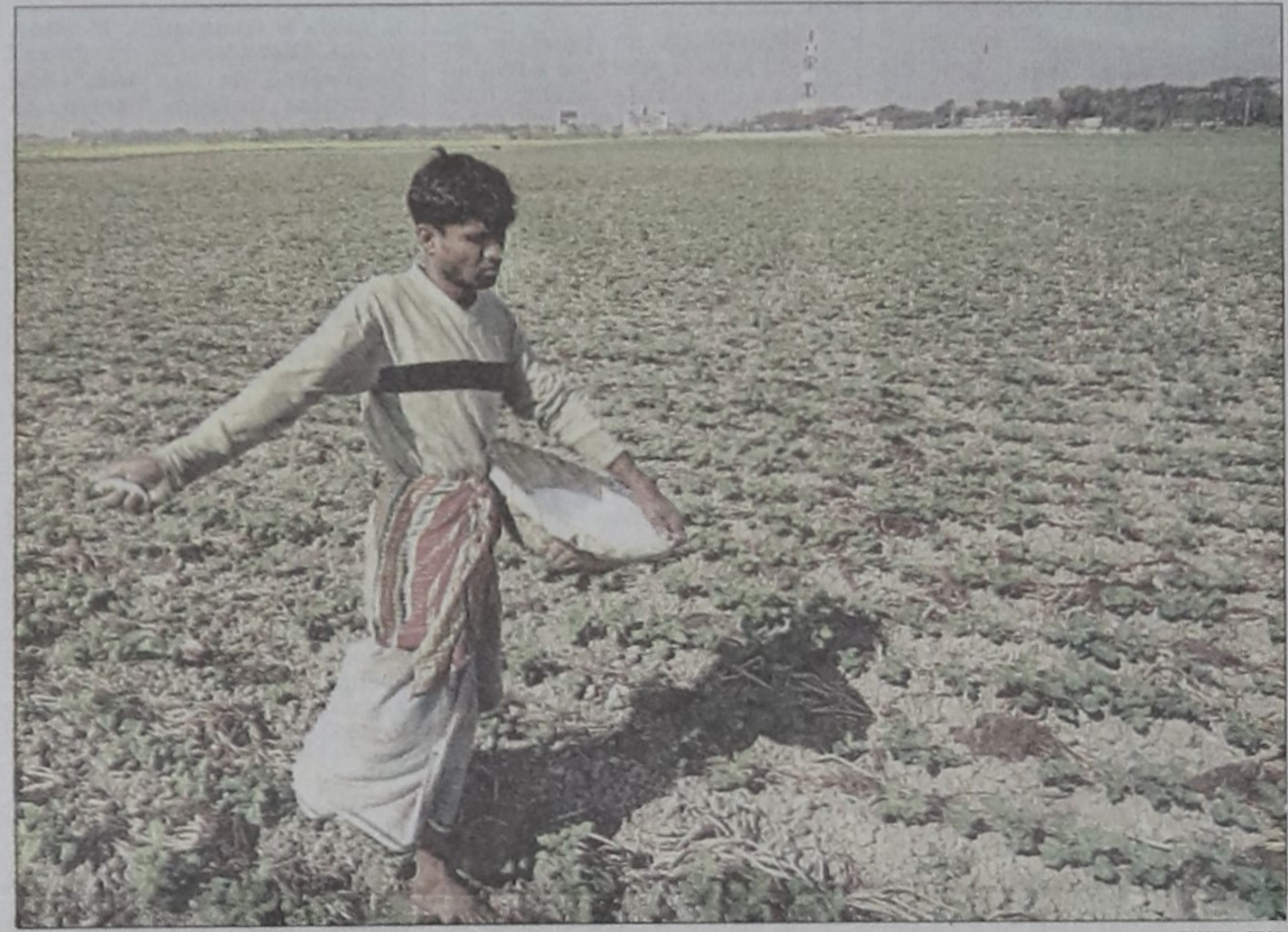
A farmer puts fertiliser on a potato field in Rashunia village of Munshiganj. The growers in the district are experiencing various problems including low-quality seeds and high production cost.

MD HASAN Potato growers in Munshiganj have been facing a crisis of quality seeds due to its improper preservation. Farmers allege that cold stores in the district do not maintain the minimum temperature required to preserve seed potatoes, dimming the prospect of a good yield. Cold store owners, on the other hand, claim they do not practise anything that can lower the quality of seeds. They, however, acknowledge that because of frequent power cuts it is often hard to keep temperature at the optimum level. Munshiganj accounts for almost 40 percent of the country's total potato production. The demand for potato seeds in the district is around 64 thousand tonnes a year. And of that, 90 percent come from the local cold stores. According to the Department of Agricultural SEE PAGE 5 COL 4