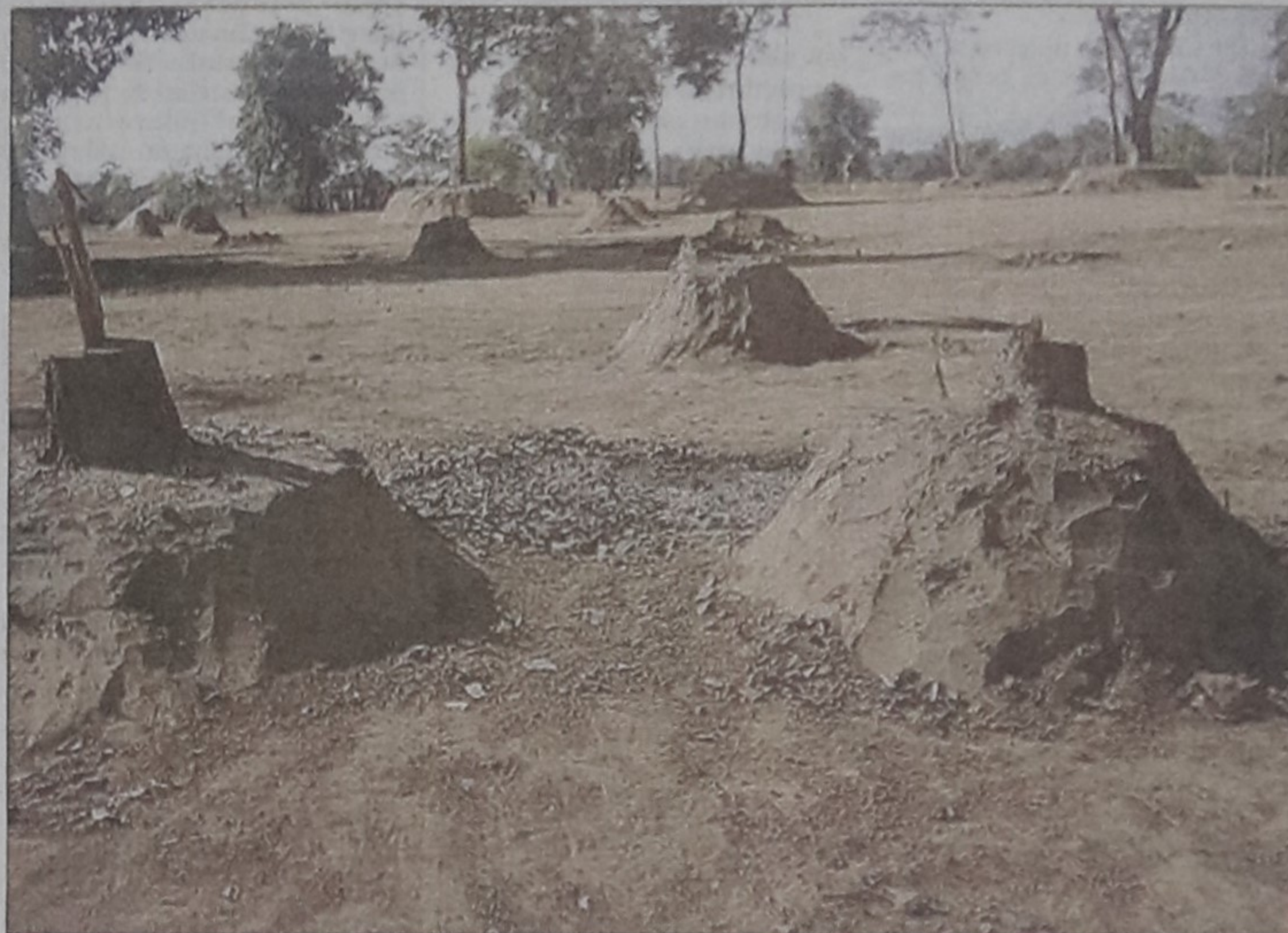
This land at Karallachhari of Khagrachhari once had two hills and thousands of trees on it. Local leaders of a political party razed the hills and fell the trees for housing plots for themselves.