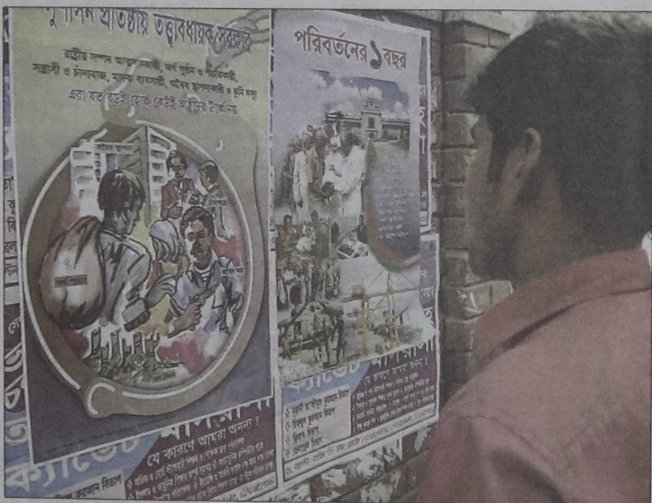
A pedestrian yesterday looks at two posters published on completion of the caretaker government's one year in office. The photo was taken from Segunbagicha in the city.