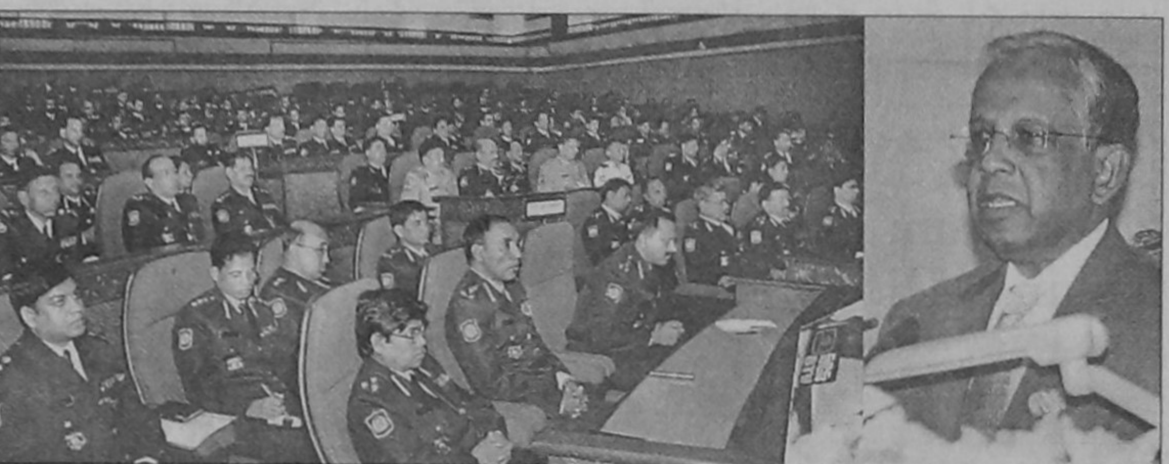
Chief Adviser Fakhruddin Ahmed addresses the police officials at his office in the city yesterday on the occasion of Police Week-2008.

IGP Noor stressed the urgency of approval of the draft of the Bangladesh Police Ordinance 2007 for modernising the police force.