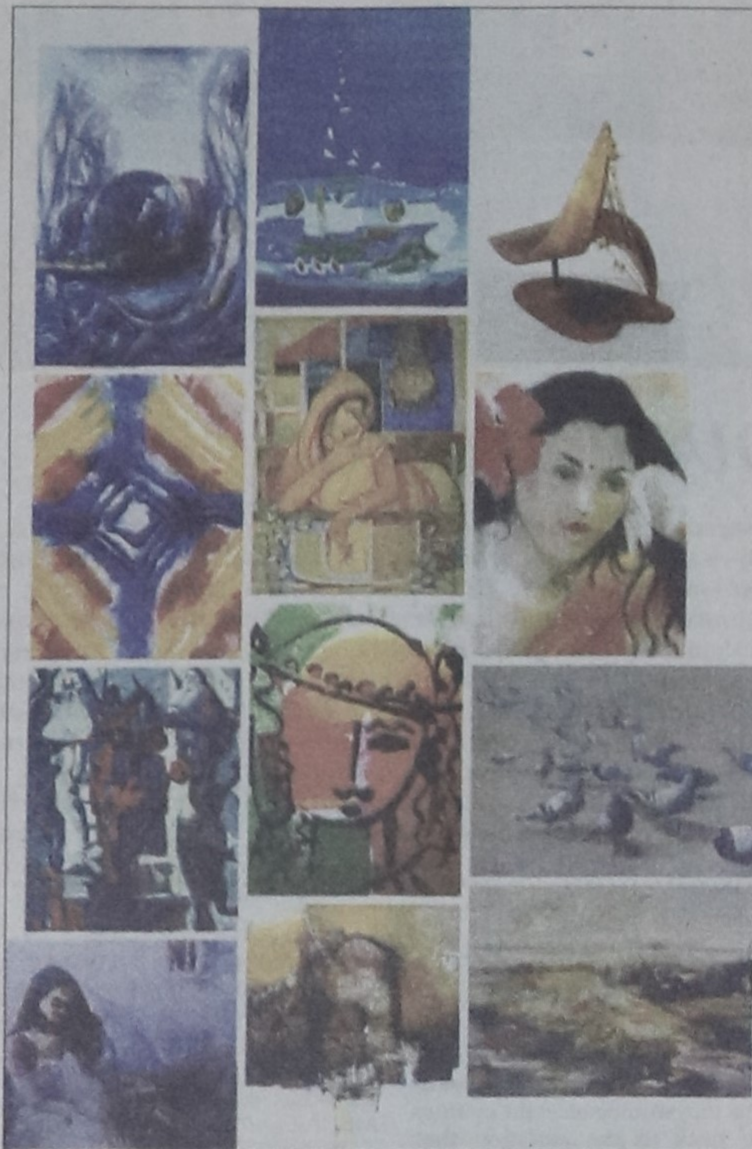
A collage of works by the artists