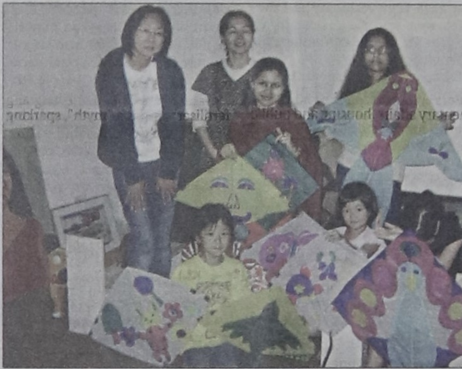
Youngsters at the workshop with kites

Like the last few years, Cubic Art School is organising a Kite festival this year as well, says a press release.