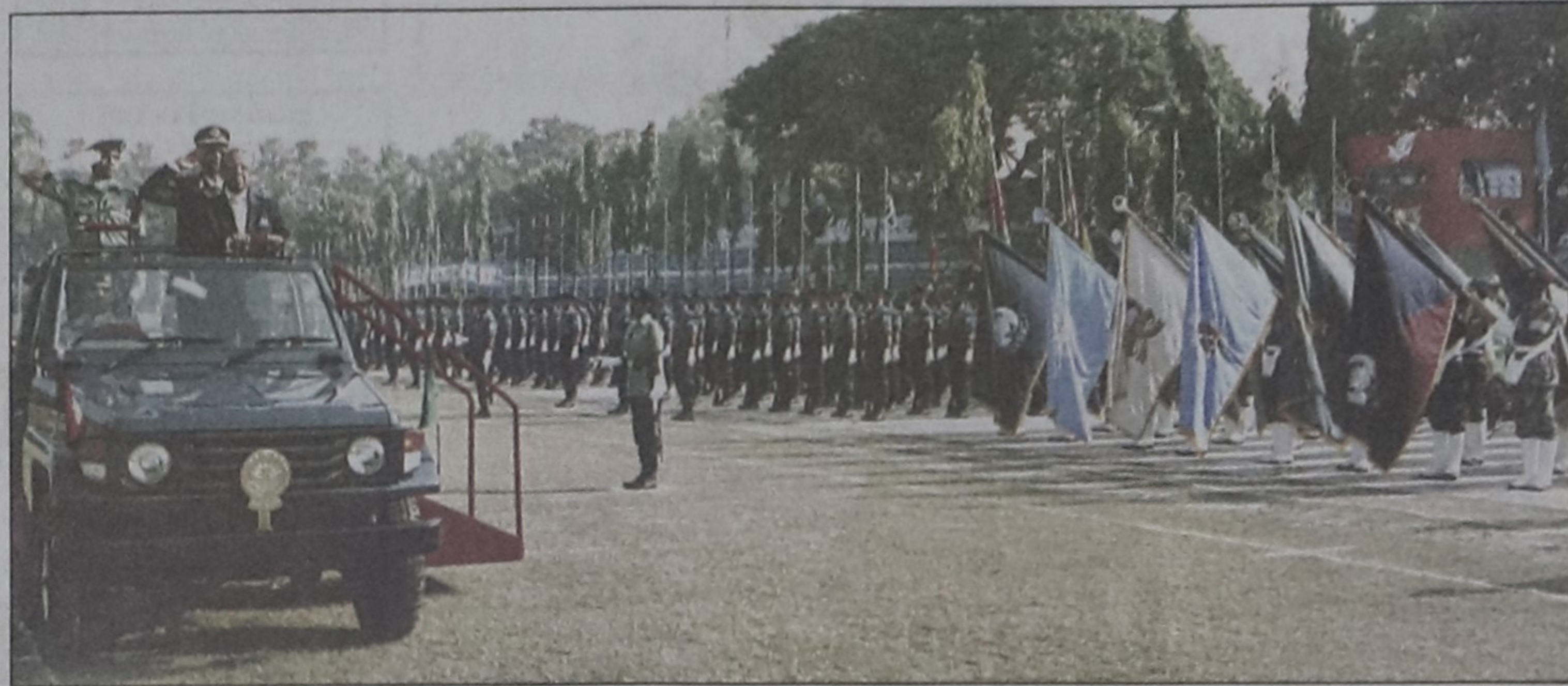
Chief Adviser Fakhruddin Ahmed inspects a guard of honour at the Inaugural ceremony of the Police Week-2008 at the Rajarbagh Police Lines parade ground in the city yesterday.