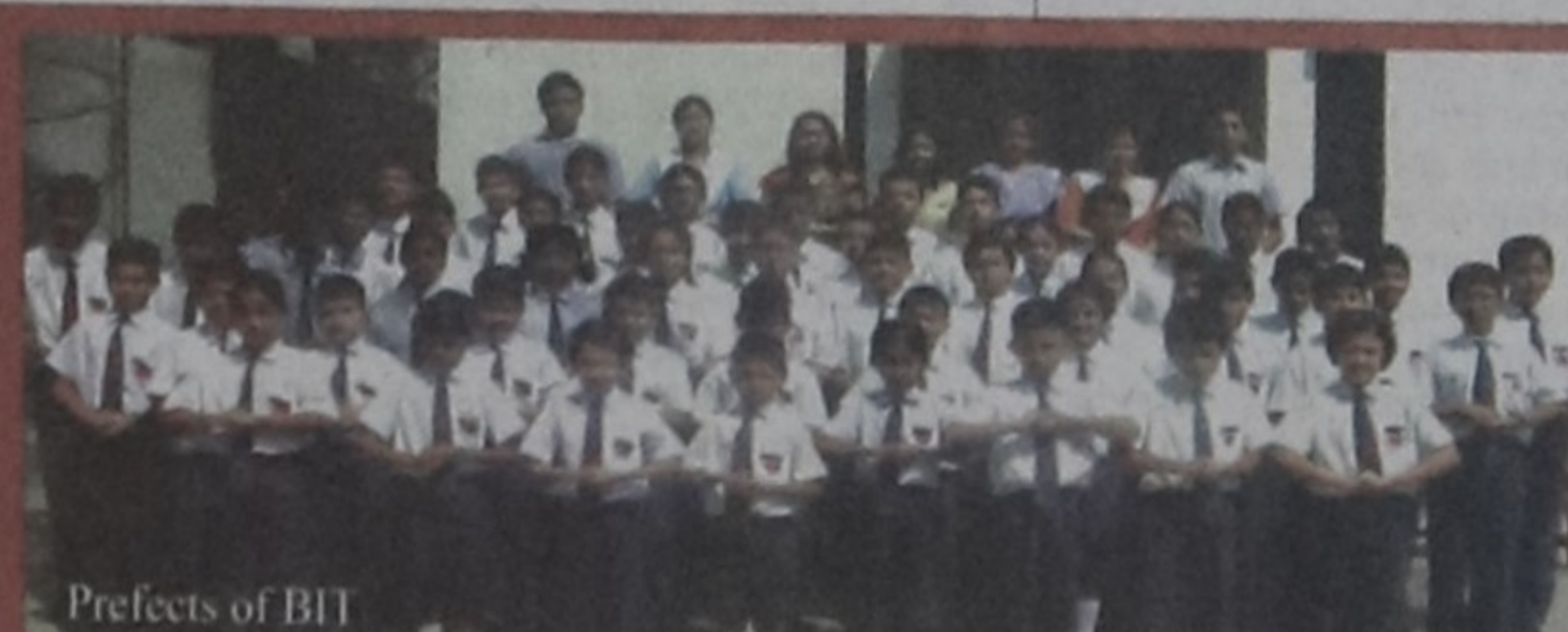
Prefects of BIT