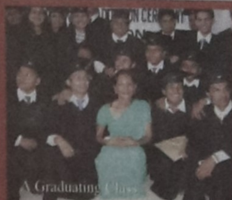
A Graduating Class

House # 02, Road # 128, Gulshan-1, Dhaka, Bangladesh. Telephone: 8810041, 9366016. Web site: www.bit-school.net