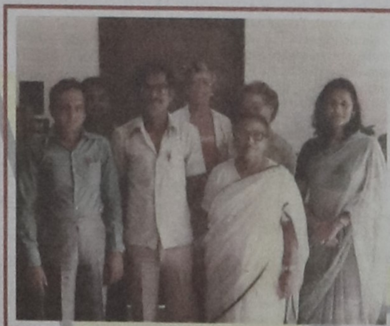
Founder Teachers of BIT