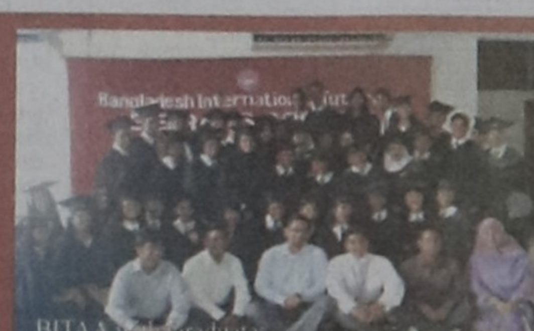
BITAA with Graduates