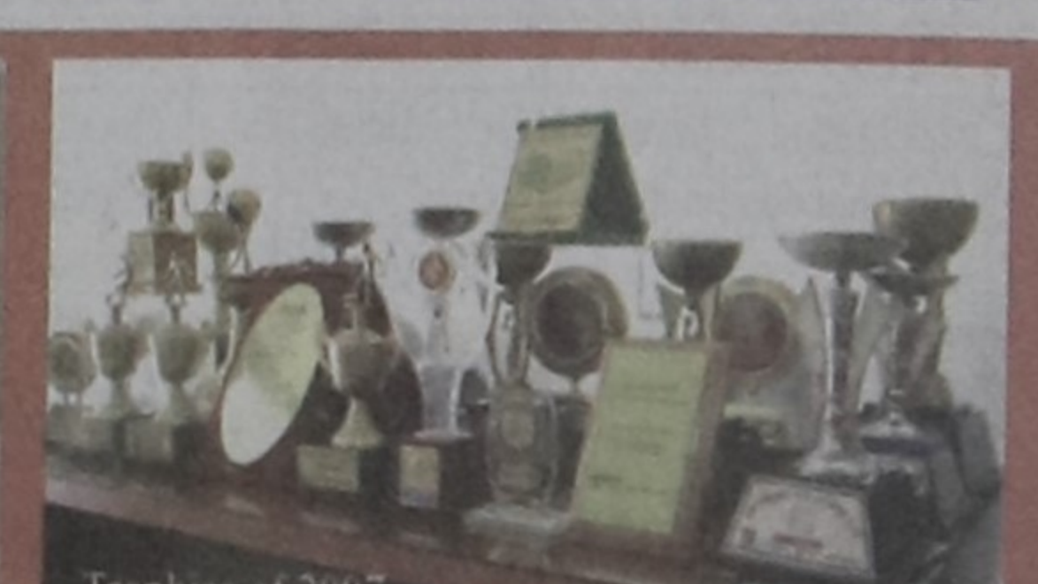
Trophies of 2007

Address of New Campus Plot # 13, Road # 1/A, Sector # 14 - Uttara Model Town, Dhaka, Bangladesh.