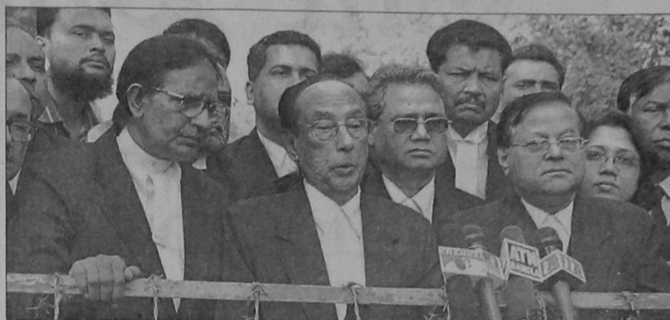
Awami League acting President Zillur Rahman speaks to the media after coming out of a special court on the Jatiya Sangsad Bhaban premises in the city yesterday.