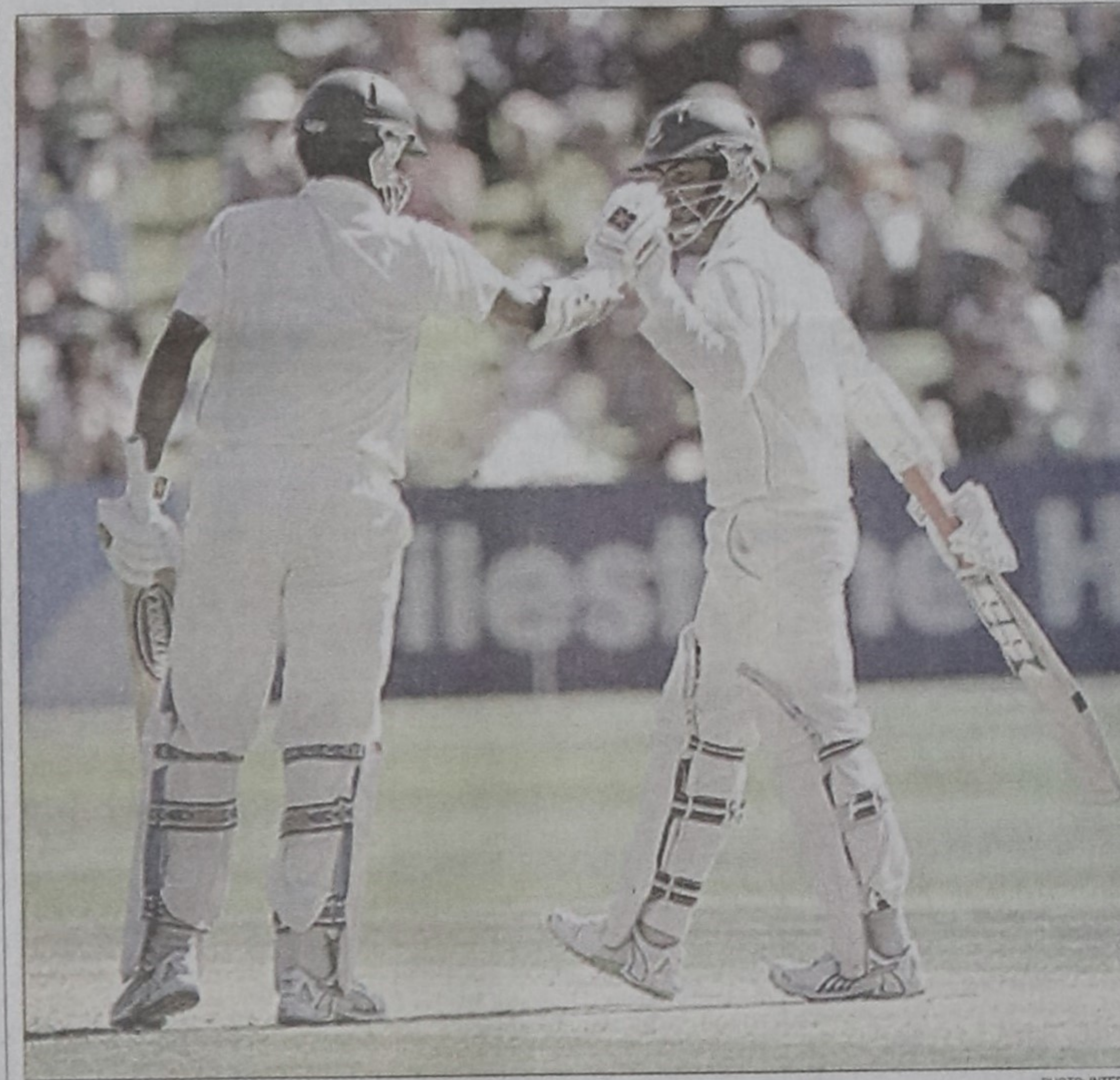
DREAM COME TRUE DEBUT: Debutant opening pair Tamim Iqbal (R) Zunaed Siddiqui complement each other during their record unbroken 148-run stand in Bangladesh's second innings in the first Test against New Zealand at Dunedin's University Oval yesterday.