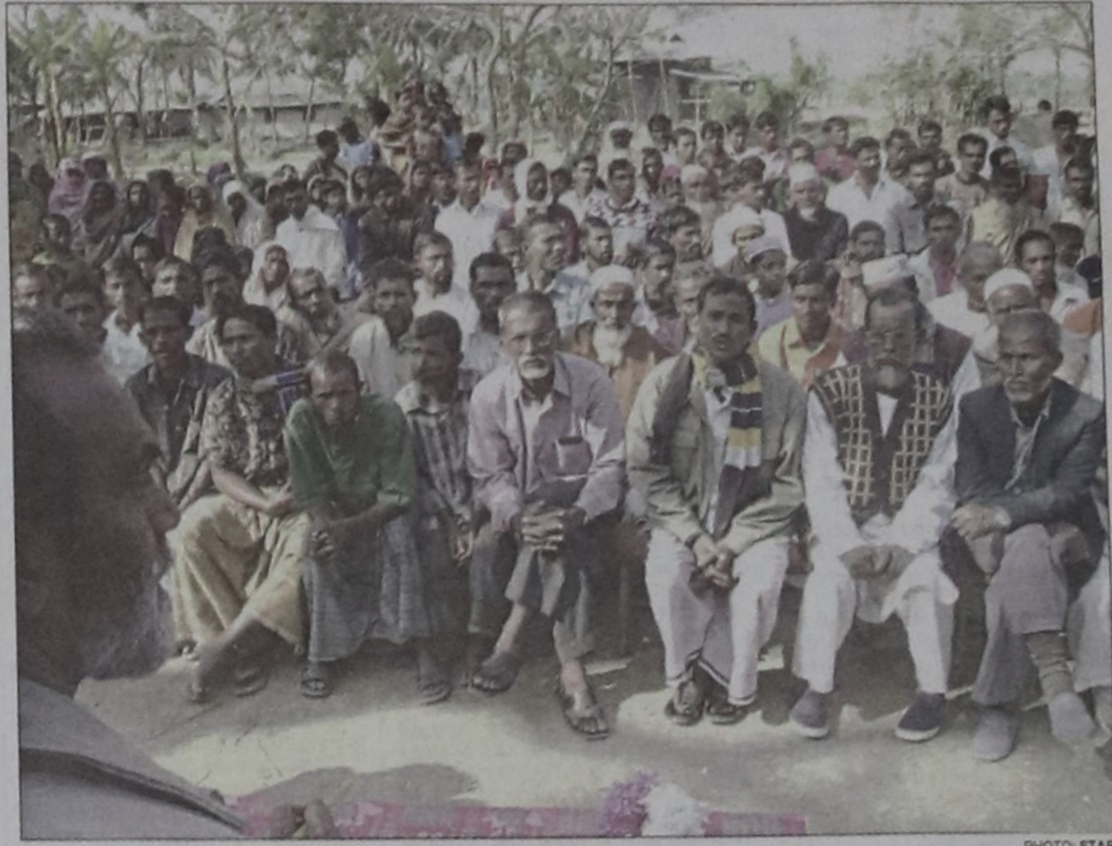
Freedom fighters including commanders of seven upazilas attend a meeting yesterday at Itbaria in Patuakhali as part of Mukti Joddha Sangsad's move to prepare a list of Razakars of the district.