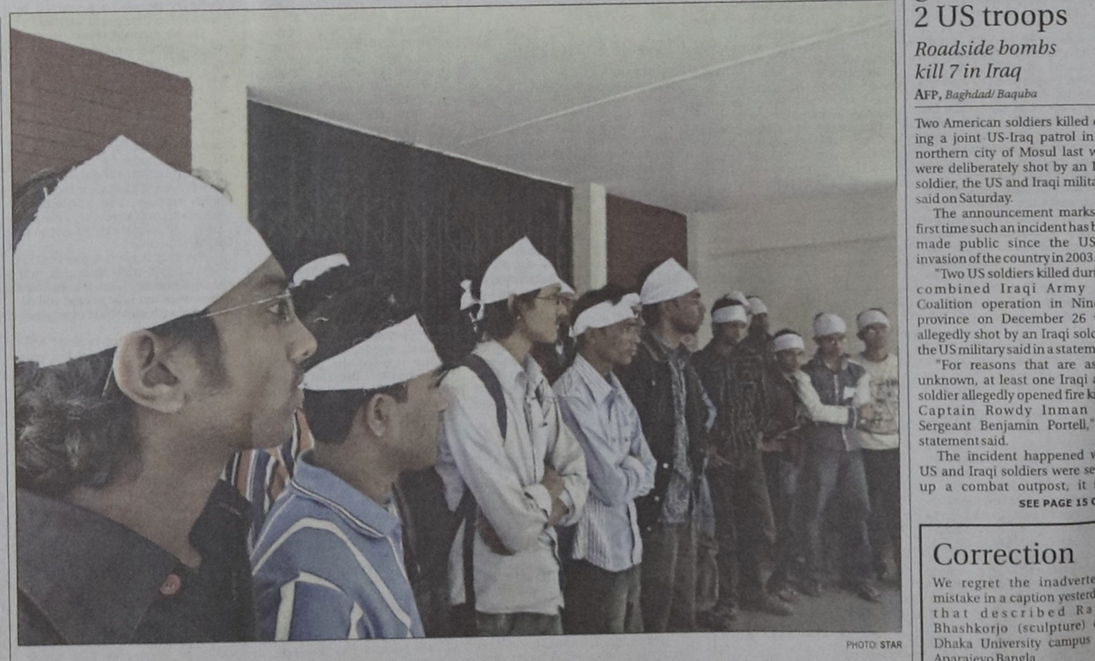
Students of Dhaka University wrapping burial clothes around their heads stage a sit-in yesterday demanding release of the detained teachers and students.