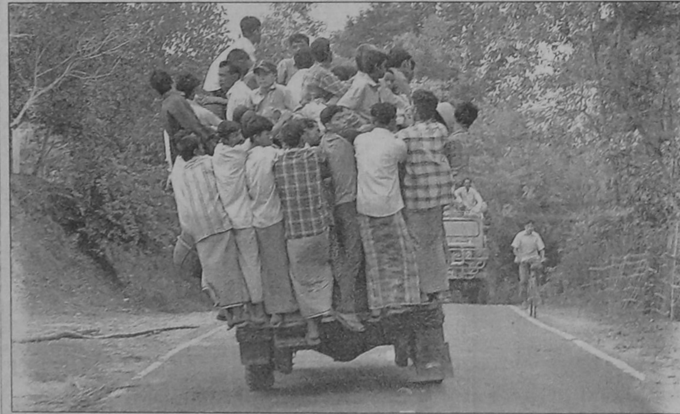
Commuters travel in a jeep, known as Chander Gari, on Nazirhat-Fatikchhari-Manikchhari road in Khagrachhari yesterday, risking their lives. Such vehicles are the main mode of transport for local people. Accidents are commonplace, but the practice still exists.