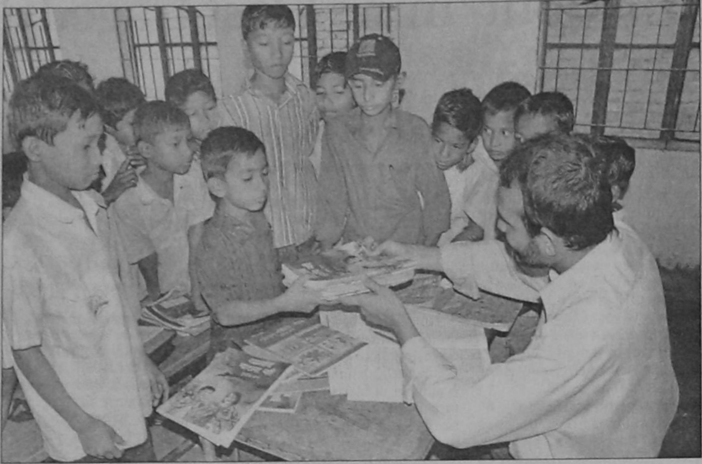
A teacher of Bakchar Government Primary School at Shyampur in Dhaka distributes textbooks among the students of class three yesterday at the beginning of new academic year.