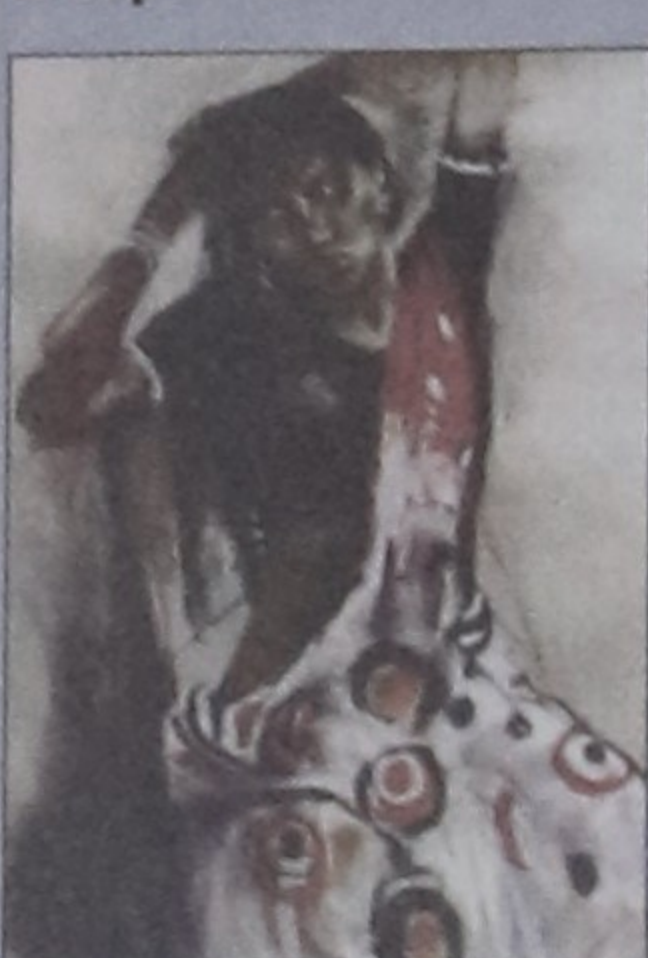
Title: 10+2 SOULS Venue: Shipangan Gallery, House 26, Road 3, Dhanmondi Date: January 3-12 Time: 12pm-8pm