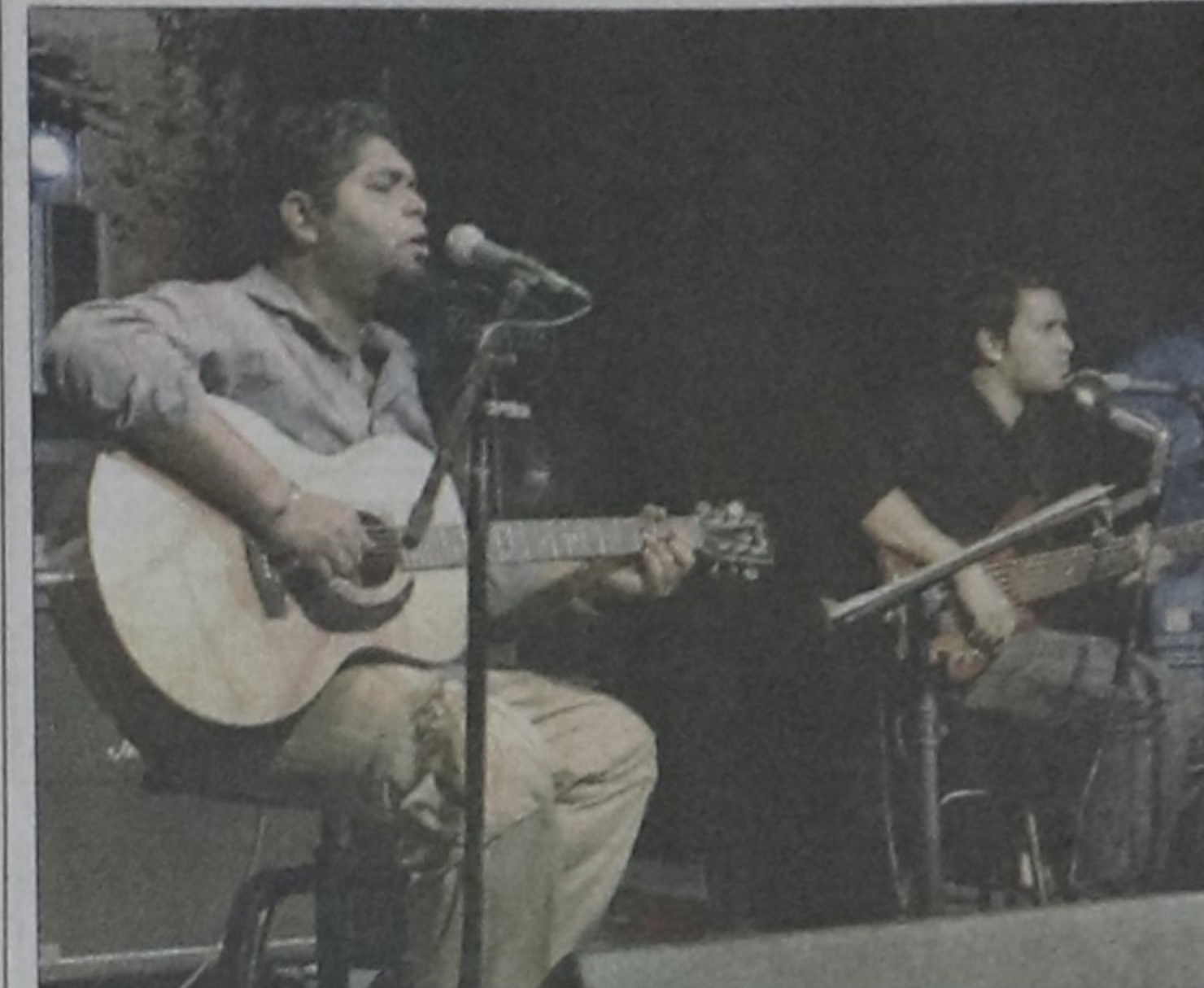
Artcell seen performing at the concert