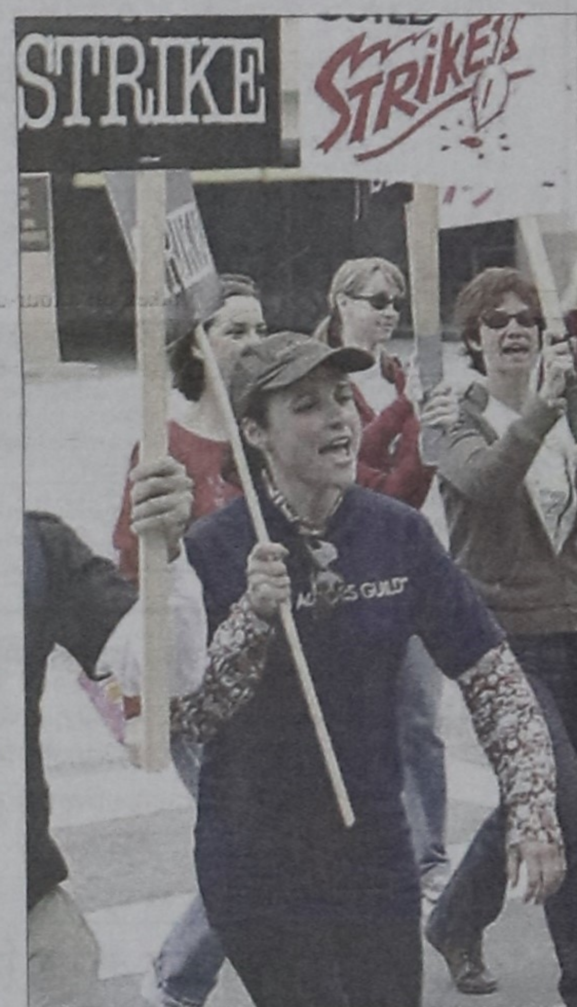
Pickers protesting Golden Globe Awards