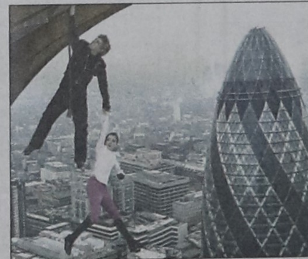
Stormbreaker On Star Movies at 7:00 pm Genre: Action/Adventure Cast: Alex Pettyfer, Sarah Bolger

All programmes are in local time. The Daily Star will not be responsible for any change in the programme.