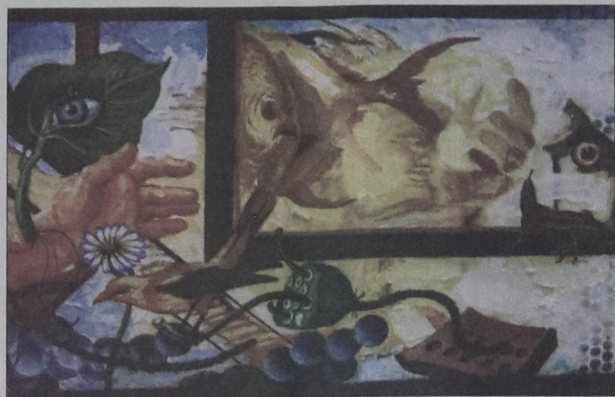
Sample of art works by the seven artists, seen at Bengal Gallery