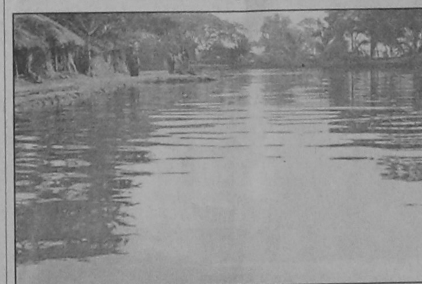
Persistent water-logging leaves croplands in Kulia union in Debhata upazila uncultivated for years.