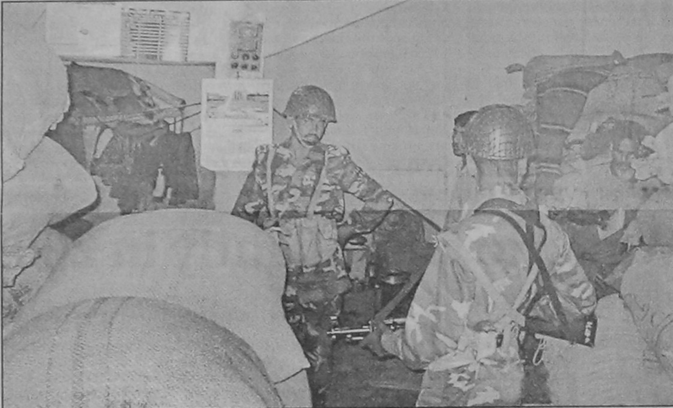
Joint forces inquire about prices and supply at wholesale rice markets at Kumarpara in Rajshahi yesterday.

Prospect of good jobs in India allured them as they were starving in the village, Bilkis told newsmen.