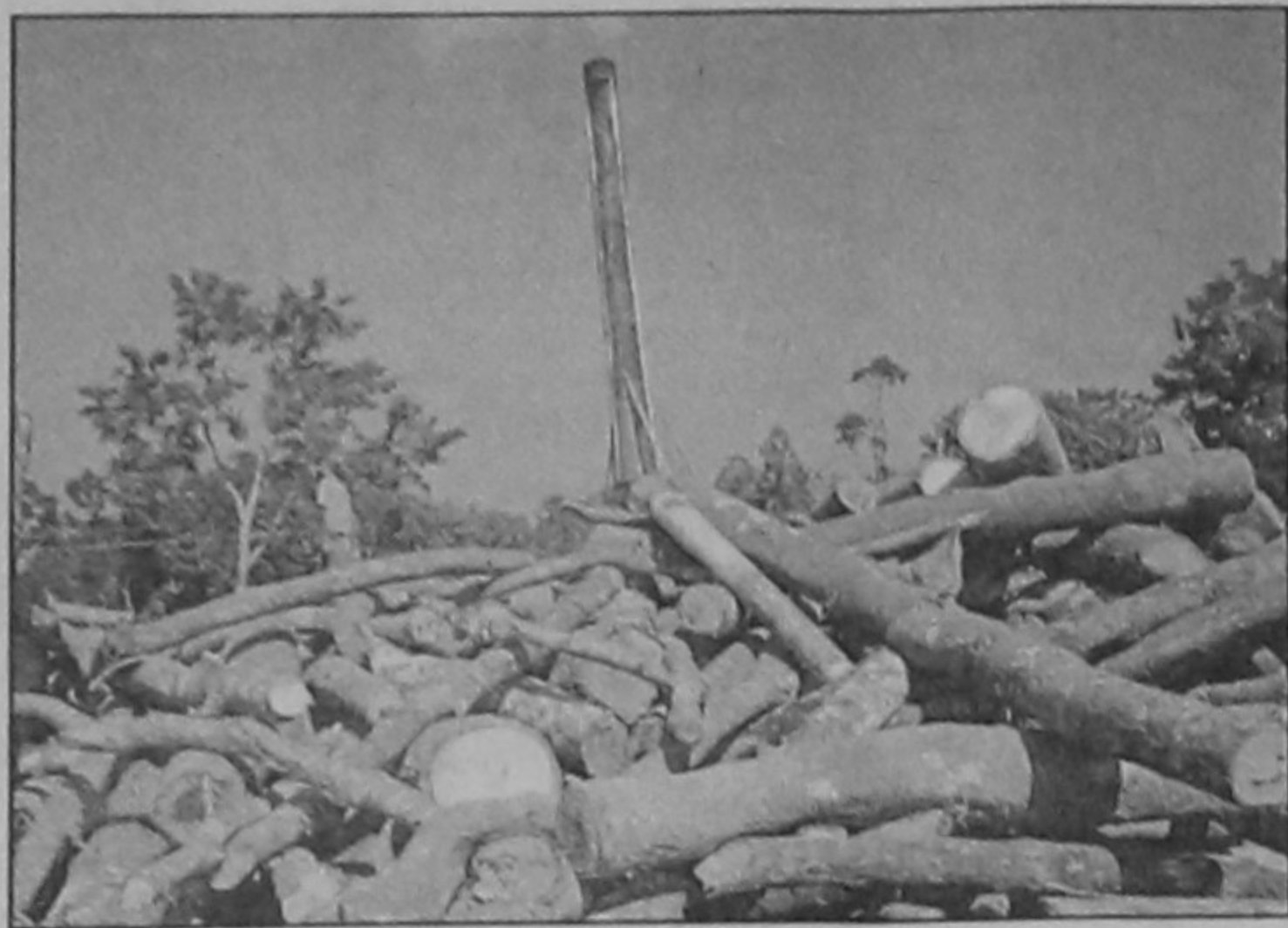
Firewood piled up for use at a brickfield in Matiranga upazila in Khagrachhari.

Most of the brickfields are near human habitations, urban areas