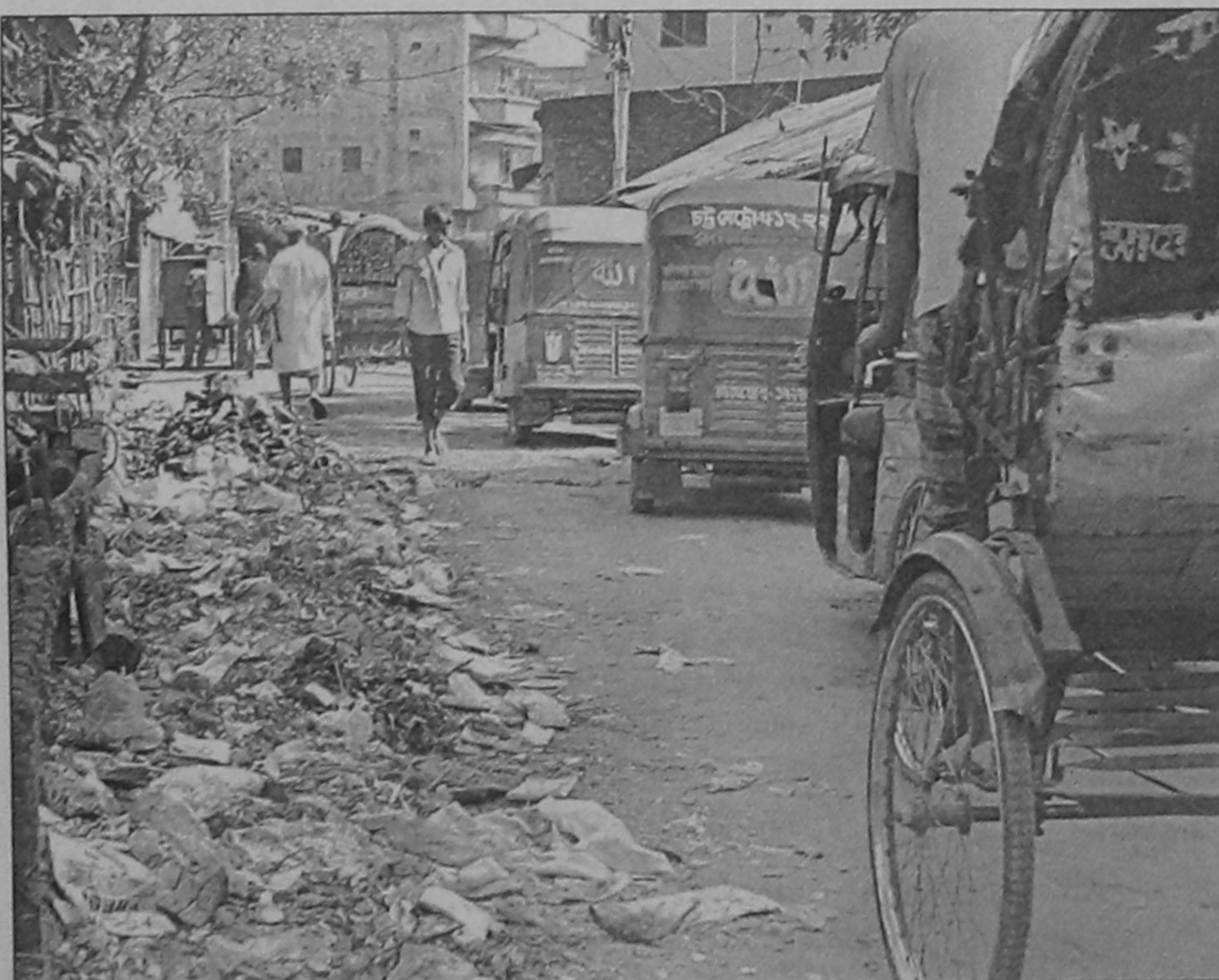
Haphazard dumping of garbage on the roadside at Ashraf Ali Road in Chittagong adds to suffering to passers-by and local people, but the authorities remain indifferent. The picture was taken yesterday.