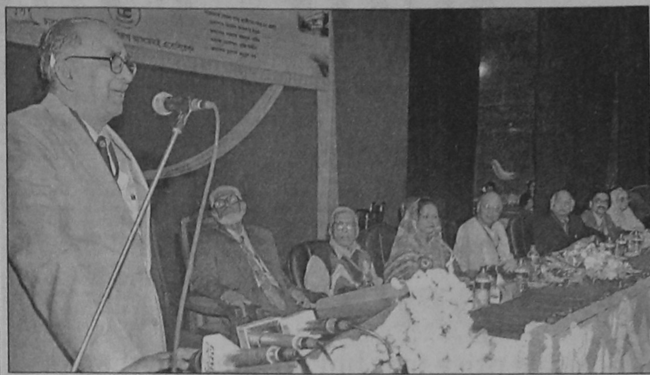
Justice Muhammad Habibur Rahman speaks at the reunion of Dhaka University Philosophy Department Alumni Association at Teacher Student Centre (TSC) yesterday.

The organisation has also undertaken an assessment of the affected regions to establish reconstruction and rehabilitation needs and then determine how it be of further assistance to the cyclone victims, says a FOCUS handout.