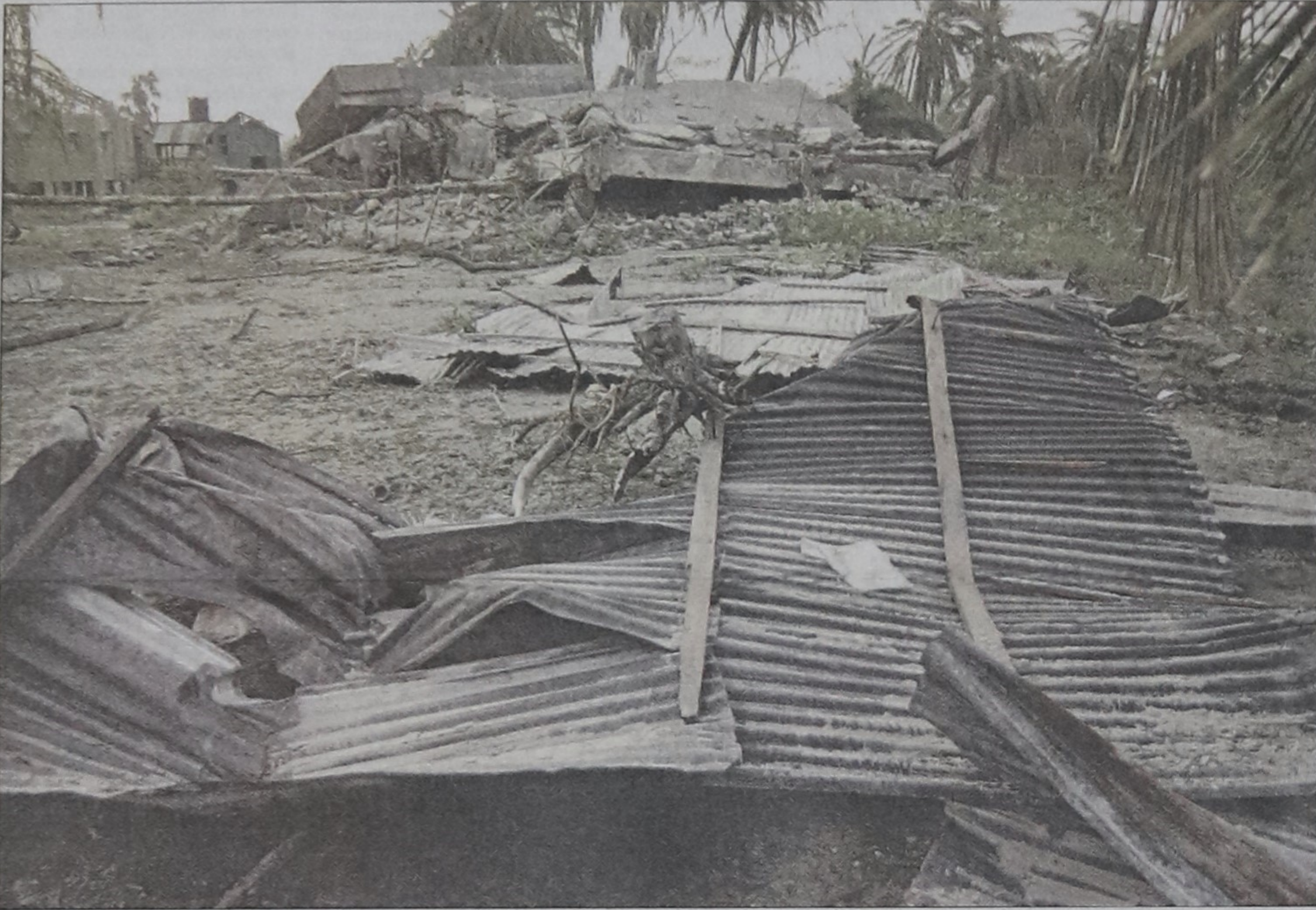
The authorities are yet to take any step to reconstruct the Forest Office at Kotka in the Sundarbans devastated by Cyclone Sidr on November 15 last year.