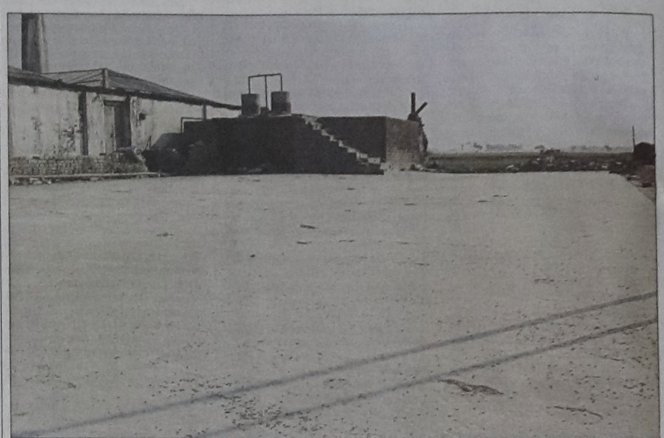
This rice mill in Kahalu upazila of Bogra is closed due to lack of supply of paddy. Around 5,000 mills are sitting idle in northern districts.