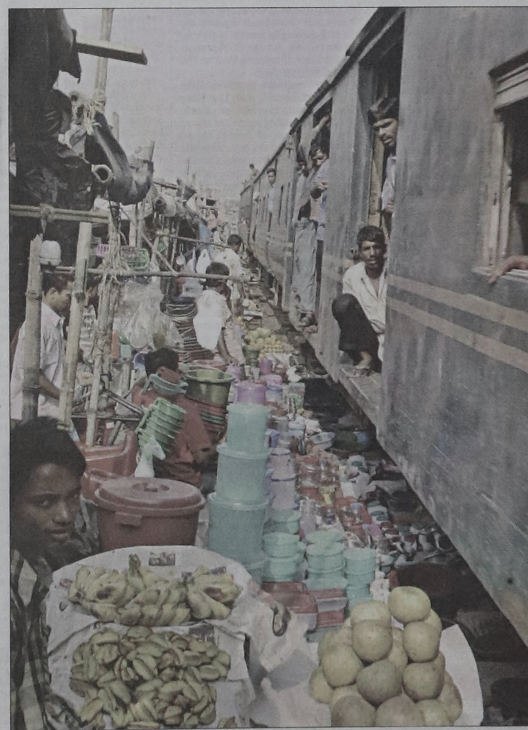
Vendors run business just beside Dhaka-Narayanganj rail tracks at Jurain in the city, risking their and the customers' lives.