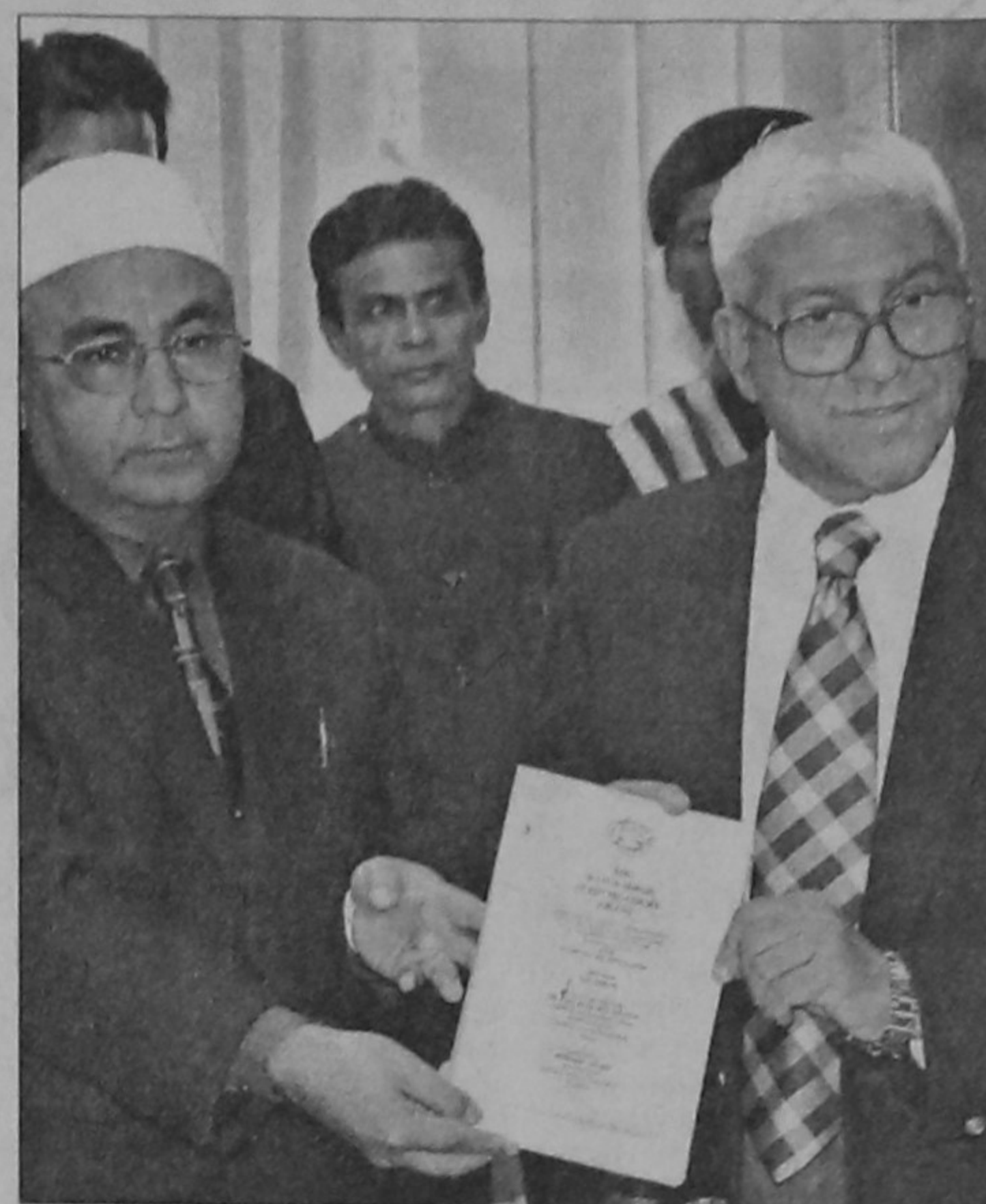
Chief Justice M Ruhul Amin unveils the cover of the book 'The Bangladesh Supreme Court Digest' at the Judges' Lounge at Supreme Court in the city yesterday.

About a separate secretariat for the apex court following the judiciary separation, he said the matter is under consideration while work on this is going on.