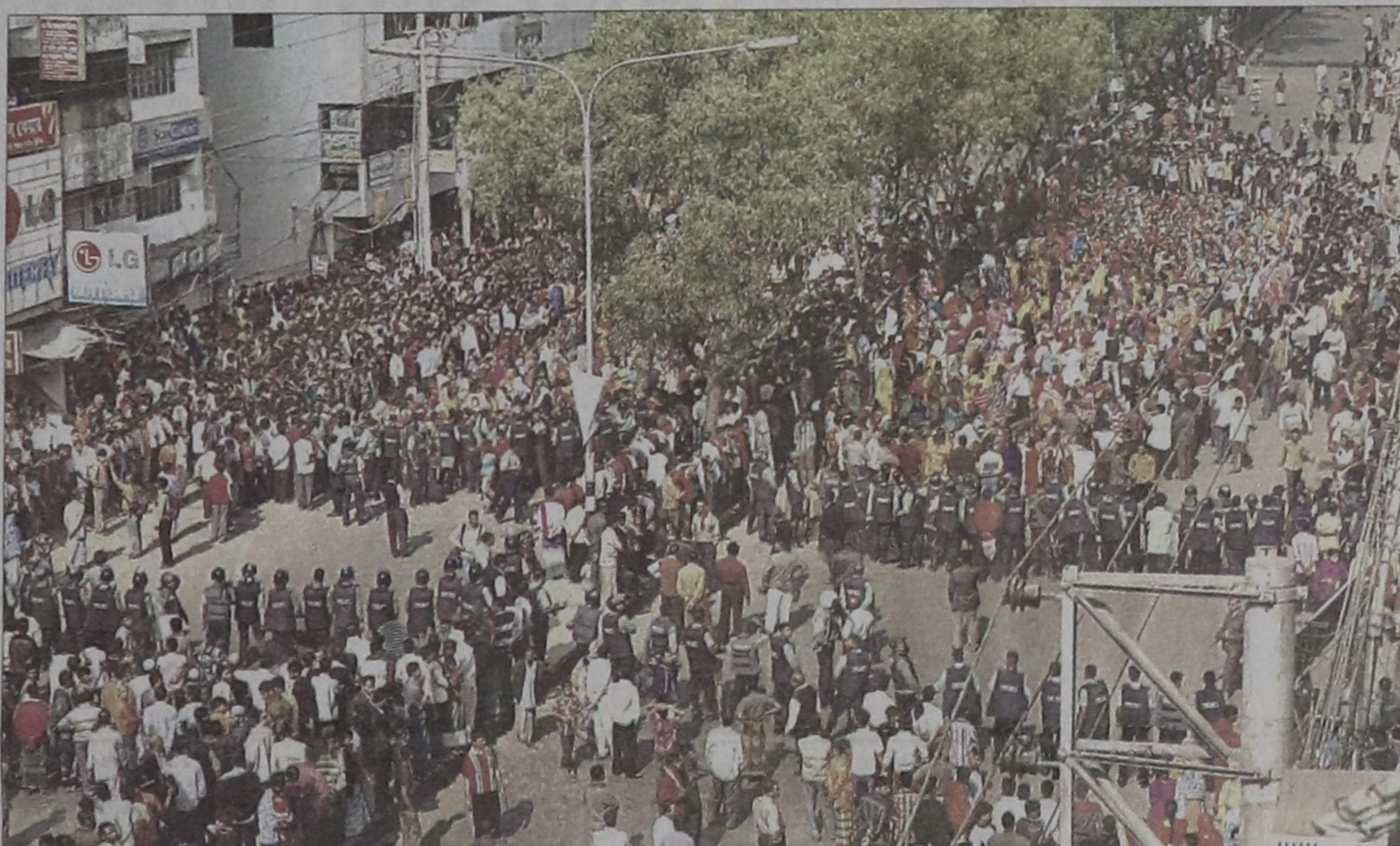
Workers of garment factories on and around Rokeya Sarani in the capital blockaded the street at Sheorapara for nearly 12 hours yesterday. They were protesting the closure of a factory and demanding trial of those responsible for allegedly forcing an ill female worker of the factory to work, which reportedly caused her death.