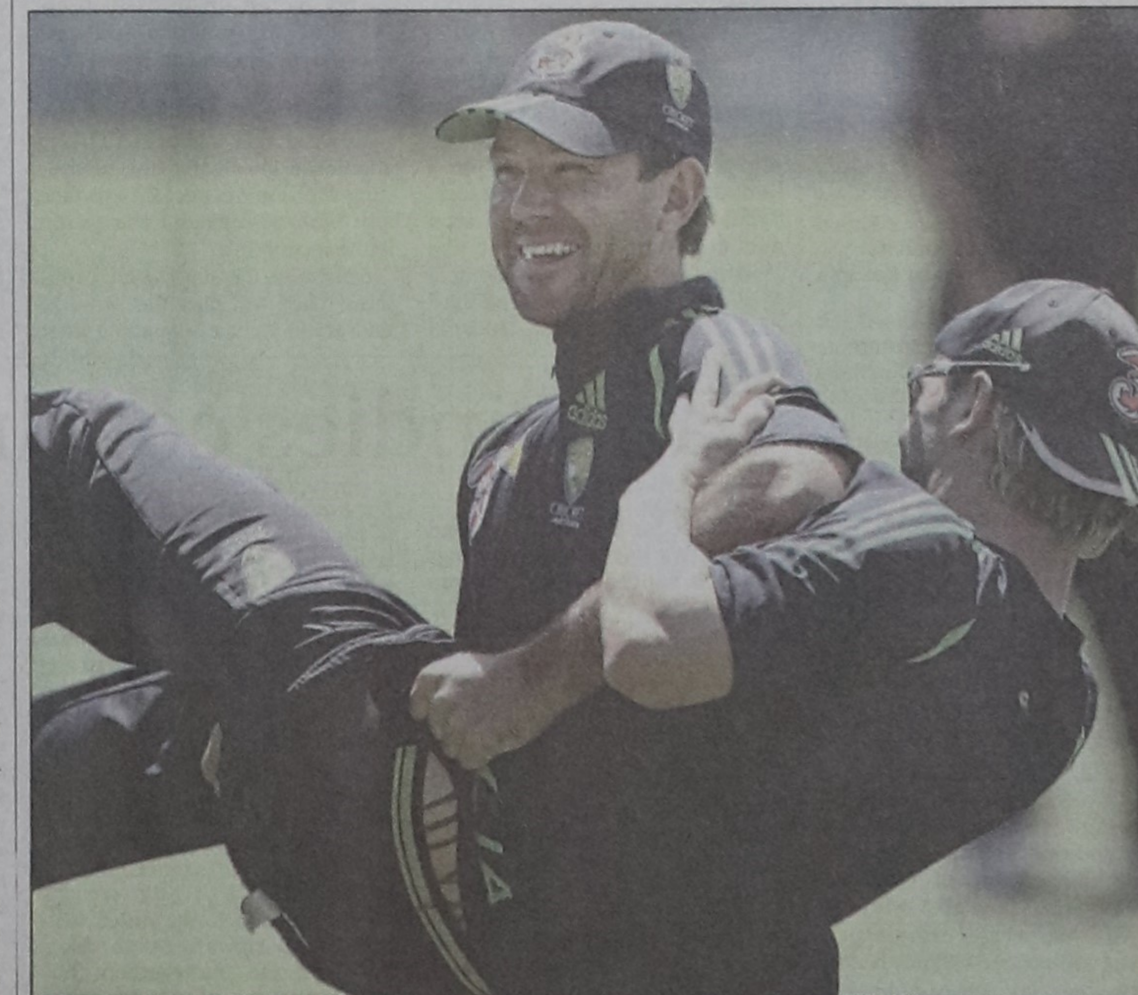
Australia captain Ricky Ponting wrestles in fun with teammate Michael Clarke (below) during a training session at the Sydney Cricket Ground yesterday.