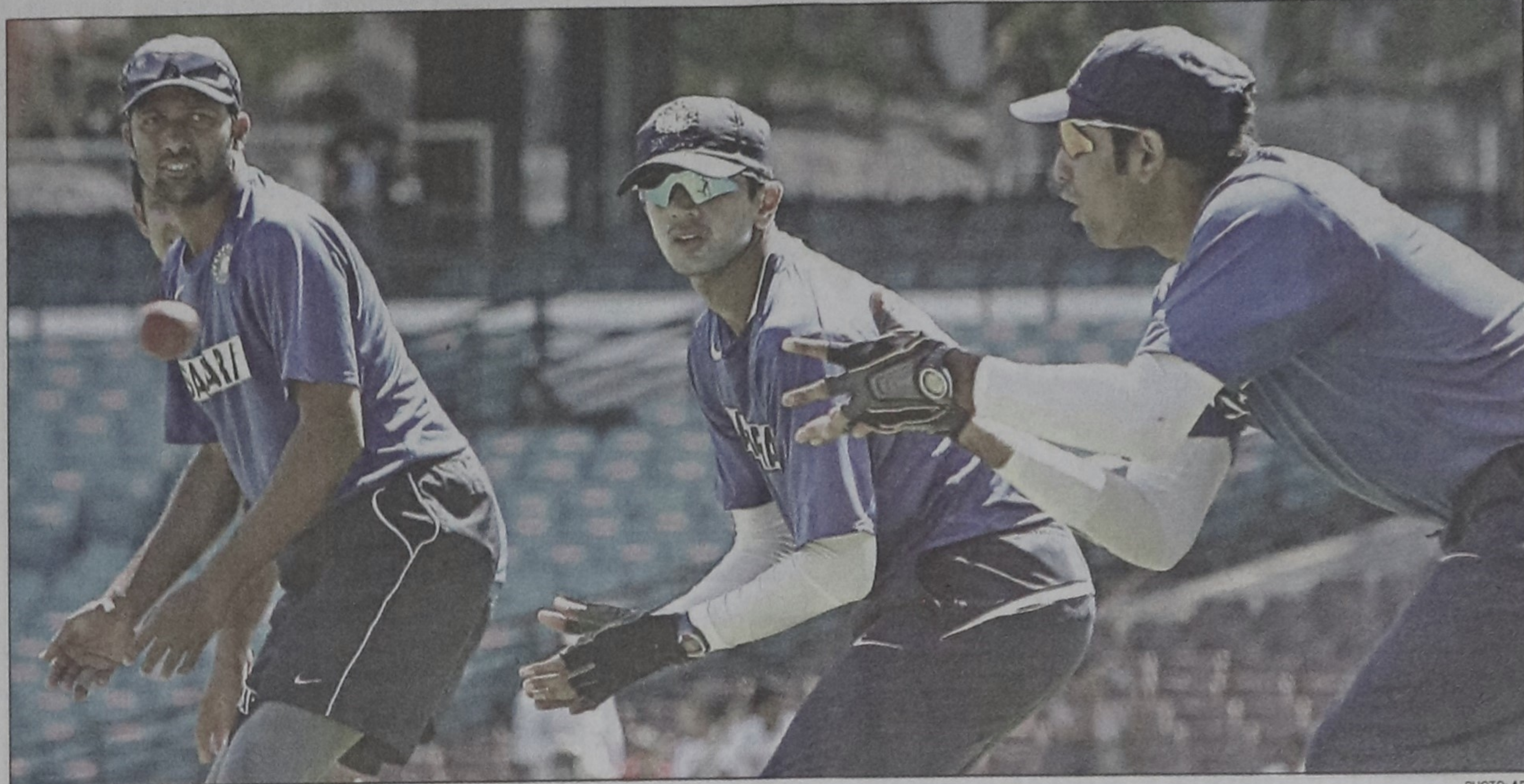
Indian players Wasim Jaffer (L) and Rahul Dravid (C) look on as VVS Laxman (R) is about to take a catch during a training session at the Sydney Cricket Ground on Tuesday ahead of today's second Test match against Australia.