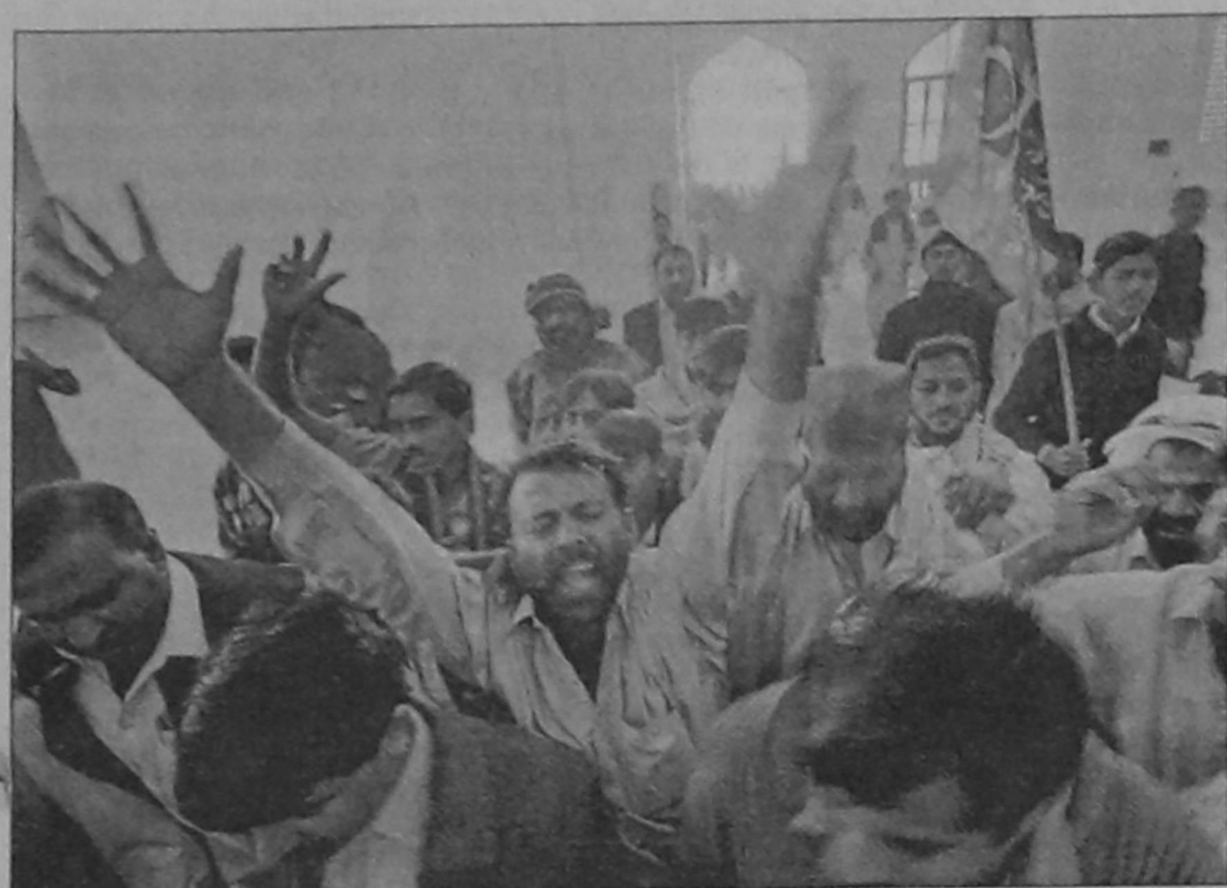
Supporters of slain former Pakistani prime minister Benazir Bhutto's Pakistan People's Party (PPP) shout anti-government slogans beside her grave at the Bhutto family mausoleum in Garhi Khuda Bukash yesterday. Benazir Bhutto was slain just hours before she was to go public with "proof" that Pakistani intelligence and electoral officials were planning to rig polls, an official from her party said.

Relations between Sudan and the United States have long been strained, most recently over the near five-year conflict in the western region of Darfur where Washington has accused the Khartoum of genocide.