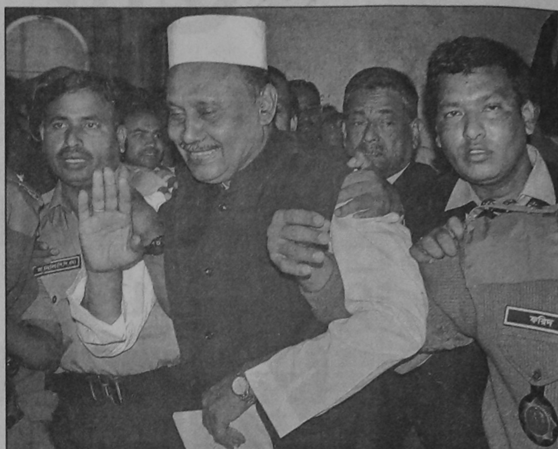
Chittagong City Corporation Mayor ABM Mohiuddin Chowdhury was produced before a Chittagong court yesterday.

The report also said 126 patients died due to negligence of doctors.