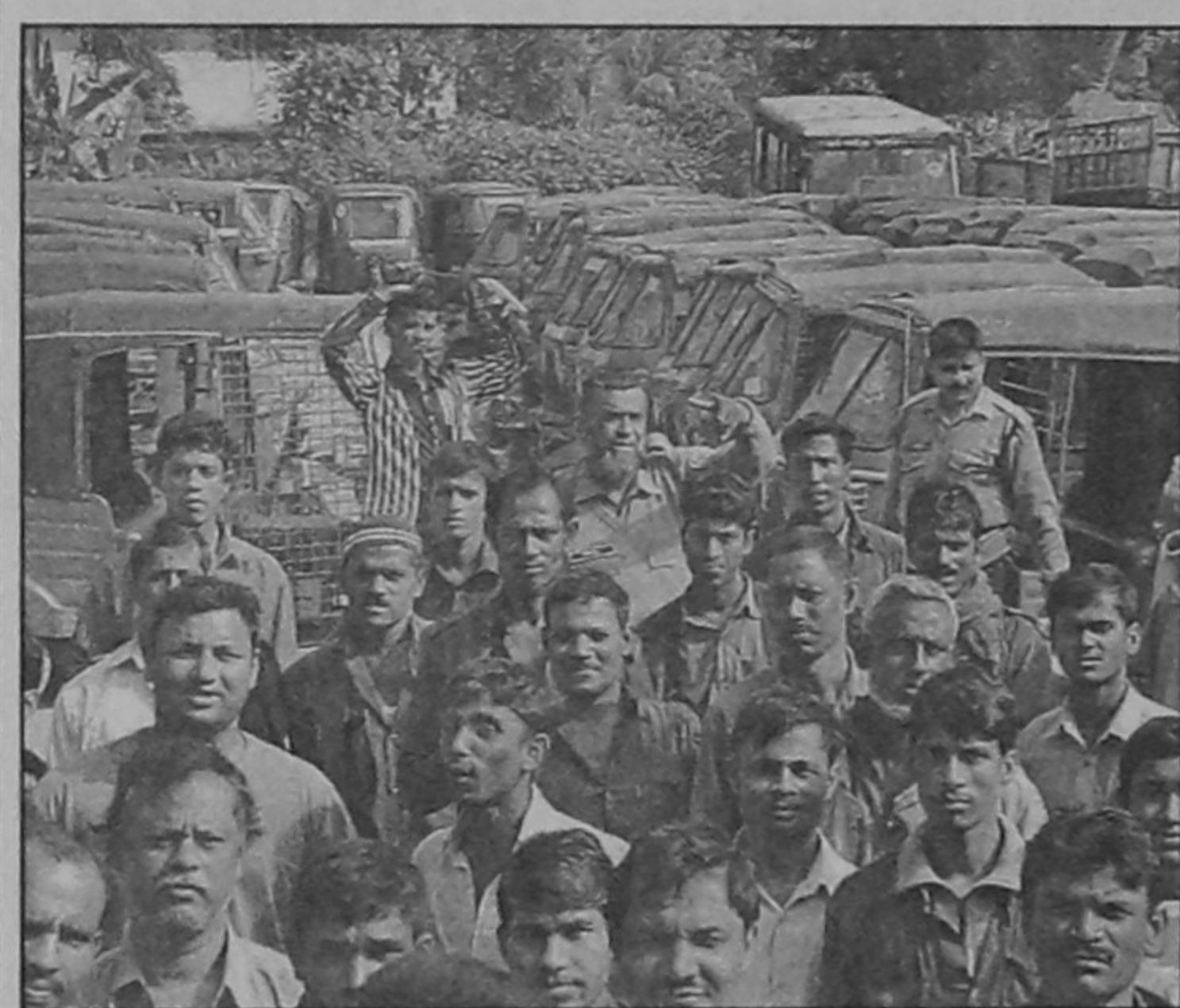
Chittagong metropolitan police seize many CNG-run autorickshaws without meter in the port city yesterday.

He said the discussion was held in a congenial atmosphere and it was positive and fruitful.