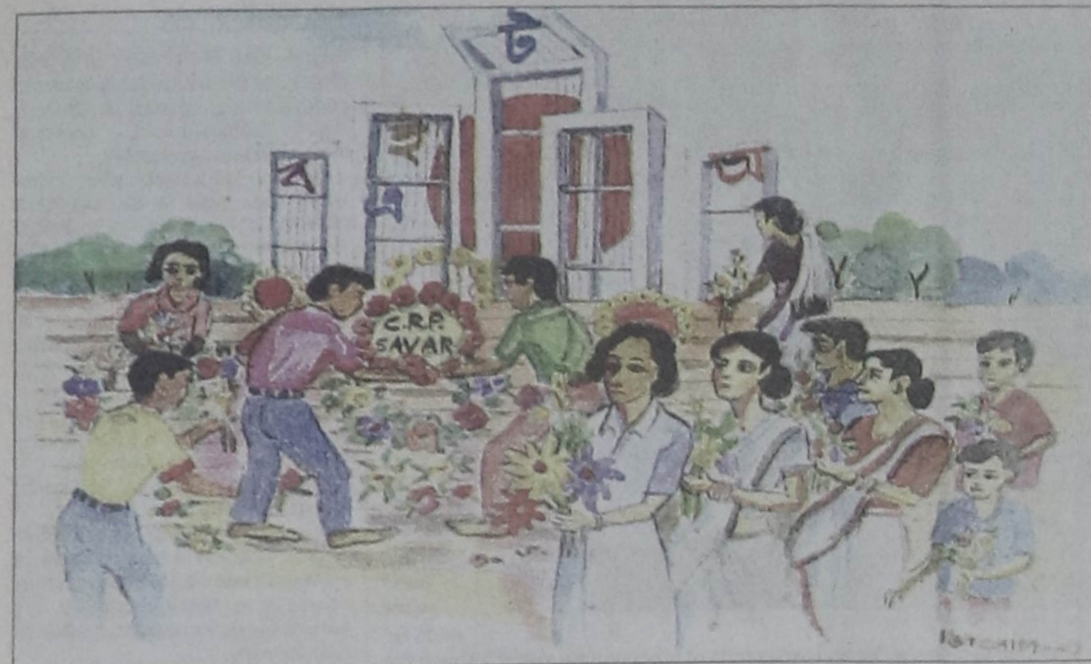
Colourful artworks by differently-abled youngsters featured in CRP's calendar