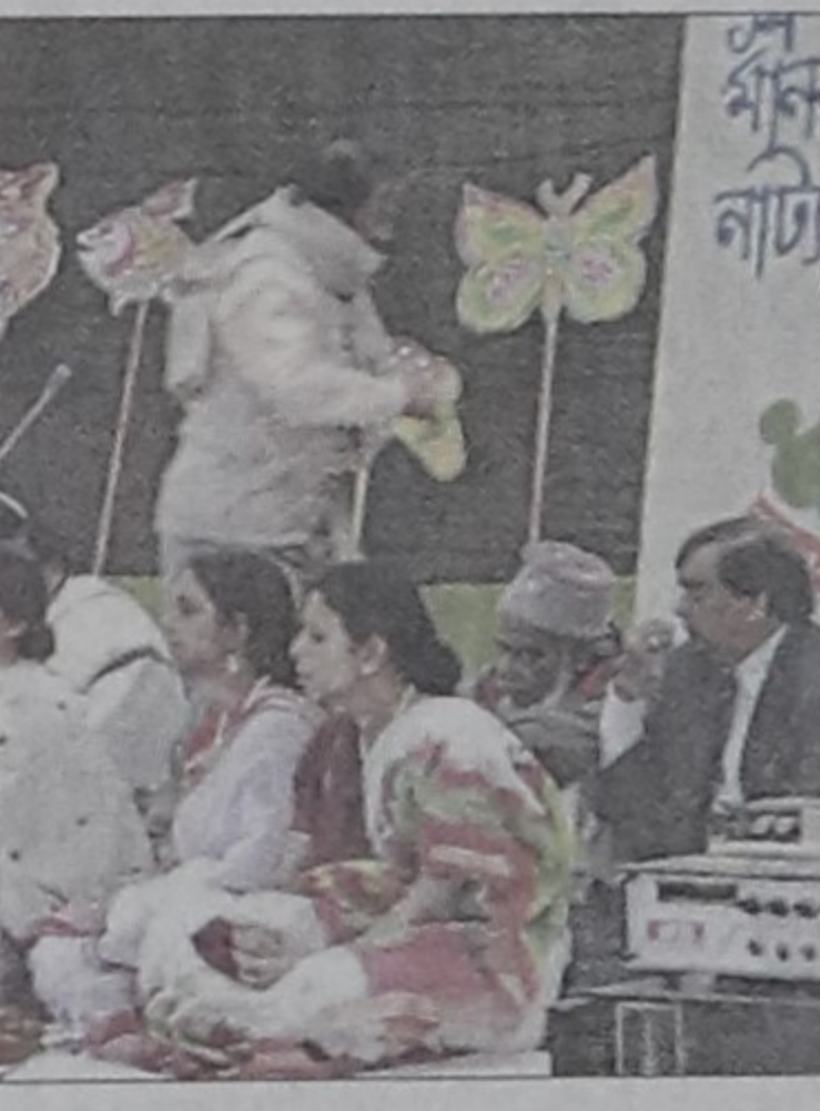
Artists of Jaipurhat Rabindra Sangeet Sammilan Parishad sing at the festival