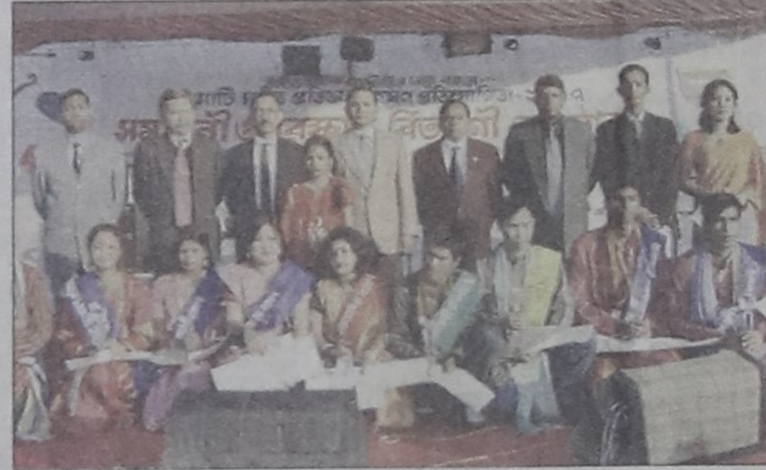
The top ten contestants seen with the chief guest at the prize giving ceremony