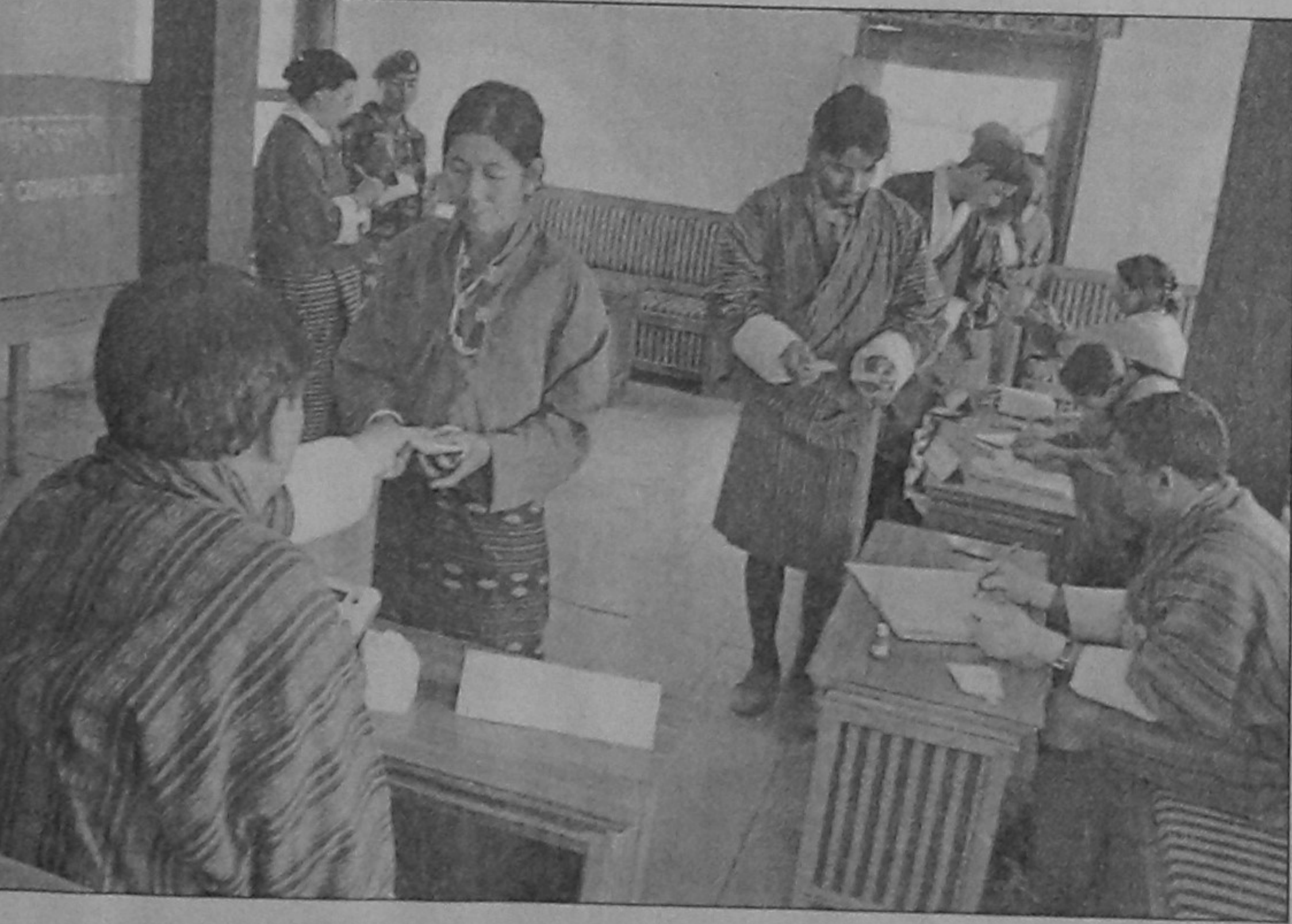
Bhutanese citizens register with officials to cast their votes in general elections at Pashaka polling station in Jaigaon, some 45kms from the Indo-Bhutanese border yesterday. The Himalayan outpost of Bhutan is staging its first parliamentary polls this week as the kingdom steers away from royal rule, but officials worry many voters will stay away.