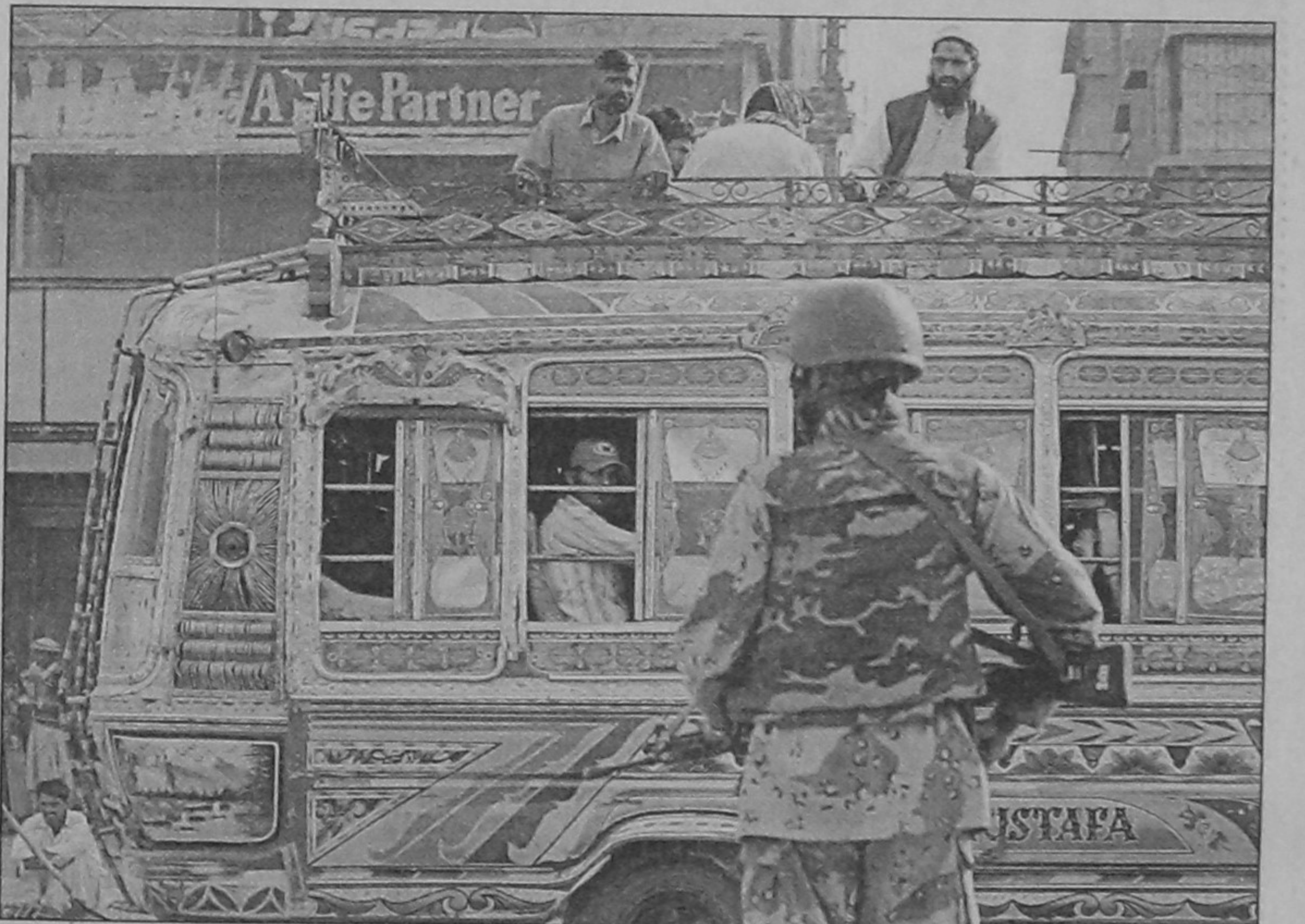
A Pakistani soldier stands guard as a bus passes by in the streets of Karachi yesterday. Millions of Pakistanis have ventured out into the streets of major cities for the first time in three days, as violence eased after the end of an official mourning period for slain political Benazir Bhutto.